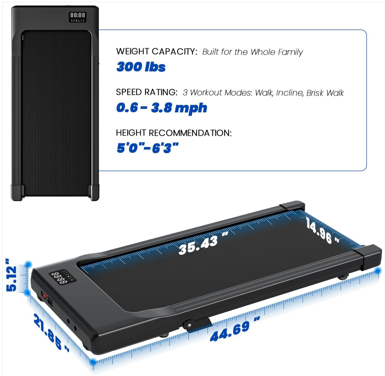
Figure 3.1: DeerRun Walking Pad Treadmill Ready for Use