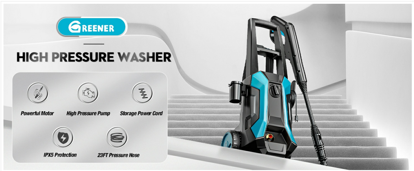
Image: Overview of key features including motor, pump, and hose length.