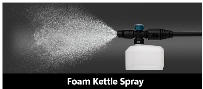
Foam Kettle Spray

Image: All-in-one adjustable nozzle demonstrating various spray patterns.