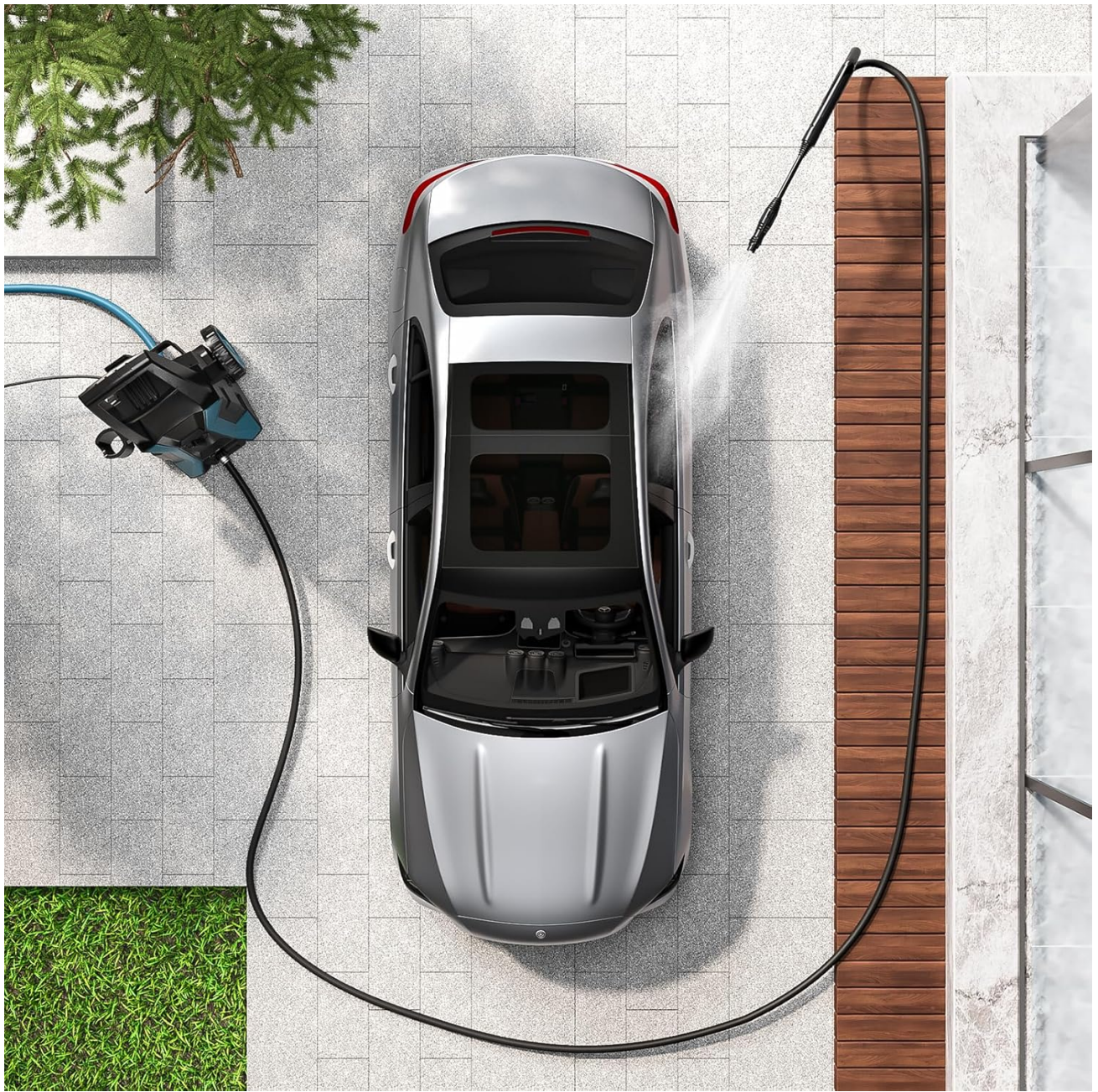
Image: Pressure washer unit and included accessories.