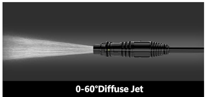
0-60° Diffuse Jet