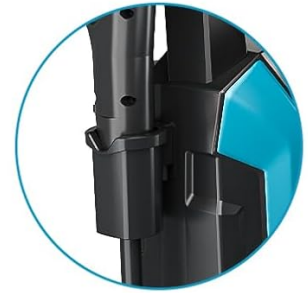
Spray Gun Holder