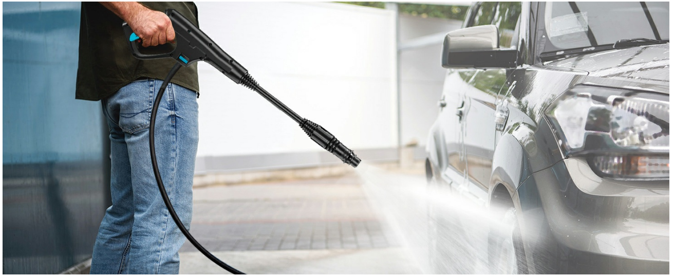
Image: Adjustable nozzle demonstrating various spray patterns.

Note: The water pressure decreases as the injection angle increases.