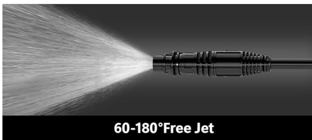
60-180° Free Jet