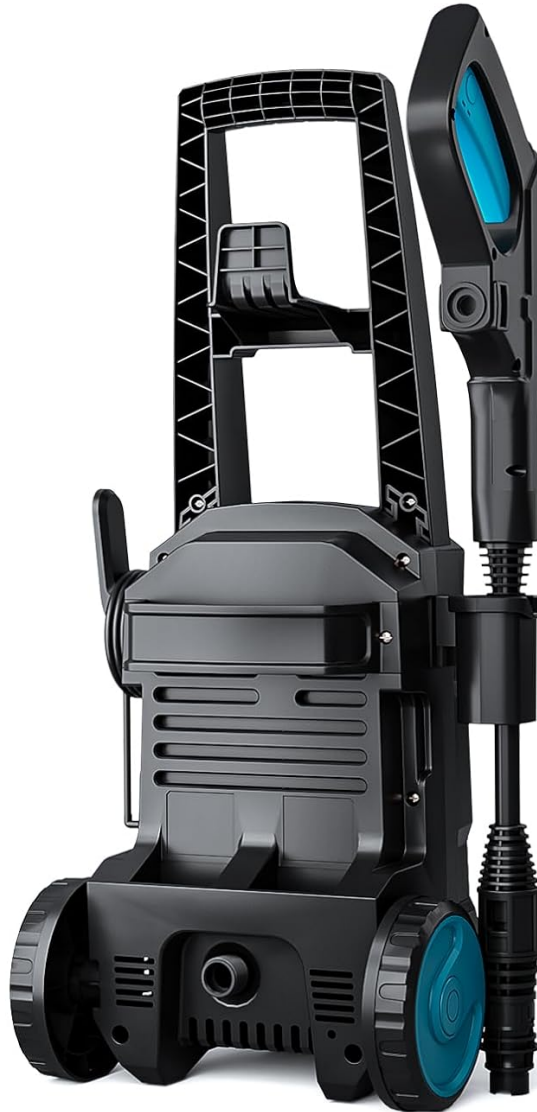
Image: Using the pressure washer in soap mode with the foam cannon.