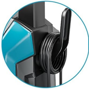
Power Cord Hook