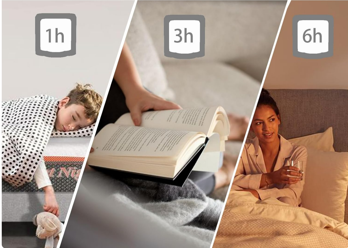
Figure 5: Timer function for 1, 3, or 6 hours.