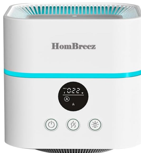
Figure 1: HomBreez WG-03 Air Purifier and Humidifier Combo