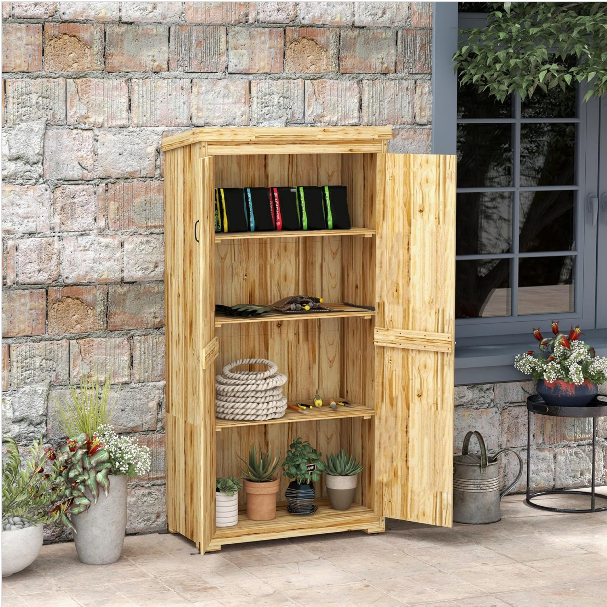
Image: The Outsunny wooden garden shed with its doors open, showcasing the spacious interior with three shelves, ideal for organizing garden tools, toys, and other outdoor supplies.