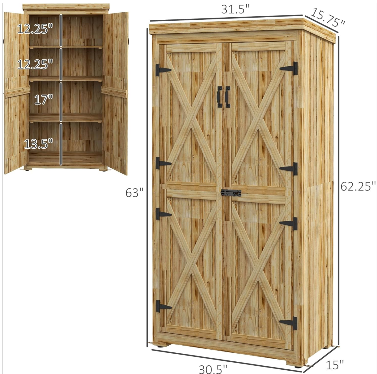
Image: A detailed diagram illustrating the overall dimensions of the Outsunny wooden garden shed, including width, depth, and height, as well as internal shelf and door measurements.