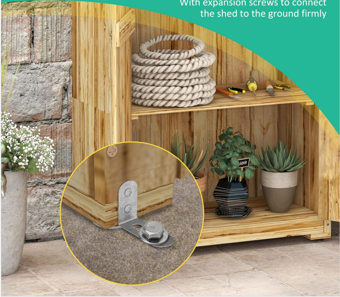
Image: A close-up showing the expansion screws used to firmly connect the shed to the ground, ensuring stable standing and preventing movement.

With expansion screws to connect the shed to the ground firmly