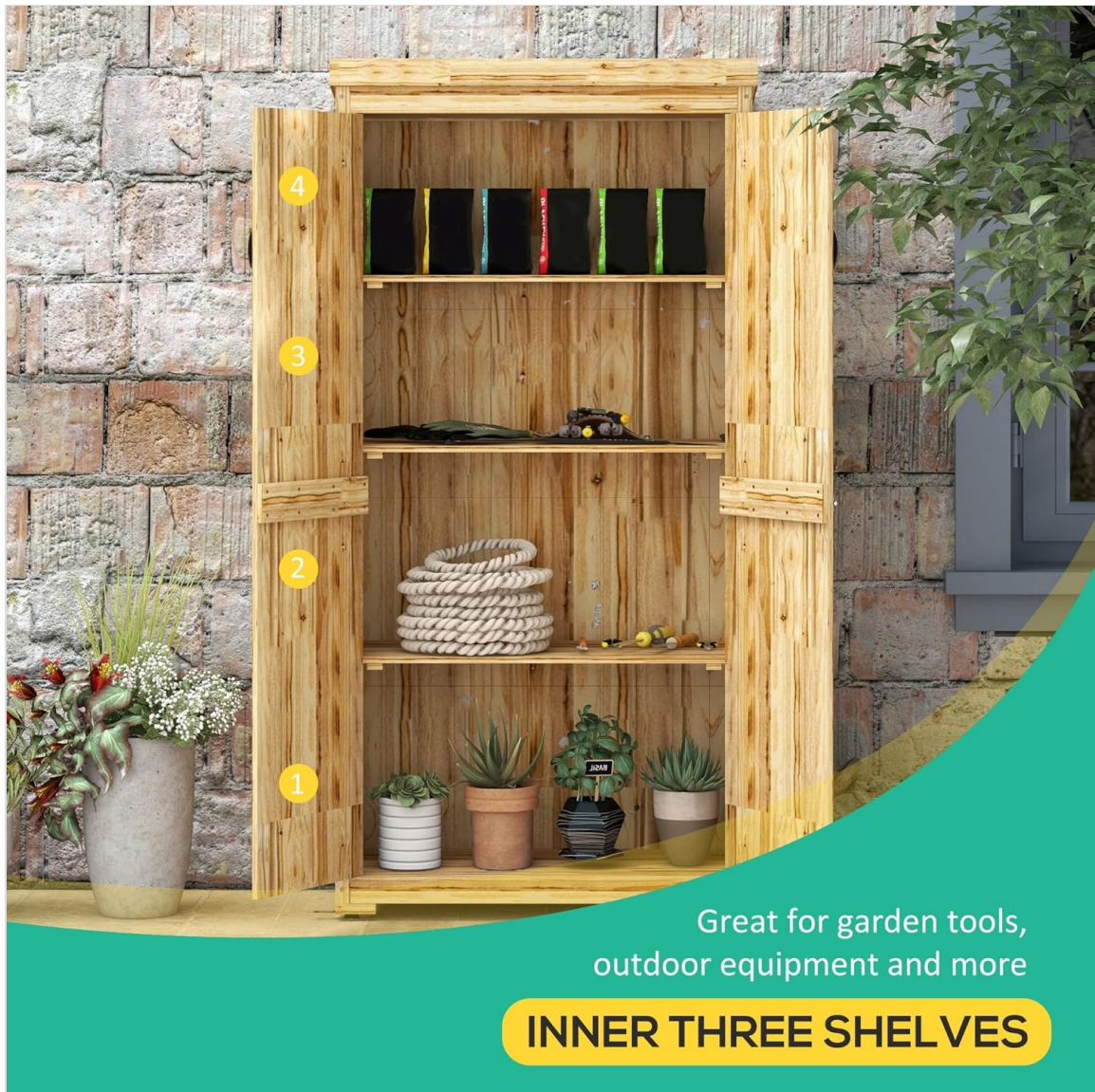
Image: The shed with its doors open, revealing three internal shelves for organized storage of various items like garden tools, ropes, and potted plants.