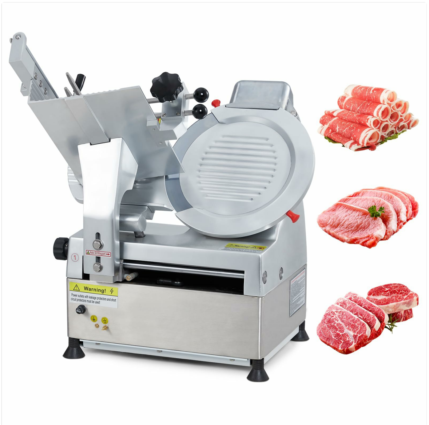
Image: Front view of the GARVEE Automatic Meat Slicer, showing the blade, food carriage, and control panel.