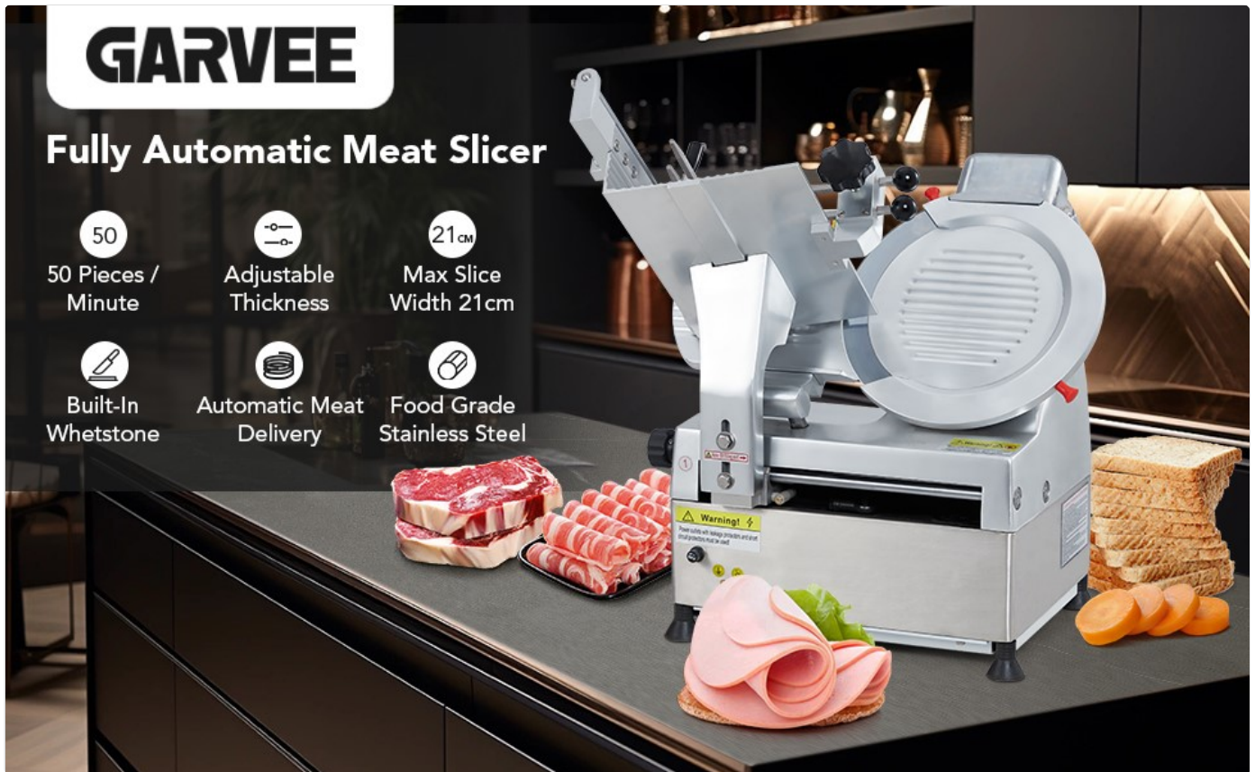
Image: Detailed view of the slicer highlighting key components such as the blade, food tray, and motor housing.