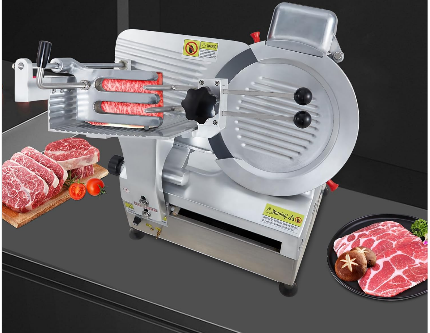
Image: The automatic meat feeding device with meat loaded, ready for slicing.

Automatic meat delivery, Slice width up to 7.88 inches