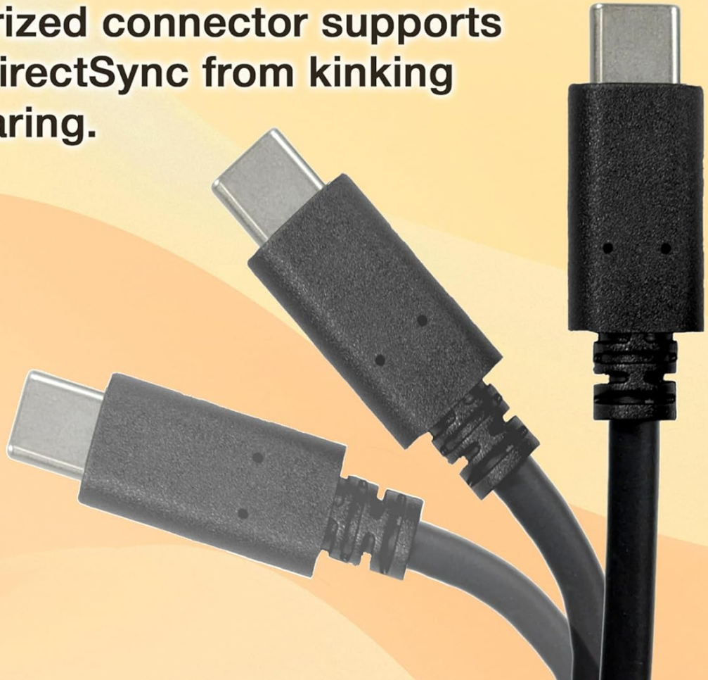
Image: A close-up view of the reinforced rubberized strain relief on the cable connectors, designed to prevent kinking and tearing, enhancing durability.

Rubberized connector supports keep DirectSync from kinking and tearing.