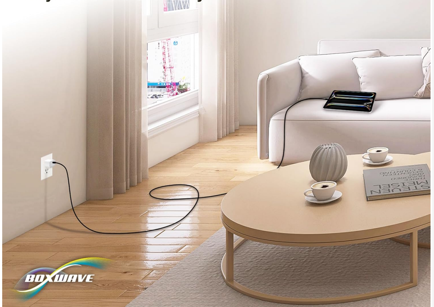
Image: A smartphone connected to a wall outlet via the 6ft DirectSync cable, allowing the user to comfortably use the device on a couch.

DirectSync features a generous 6ft length, allowing for freedom to use your devices anywhere without worry.