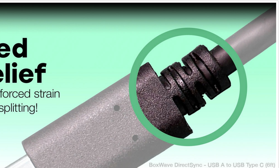
BoxWave DirectSync - USB A to USB Type C (6ft)

DirectSync features reinforced strain reliefs to avoid kinks or splitting!