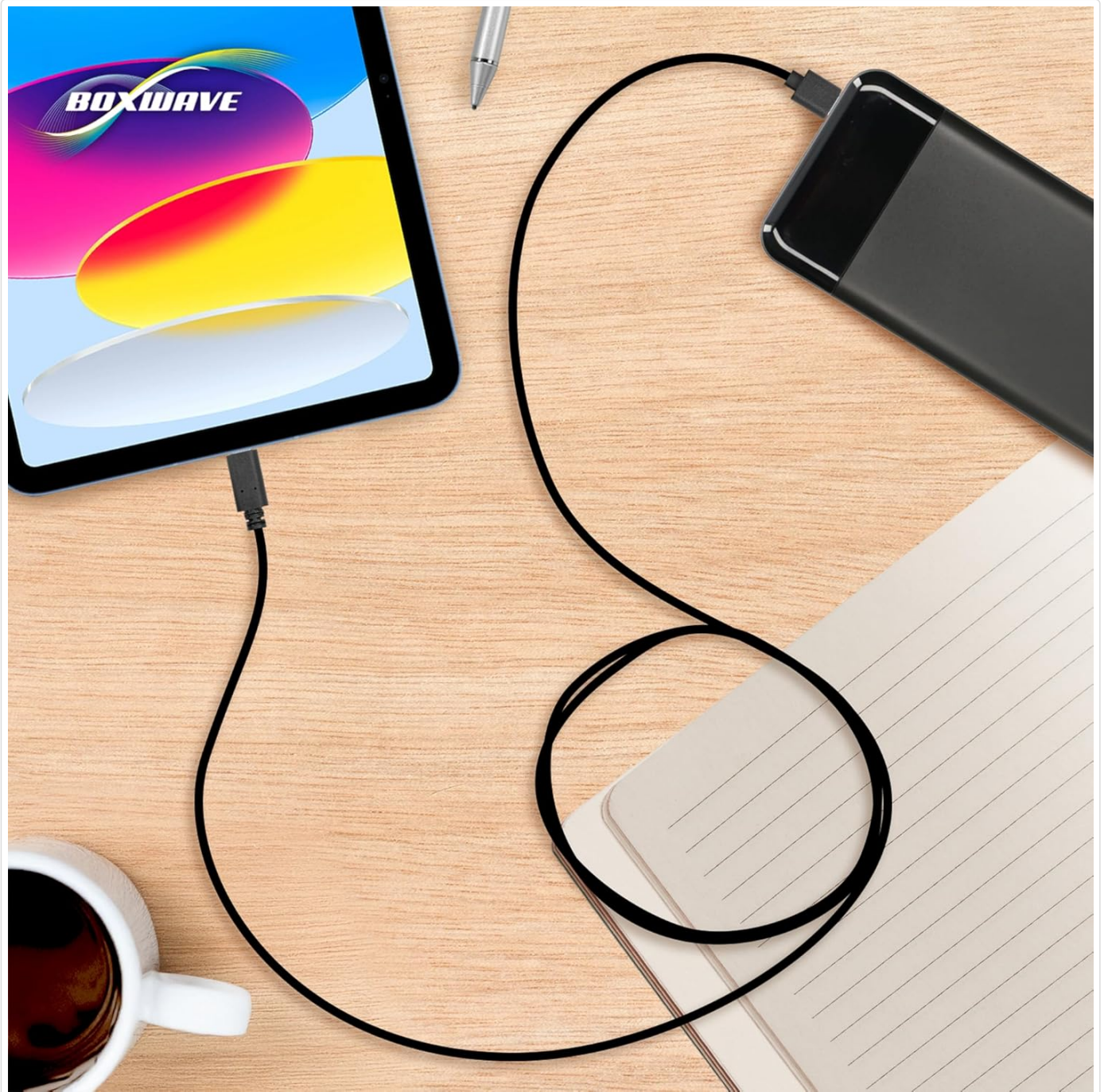
Image: The DirectSync cable connected between a tablet and a power bank on a wooden desk, demonstrating a typical setup for charging.