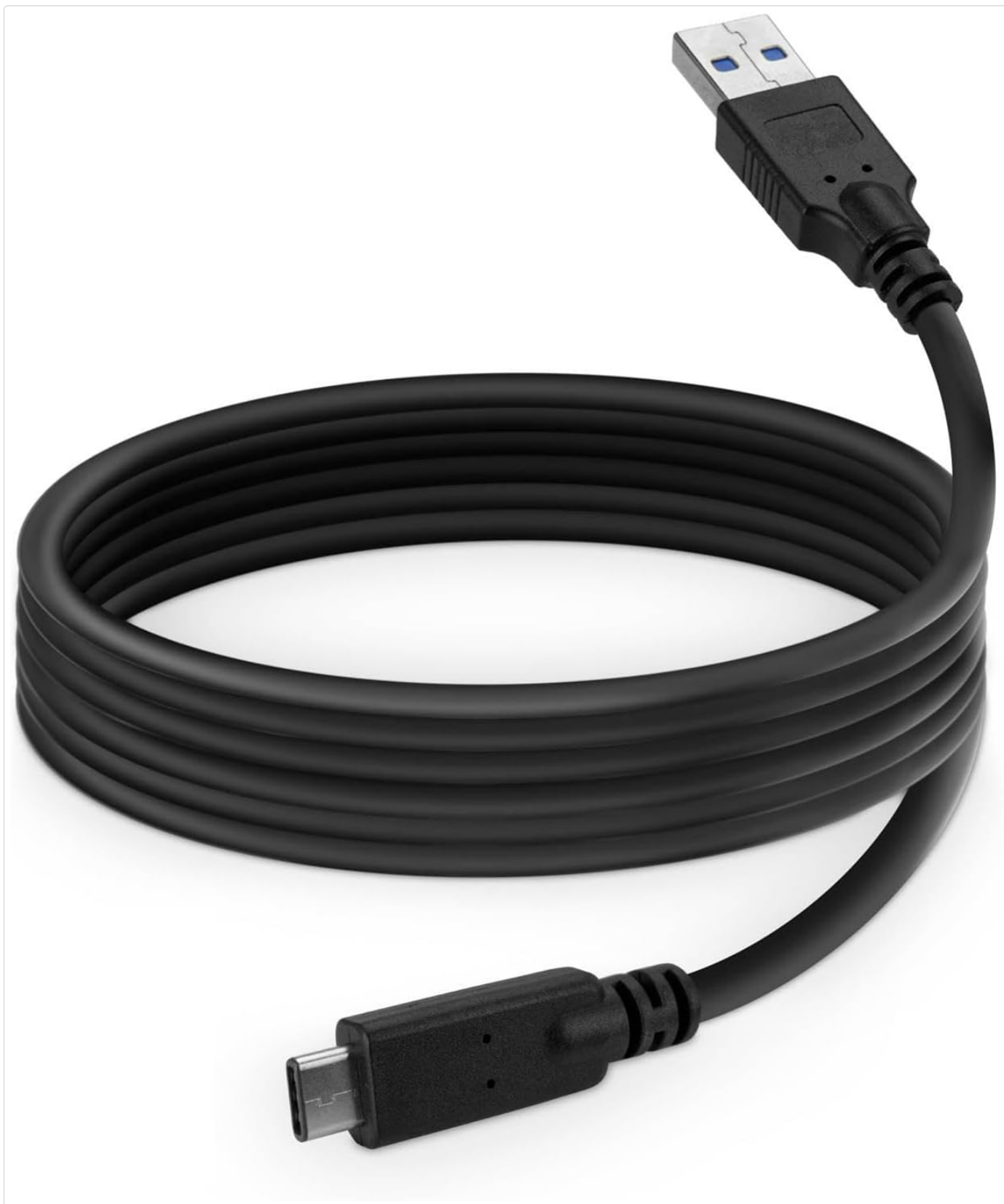
Image: The BoxWave DirectSync cable, coiled, showing its USB 3.0 Type-A and USB 3.1 Type-C connectors.