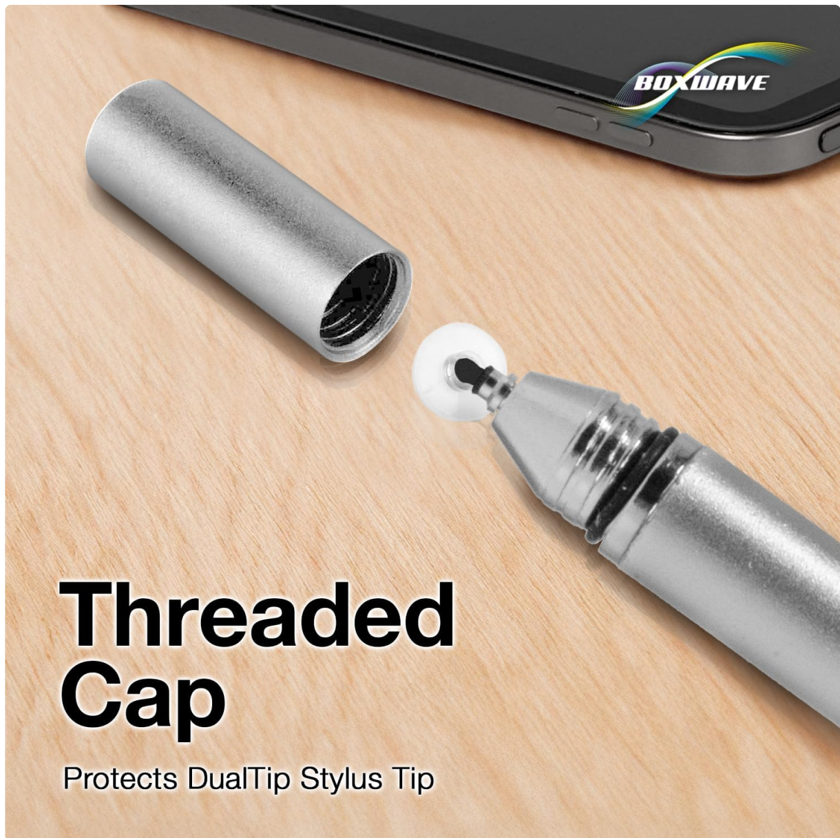
Image 4.1: A close-up view of the threaded cap designed to protect the FineTouch clear disc tip when the stylus is not in use.