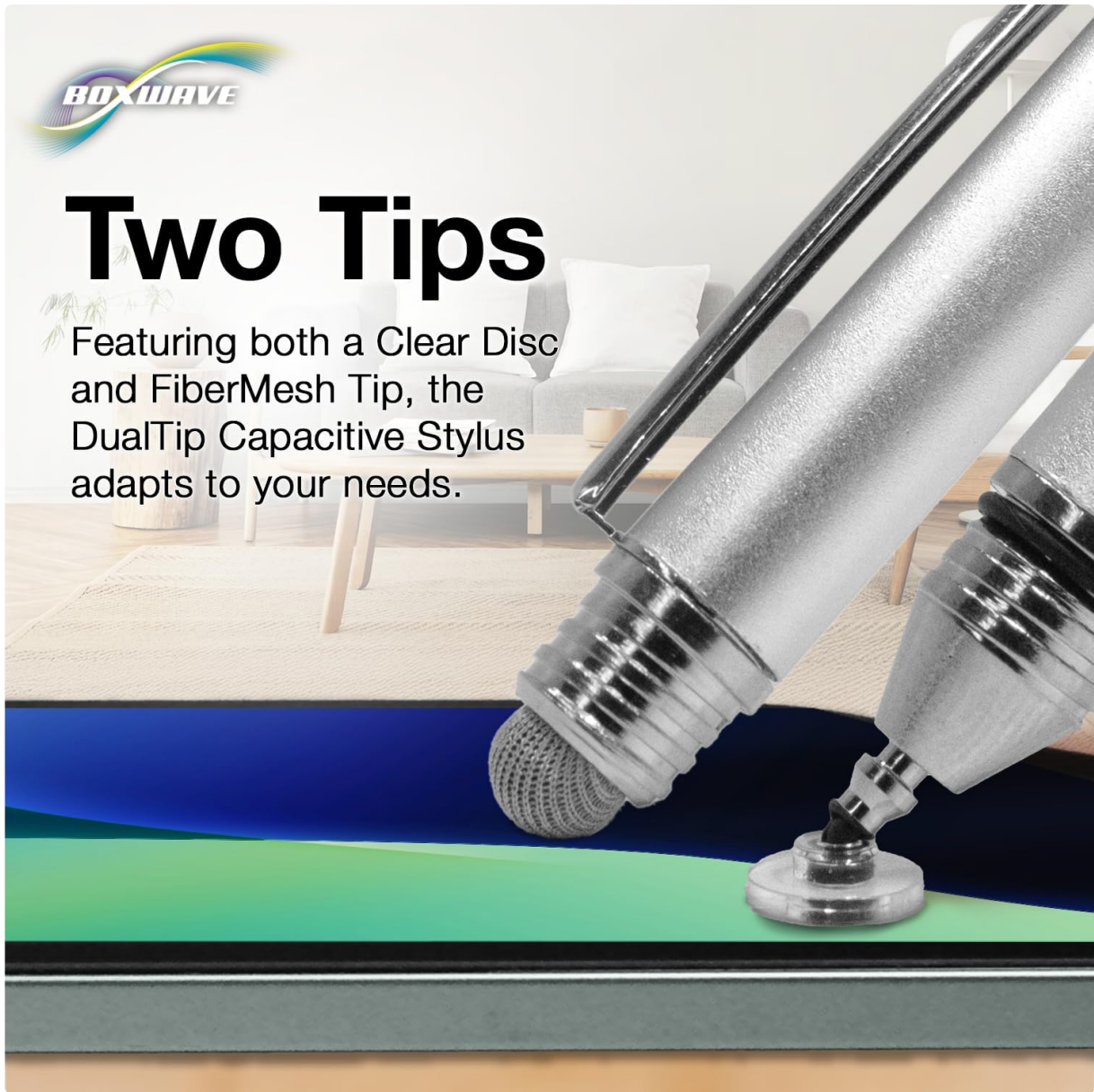
Image 1.1: The BoxWave DualTip Capacitive Stylus, highlighting its two distinct tips: the FiberMesh tip and the FineTouch clear disc tip.