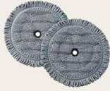
Power Mop Pro Pads (2 sets)