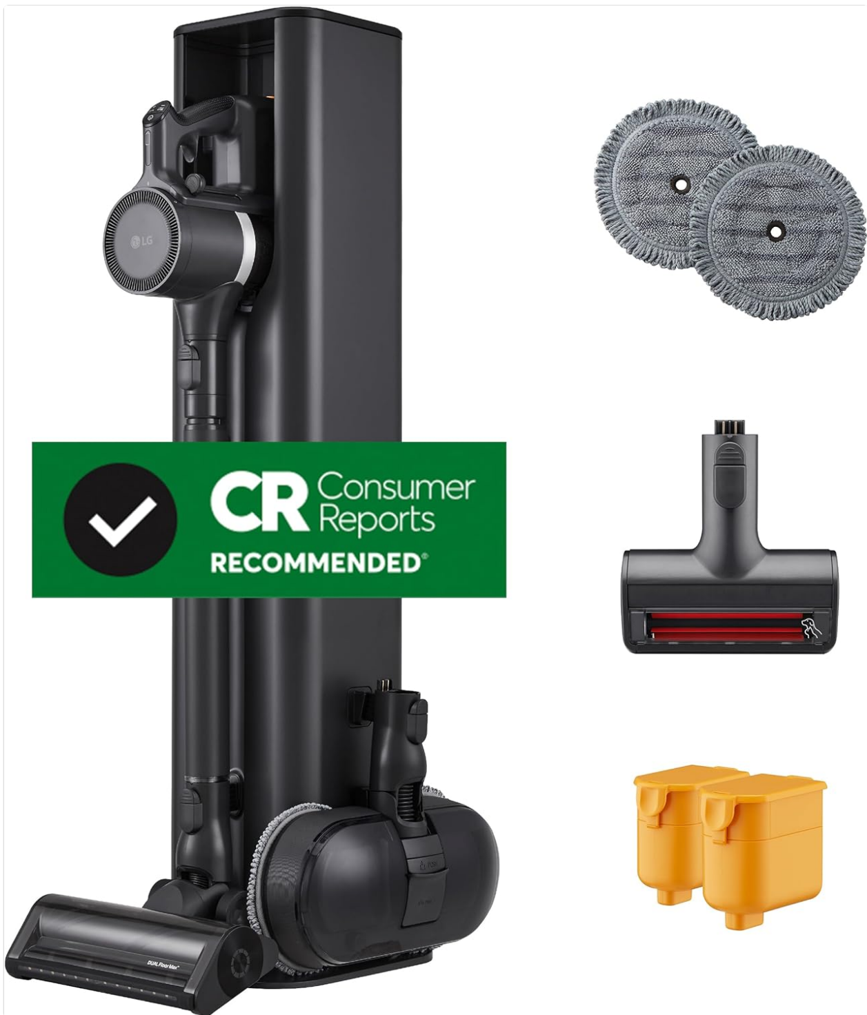
Image: The LG CordZero A949 Cordless Stick Vacuum Cleaner with its Auto-Empty Base, two mop pads, a Power Pet Nozzle, and two rechargeable batteries.