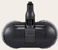
Power Mop Pro Nozzle