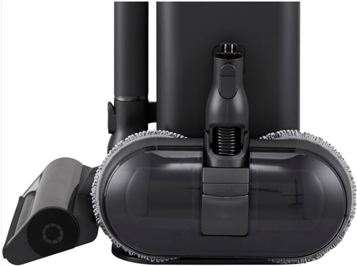
Image: The LG CordZero A949 stick vacuum cleaner is shown docked vertically in its All-in-One Tower, which also stores accessories.