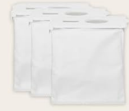
3 Dust Bags