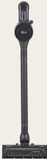
CordZero™ Stick Vacuum with Dual Floor Max Nozzle