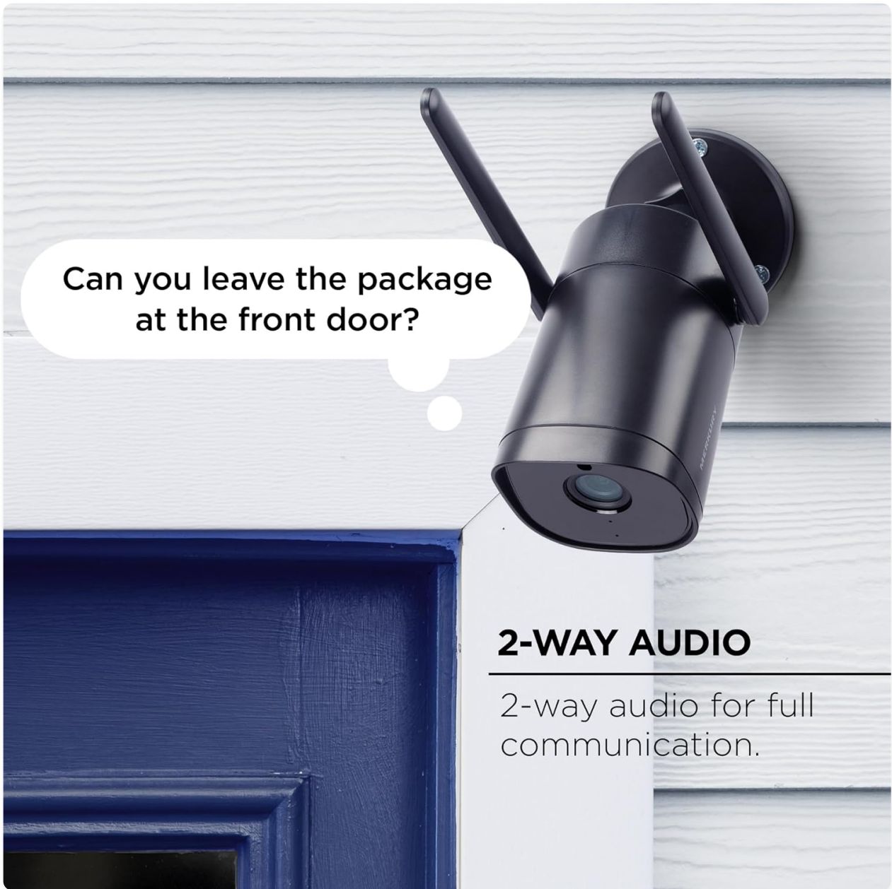
Image: The Merkurs Smart camera mounted on an exterior wall next to a blue door, with a thought bubble suggesting a conversation, illustrating its 2-way audio capability.