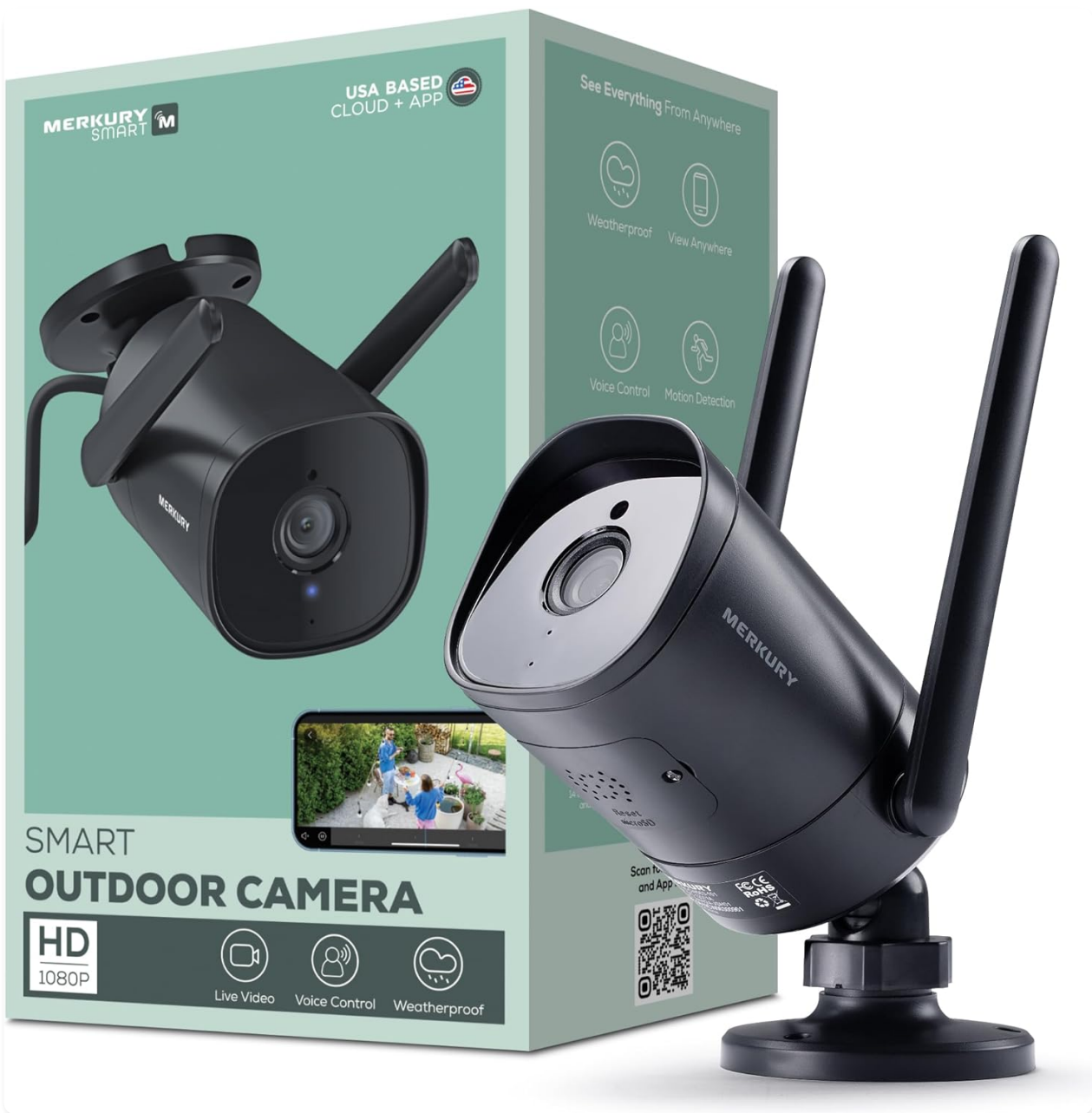
Image: The Mercurry Smart Outdoor Security Camera shown alongside its product packaging, highlighting its design and key features.