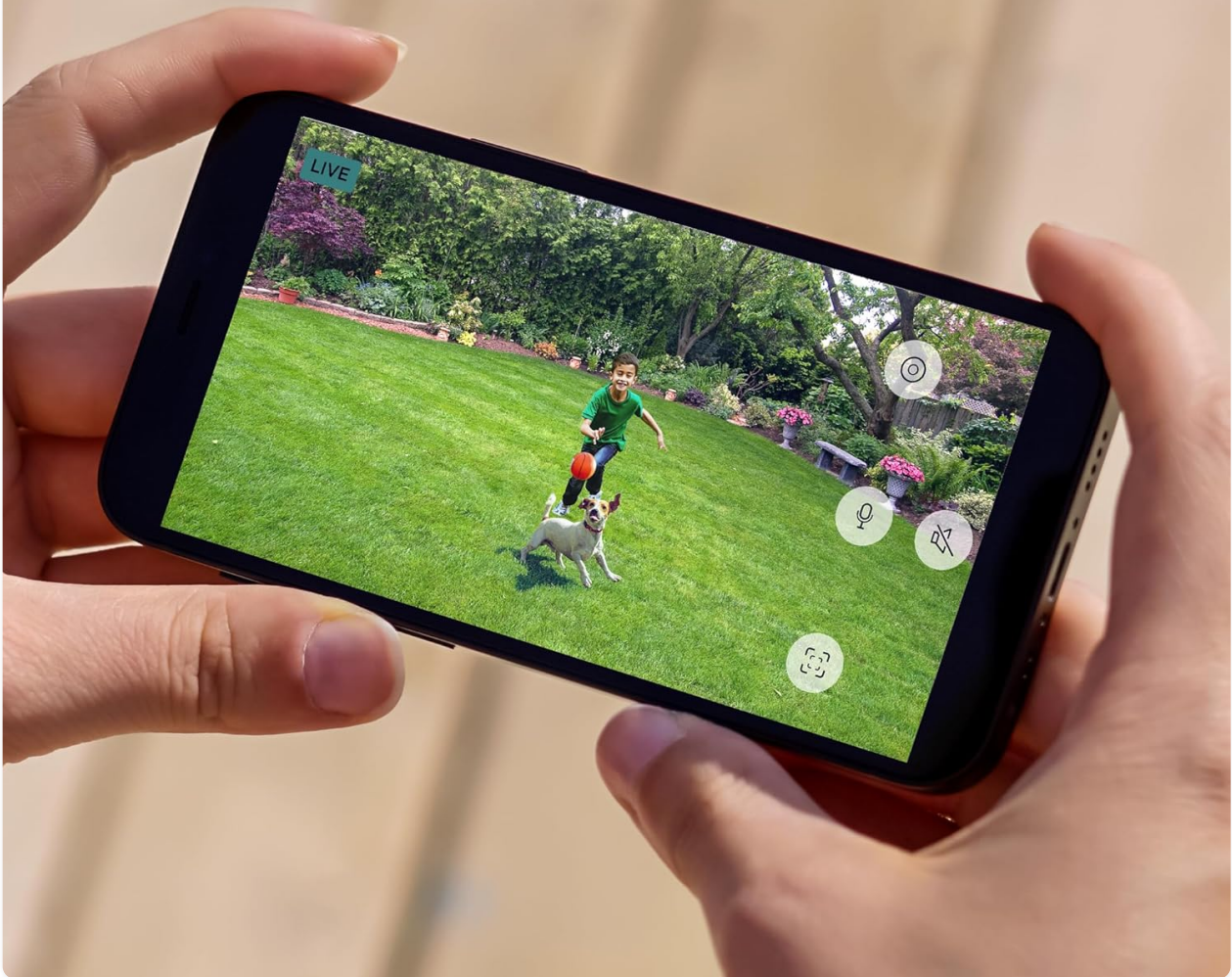
Image: A smartphone held in hands, showing a live video feed from the Merkury Smart camera, capturing a child and a dog playing in a backyard.

Check back at home from anywhere using your smartphone.