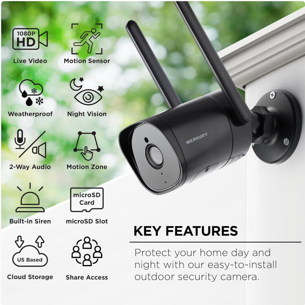
Image: An infographic illustrating the camera's key features, including 1080p HD, live video, motion sensor, weatherproof design, night vision, 2-way audio, motion zones, built-in siren, microSD slot, US-based cloud storage, and share access.