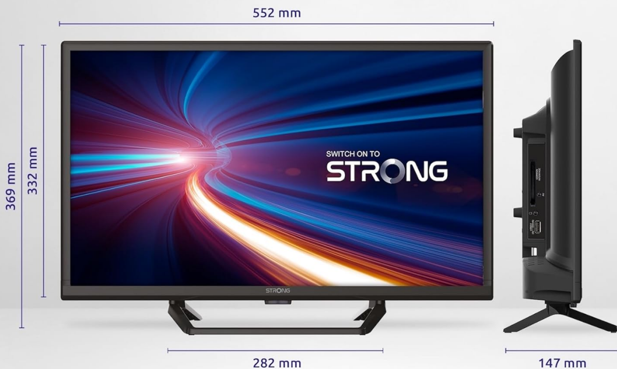
Figure 7.1: Product dimensions of the Strong 24-inch HD TV.