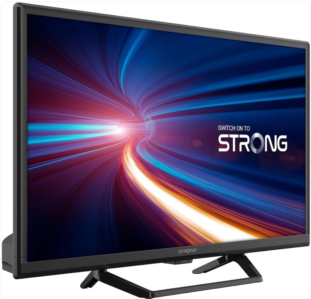
Figure 1.1: Front view of the Strong 24-inch HD TV.