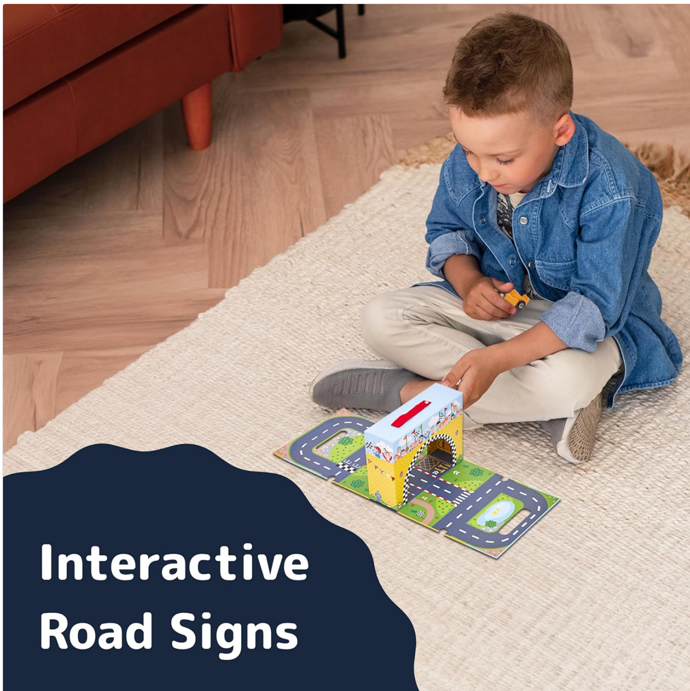
Image: A child interacting with the track, demonstrating manual play and the use of interactive road signs.