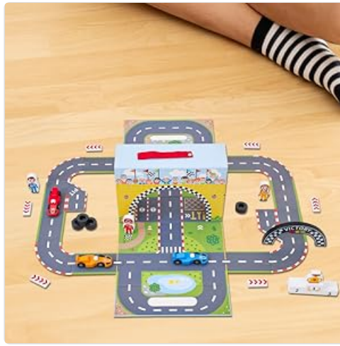
Image: All components of the Pretext Portable Paper Car Racing Track laid out, including the track, cars, and accessories.