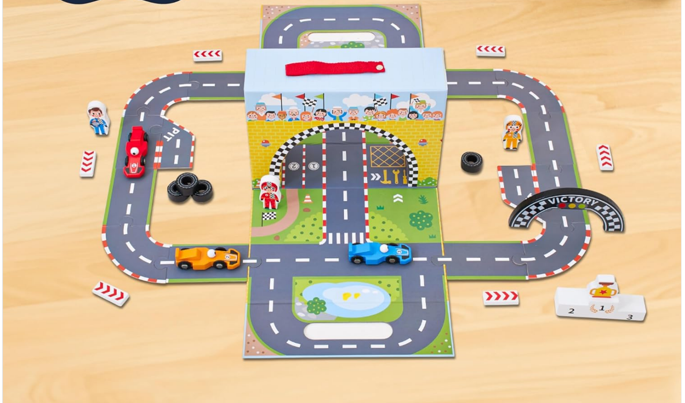
Image: The fully assembled racing track, ready for play, showcasing the connected road pieces and accessories.