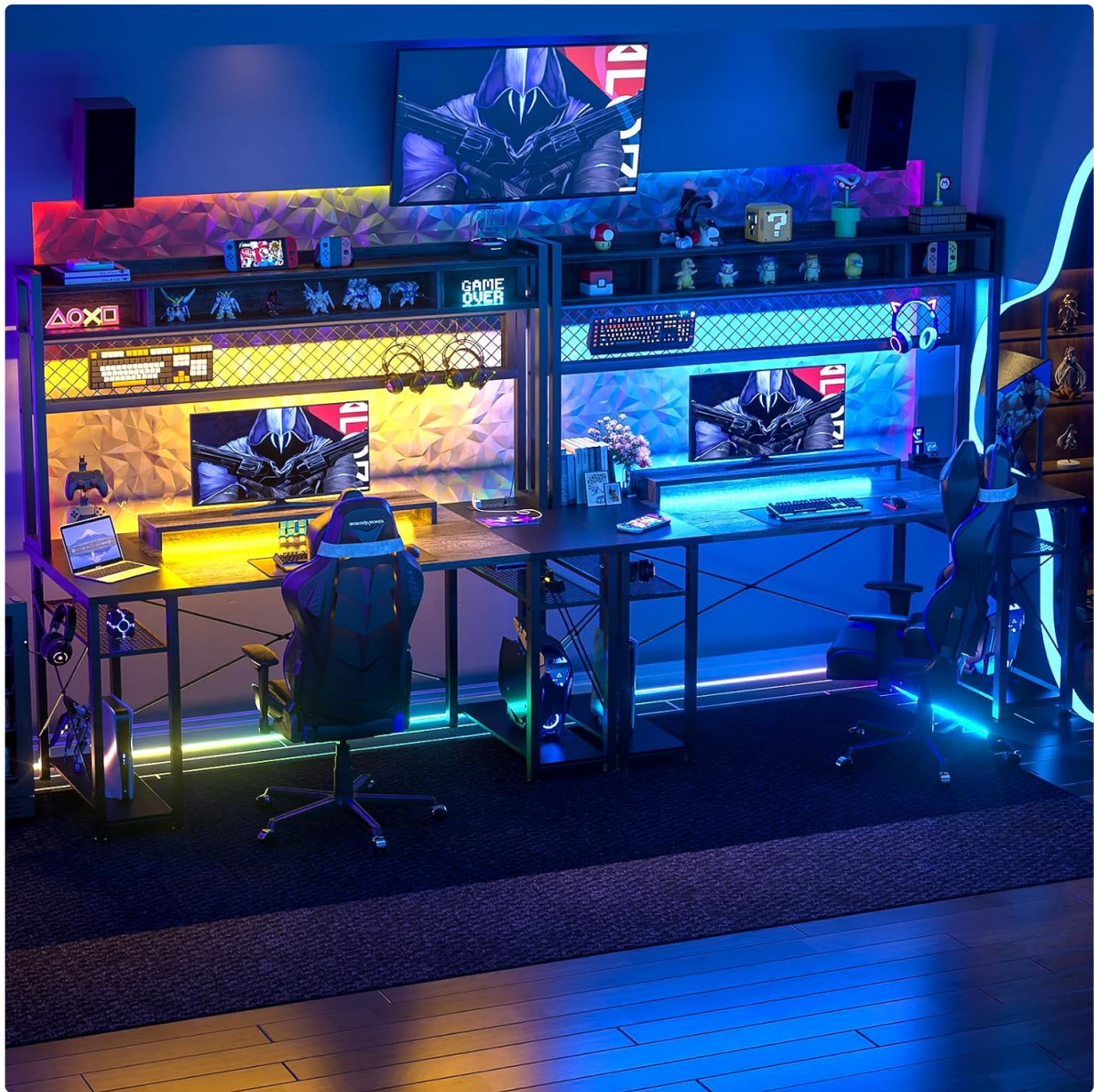
Image: The iSunirm 48 Gaming Desk integrated into a dual-monitor gaming environment, showcasing its LED lighting and spacious design.