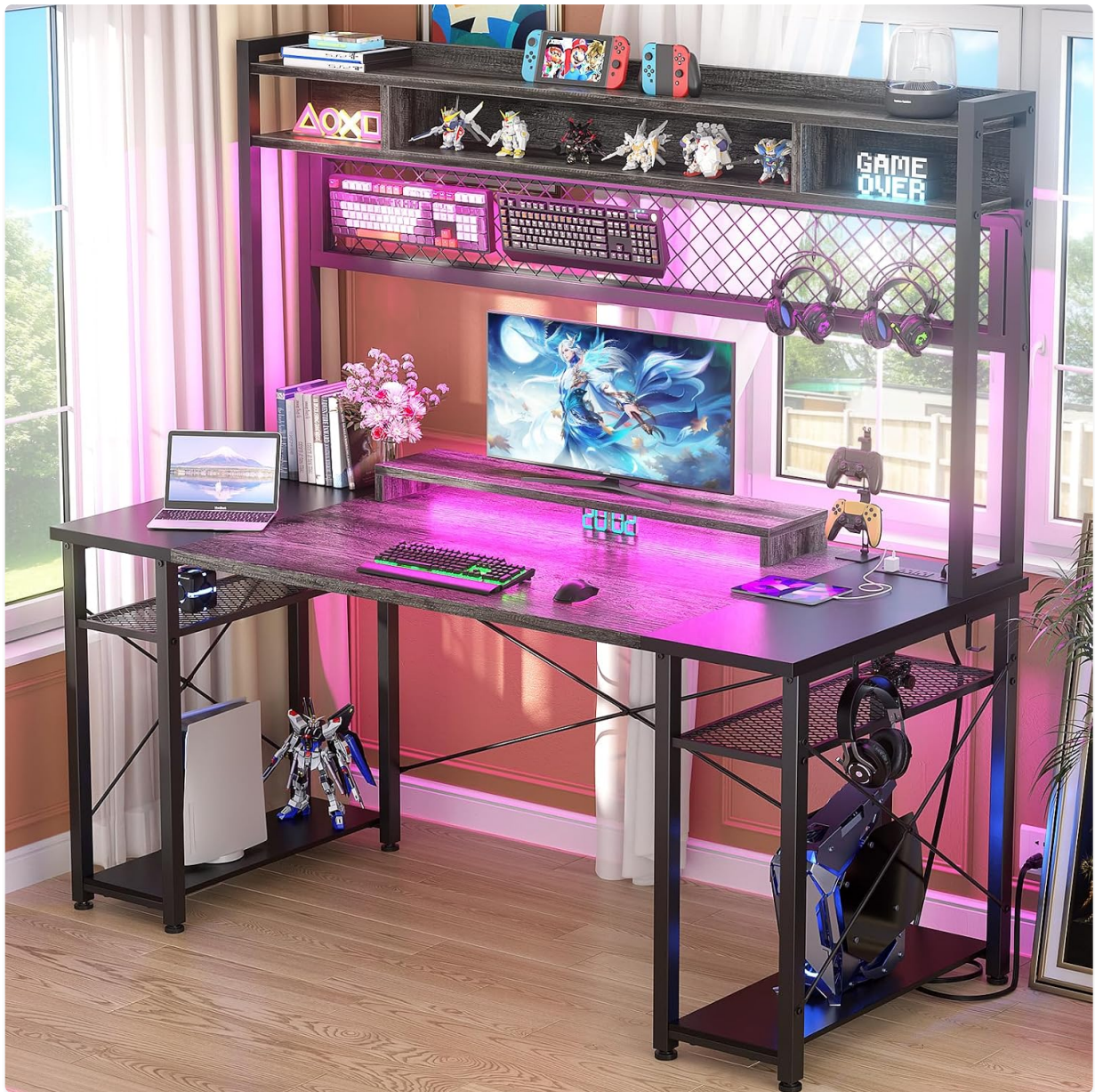
Image: The iSunirm 48 Gaming Desk fully assembled, highlighting the hutch for additional storage and the elevated monitor stand.