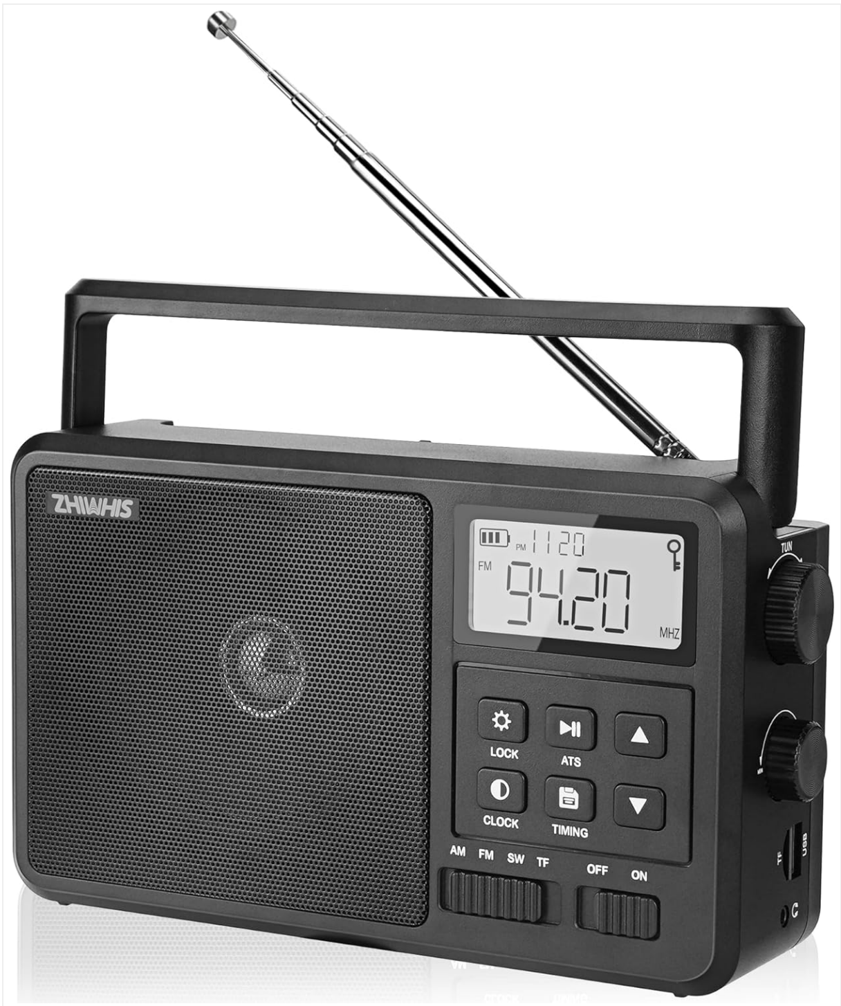
Figure 1: ZHIWHIS ZWS-206 Portable Shortwave Radio (Front View)