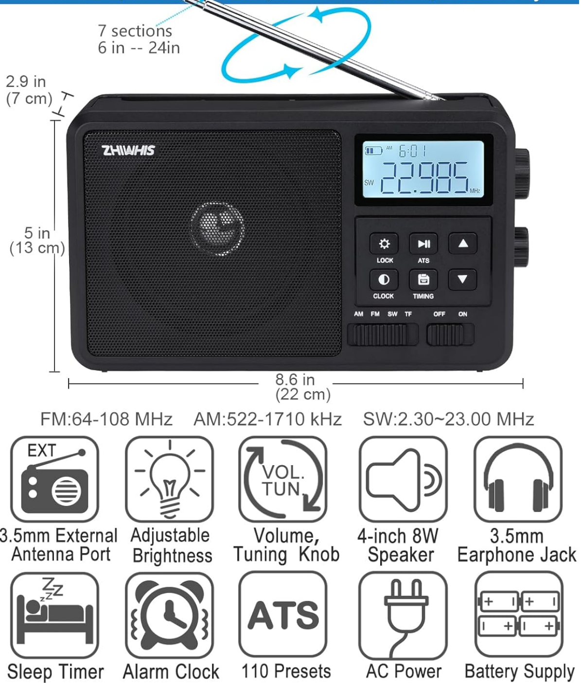
Figure 2: Key features and dimensions of the ZHIWHIS ZWS-206 radio.

Radio, Bluetooth5.0, MicroSD Card, USB Play