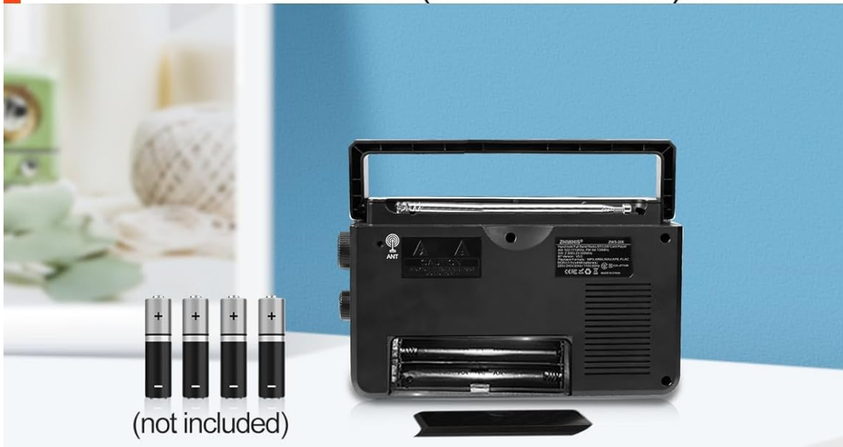
Figure 3: Illustration of AC power cable connection and AA battery installation.