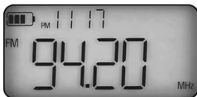
Turn off backlight