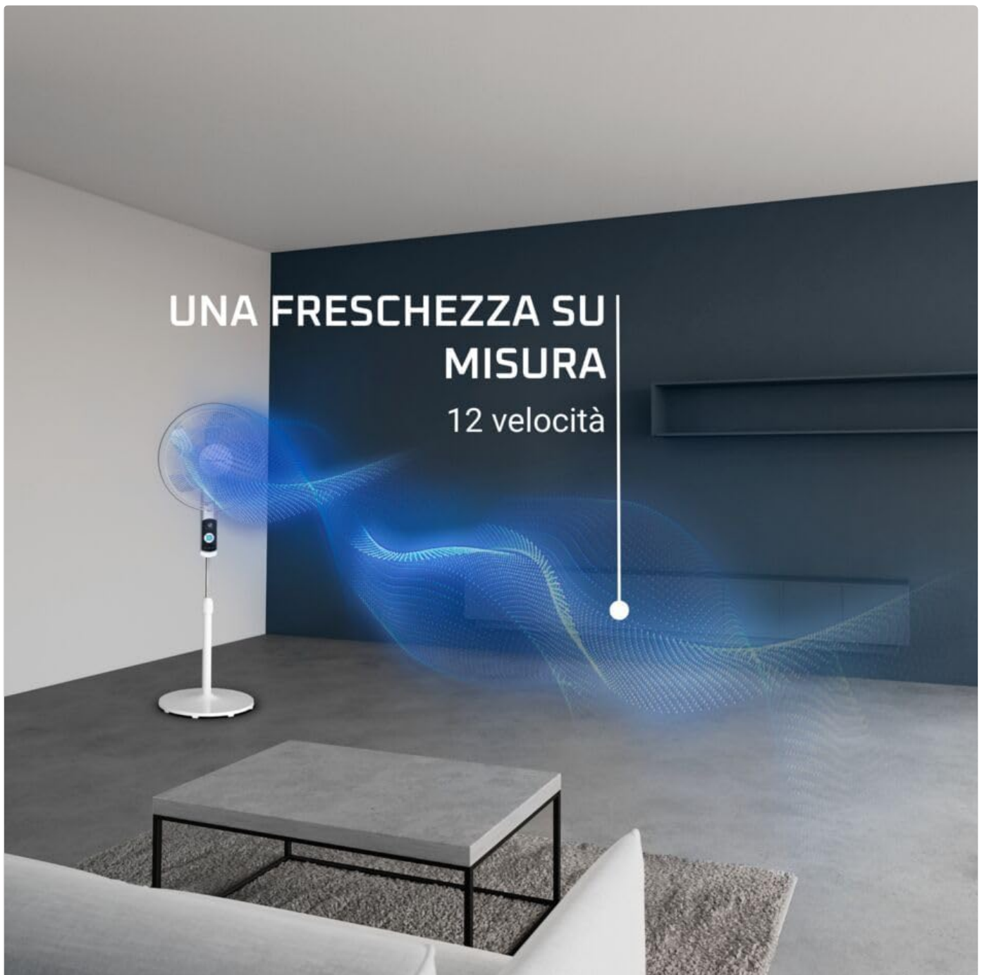
Image: The Rowenta fan in a living room setting, depicting its ability to provide customized cooling with 12 different speed settings.