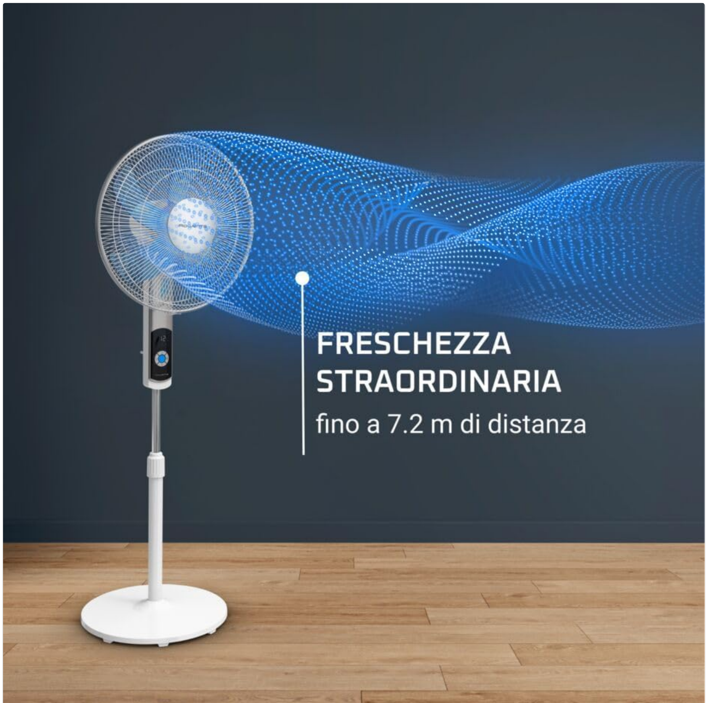
Image: Visual representation of the Rowenta fan generating powerful airflow, extending up to 7.2 meters across a room.