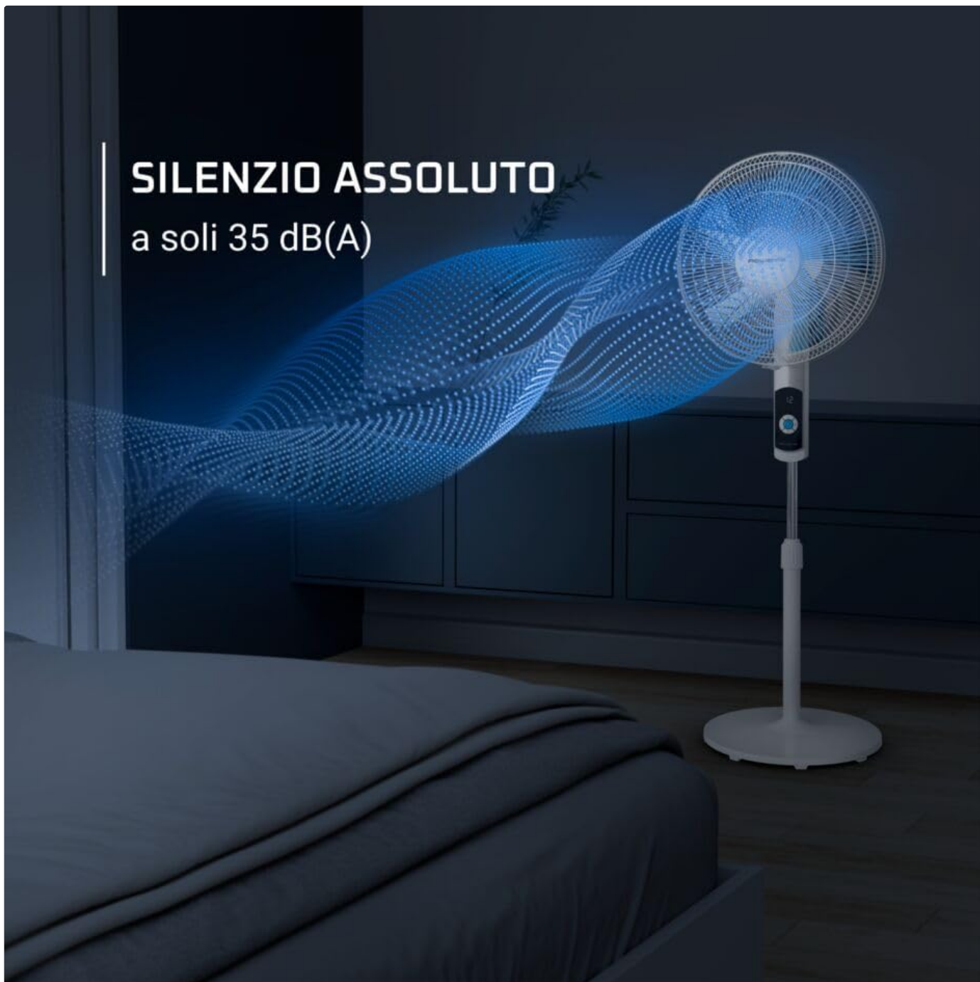
Image: The Rowenta fan positioned in a bedroom, illustrating its quiet operation at 35 dB(A), suitable for undisturbed sleep.