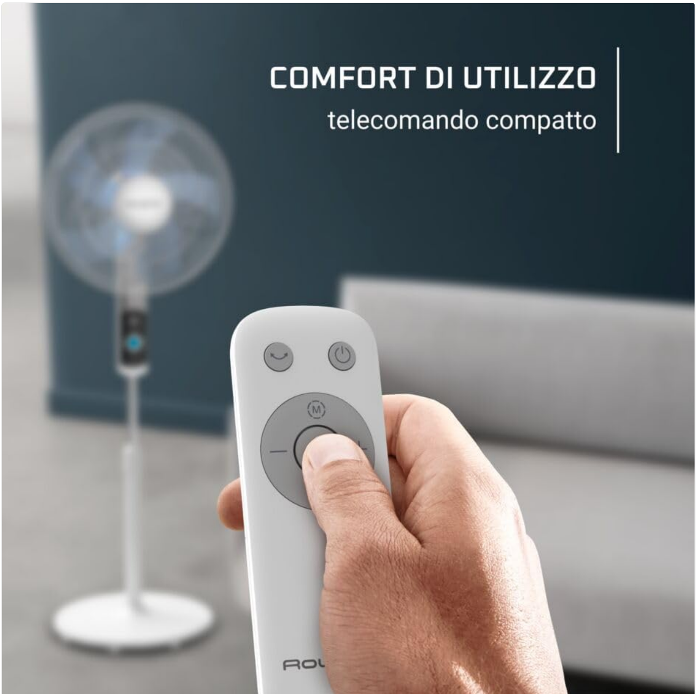
Image: A hand holding the compact remote control for the Rowenta fan, with the fan visible in the background, demonstrating ease of use.