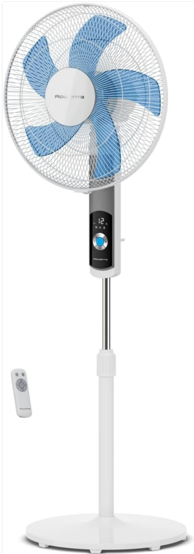
Image: Front view of the Rowenta Turbo Silence VU5650F0 Pedestal Fan, showcasing its white body, blue fan blades, and digital control panel.