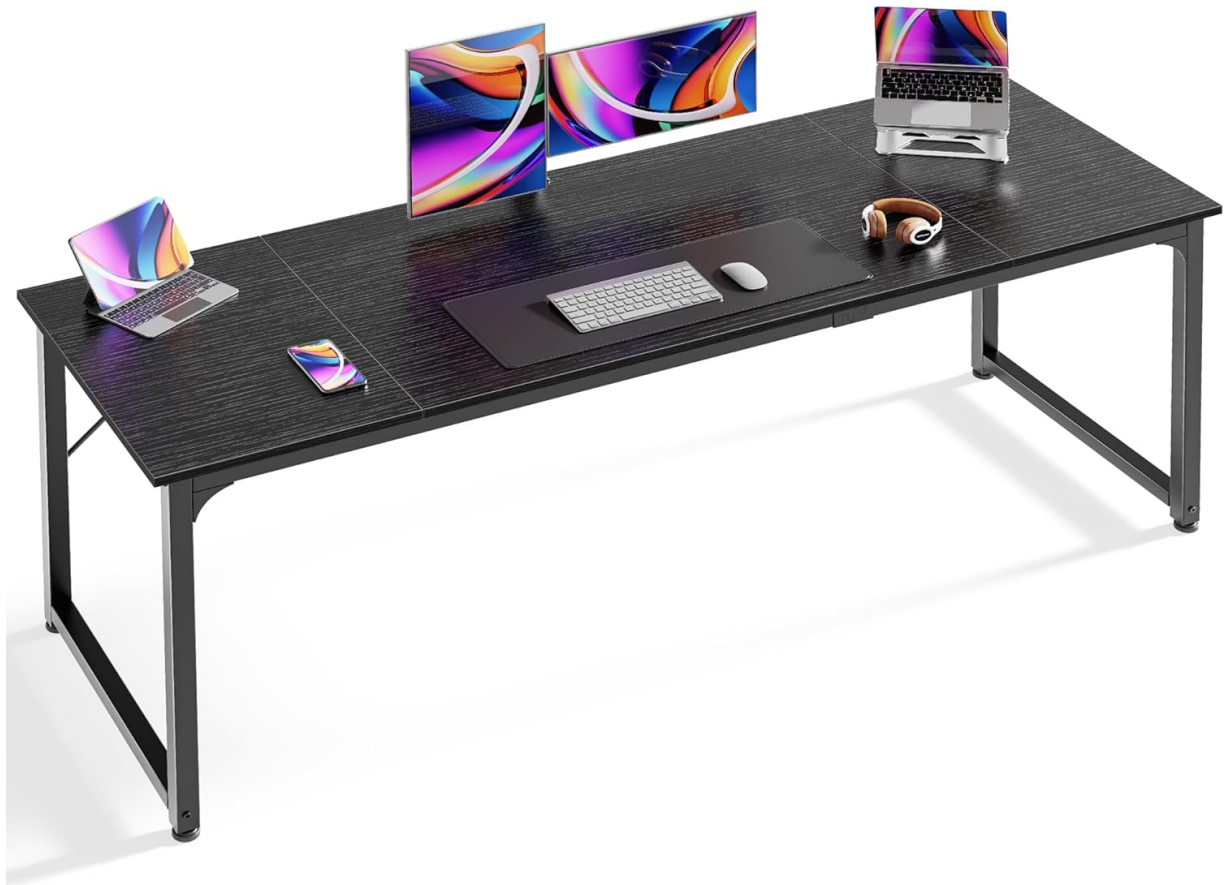
Image: The Huuger 70-inch computer desk in a home office setting, showcasing its large desktop surface accommodating

Thank you for choosing the Huuger 70-Inch Computer Desk. This manual provides detailed instructions for assembly, operation, maintenance, and troubleshooting to ensure you get the most out of your new desk. Designed for versatility, this desk is suitable for home offices, study areas, and gaming setups, offering ample space and a sturdy structure.