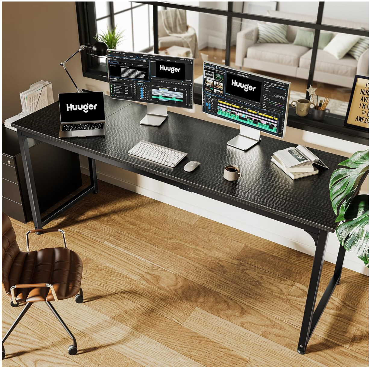
Image: The desk configured as a gaming station, highlighting its spaciousness for gaming equipment.