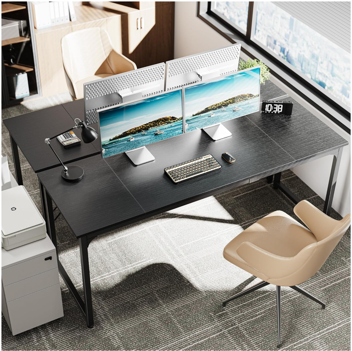
Image: The desk set up in an office environment, demonstrating its capacity for dual monitors and office accessories.