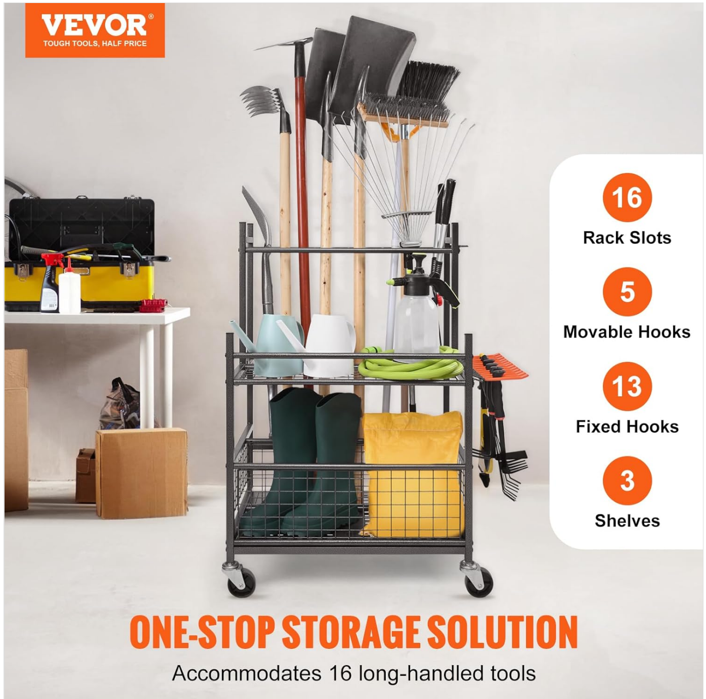
Image: The VEVOR Garden Tool Organizer fully loaded with long-handled tools, smaller items on shelves, and hooks in use.

The VEVOR Garden Tool Organizer is designed for efficient storage of various garden and yard tools. Its features allow for versatile organization.