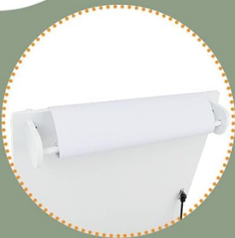
Replaceable Paper Roll Holder (1 Paper Roll Included)