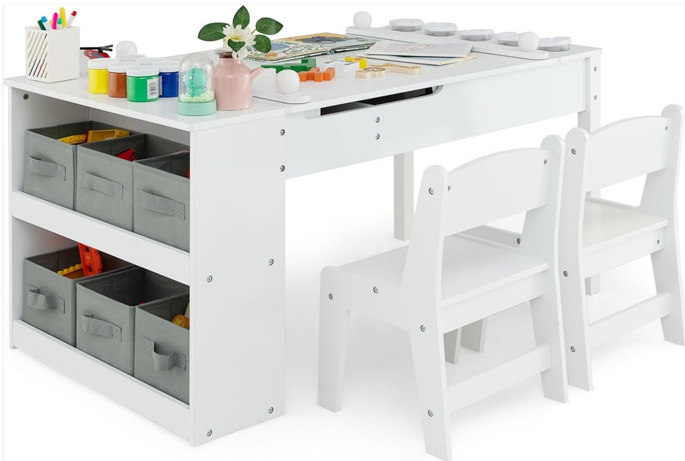
Image: The complete LIFEZEAL 3-in-1 Kids Wooden Art and Activity Table Set, featuring a white wooden table with integrated storage shelves and two matching chairs.

Thank you for choosing the LIFEZEAL 3-in-1 Kids Wooden Art and Activity Table Set. This versatile furniture set is designed to provide a dedicated space for children's learning, creativity, and play. It functions as a learning table, an art easel, and a craft table, complete with integrated storage solutions. This manual provides essential information for assembly, safe operation, and maintenance of your new product.