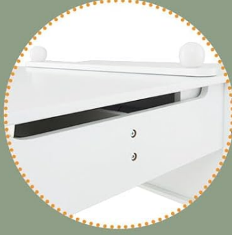
Anti-Pinch Cutout Handle