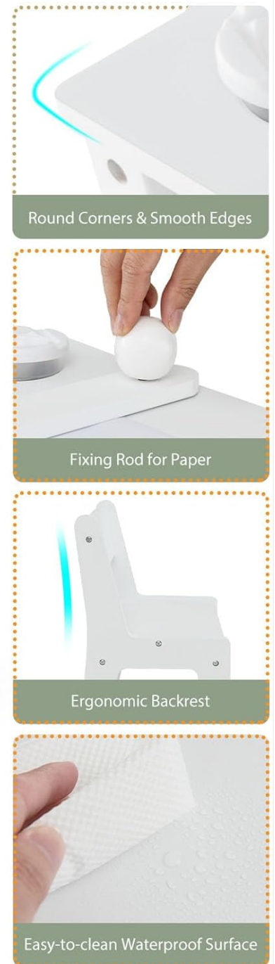
Image: A composite image highlighting key features: round corners and smooth edges for safety, a fixing rod for the paper roll, an ergonomic backrest on the chairs, and the easy-to-clean waterproof surface of the table.