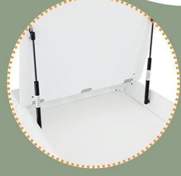
Slow-drop Pneumatic Rods

Image: A sequence showing the tabletop being lifted to transform into an art easel, highlighting the replaceable paper roll holder, anti-pinch cutout handle, and slow-drop pneumatic rods for safe operation.