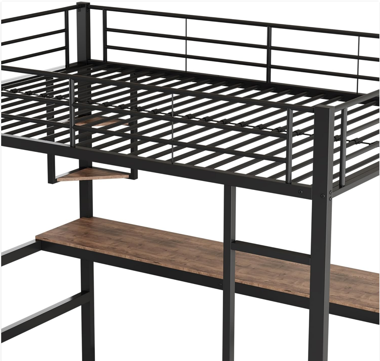
Figure 3: Detail of the integrated desk and lower shelf. This close-up highlights the spacious desk surface and the convenient lower shelf, demonstrating the practical workspace and storage options provided by the loft bed design.