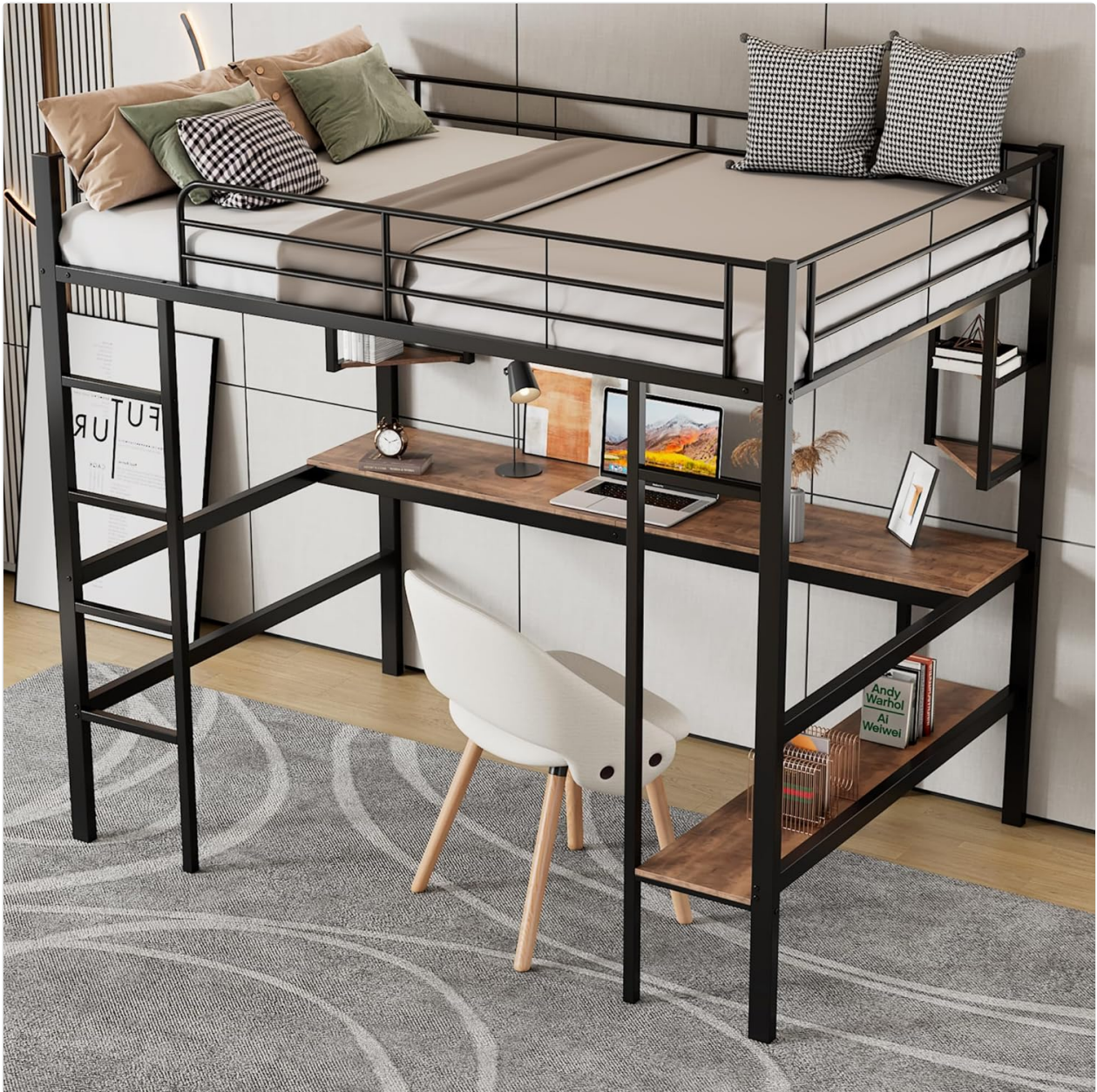
Figure 2: The Moimhear Loft Bed in use. This image displays the fully assembled loft bed, showcasing the sleeping area, integrated desk with a laptop and lamp, and the various shelves holding books and decorative items, illustrating its functional design.