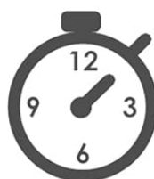
Figure 4.4: Timer icon, representing the delayed start feature.