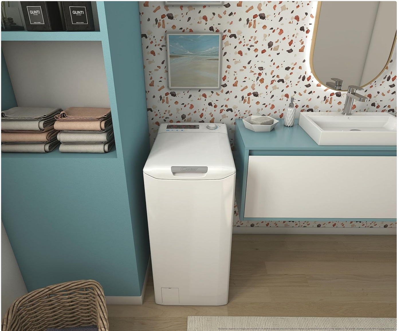
Figure 3.1: The washing machine positioned in a bathroom, demonstrating its suitability for compact areas.

Place the washing machine on a firm, level surface. Ensure there is adequate space around the appliance for ventilation and access. The compact design (60 cm width, 41 cm depth, 86 cm height) allows for placement in narrow spaces.