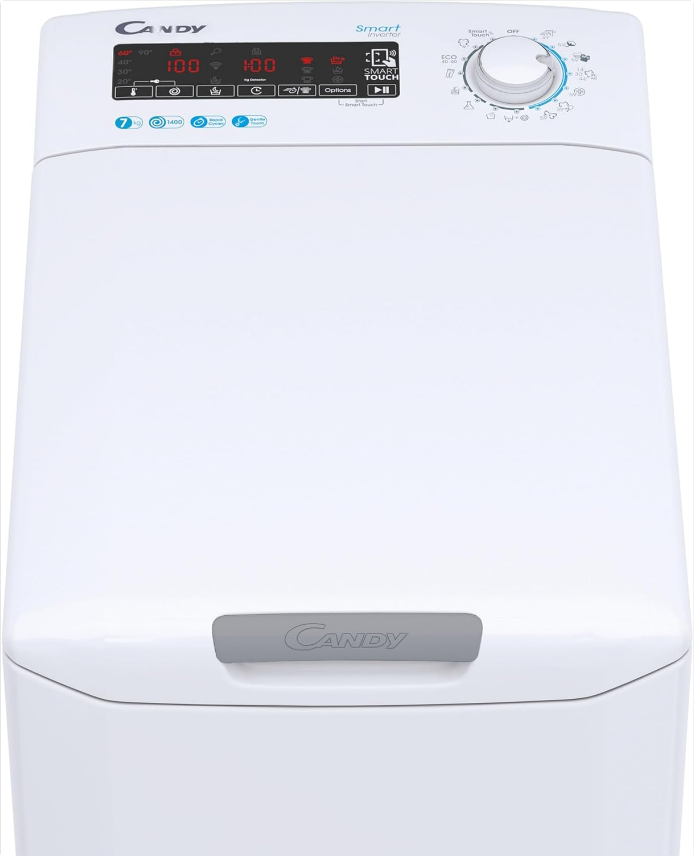
Figure 4.1: Detailed view of the control panel, showing the digital display, tactile buttons, and program selector knob.

The washing machine features a digital display with tactile buttons and a rotary knob for program selection. This intuitive interface allows for easy configuration of washing functions and program choices.