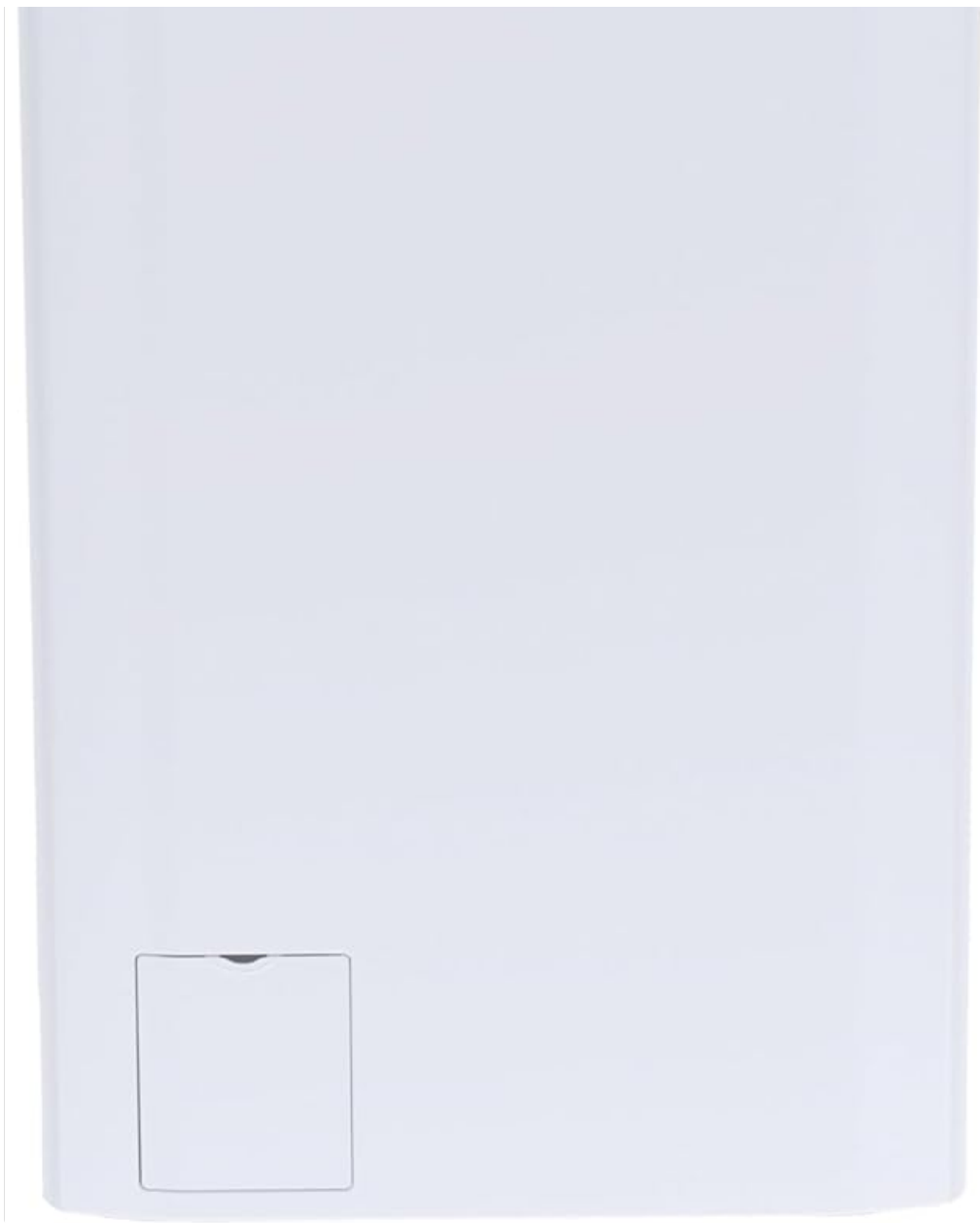
Figure 1.1: Front view of the Candy Smart CSTG 47TMV5/1-S Top Load Washing Machine. This image shows the compact design and the top-loading access.