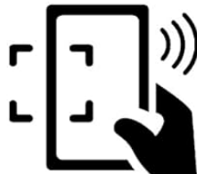
Figure 4.3: NFC icon, symbolizing the machine's smart connectivity features.