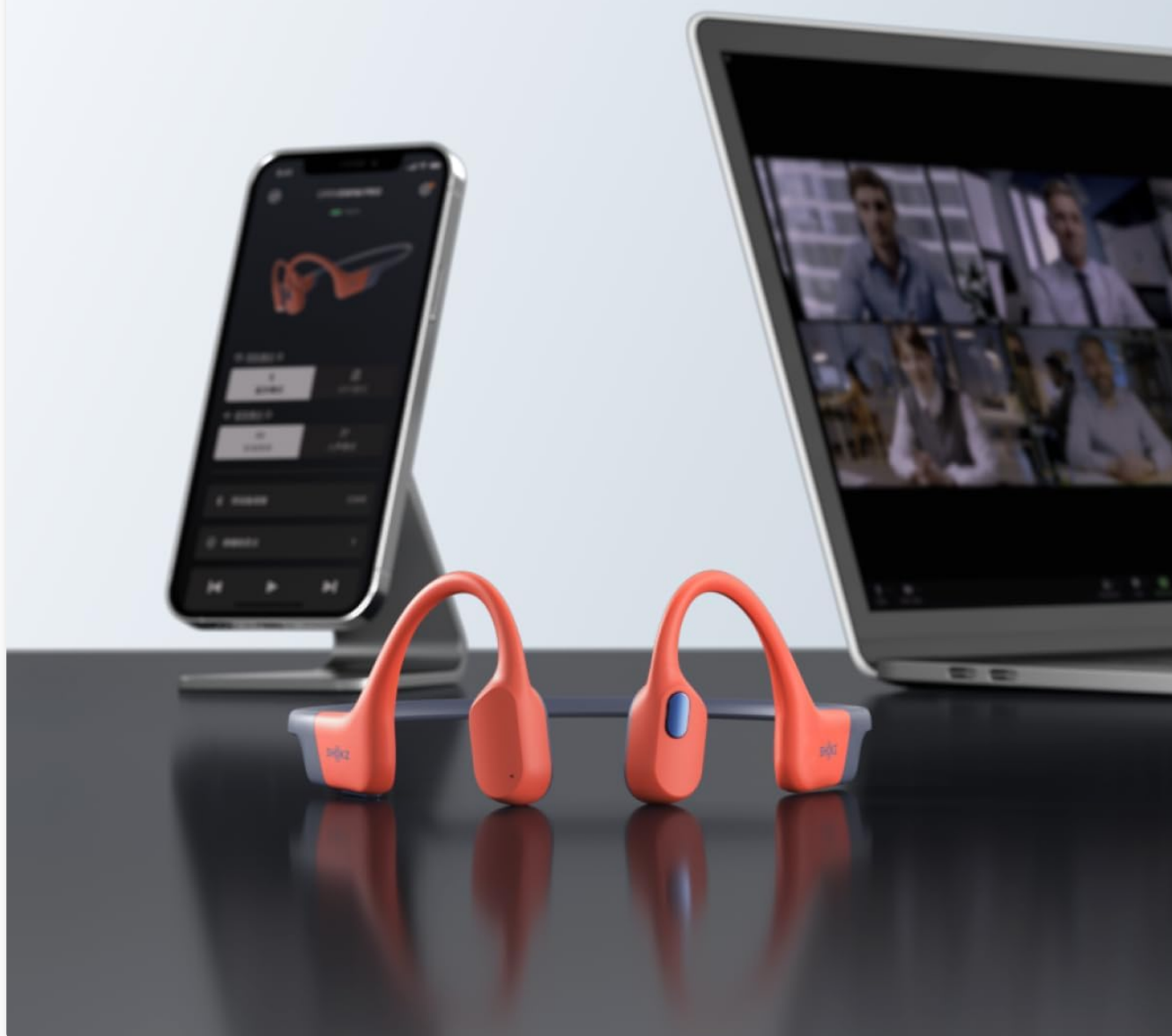
Image: The OpenSwim Pro headphones connected to both a smartphone and a laptop, demonstrating the simultaneous pairing feature.

Connect headphones to 2 devices at once in the Shokz App