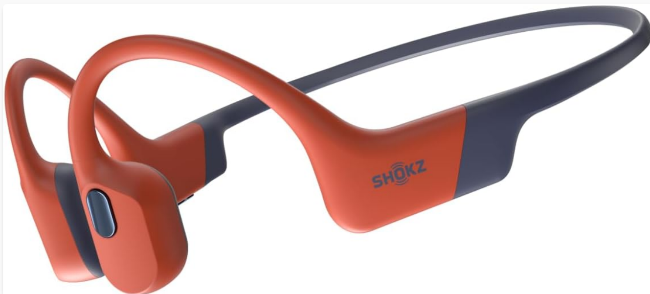
Image: The SHOKZ OpenSwim Pro headphones, showcasing their ergonomic, open-ear design in red and dark grey.

Familiarize yourself with the components of your OpenSwim Pro headphones.