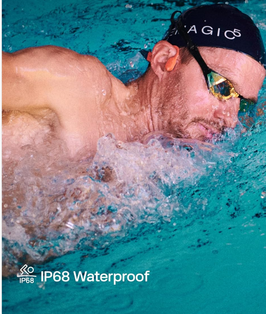
Image: A person swimming with the OpenSwim Pro headphones, highlighting their suitability for aquatic environments.