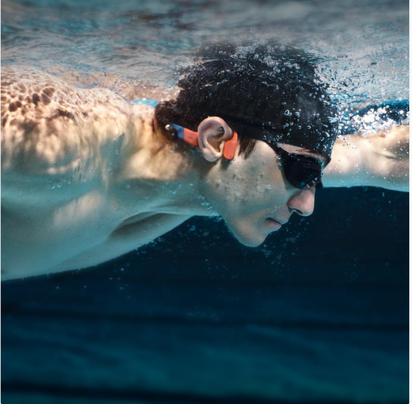
Image: A swimmer using the OpenSwim Pro headphones underwater, demonstrating their IP68 waterproof capability.

Fully sweatproof and submersible in water up to 2 m ( \approx 6.5 ft) deep for up to 2 hours.