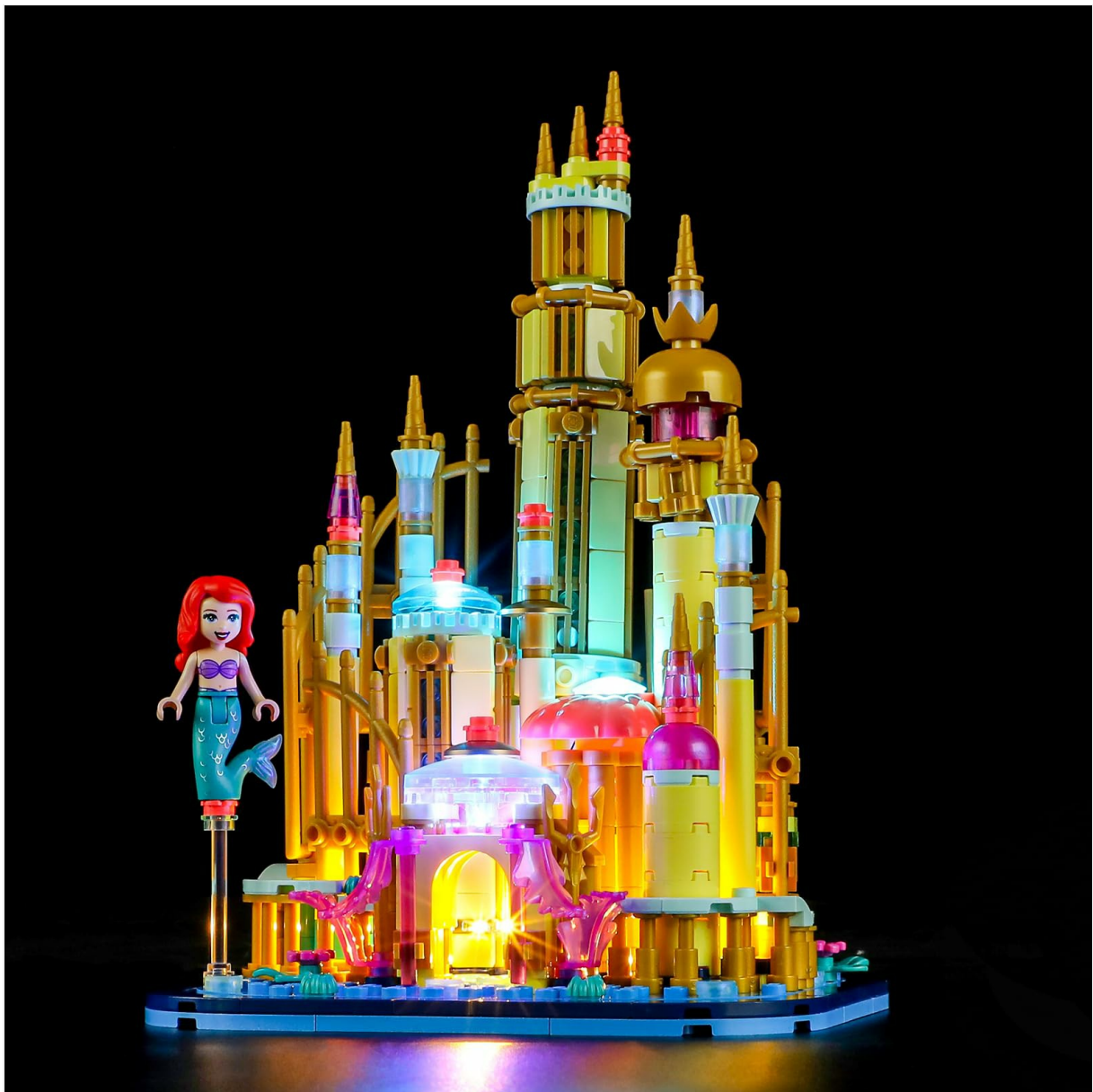
Image: The Disney Mini Ariel's Castle building set illuminated by the YEABRICKS LED Light Kit.