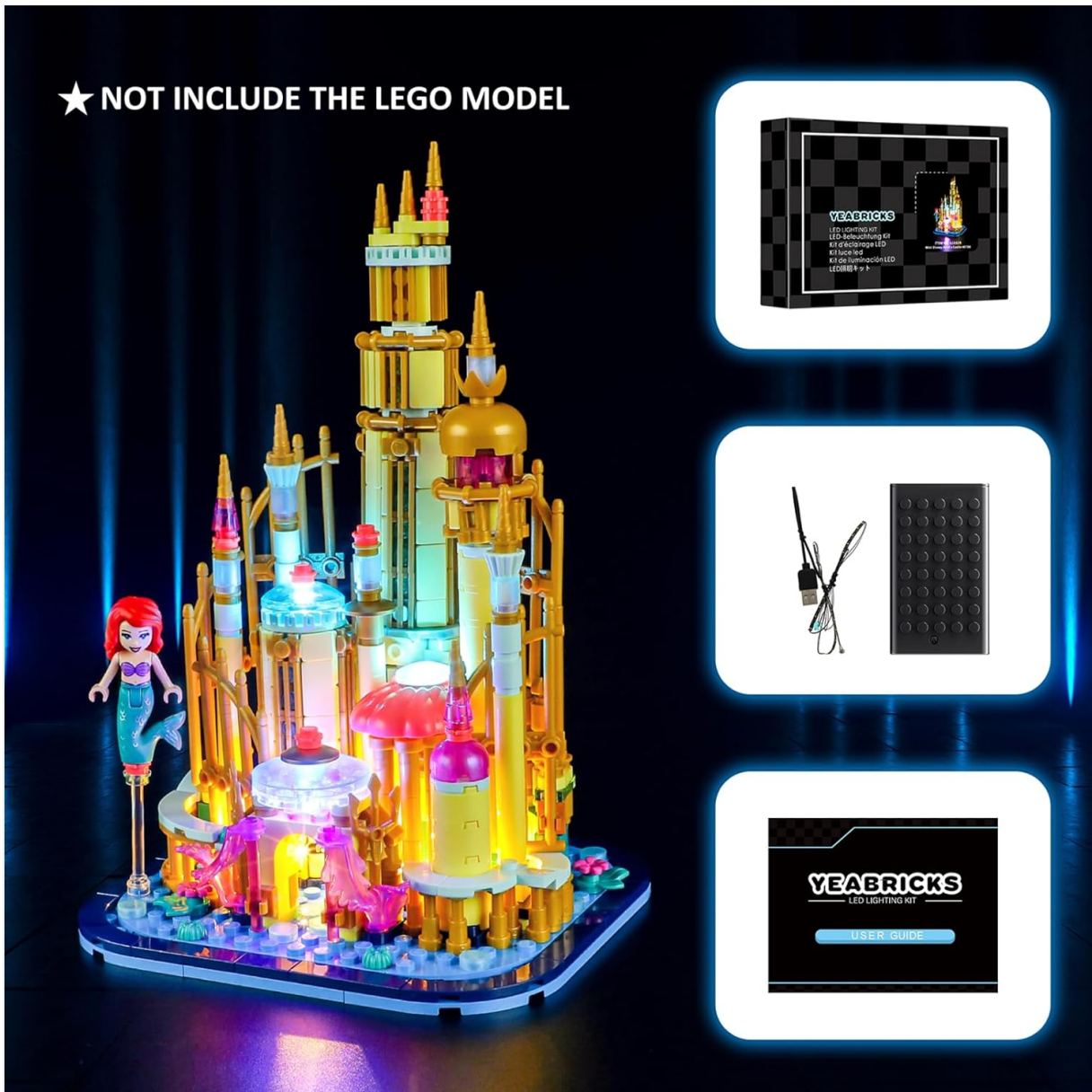
Image: The light kit package, LED components, battery box, and user guide, with a note that the LEGO model is not included.