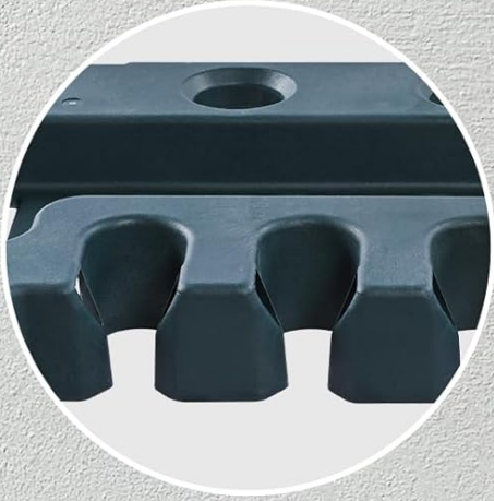
Garden Tool Rack with 10 Slots