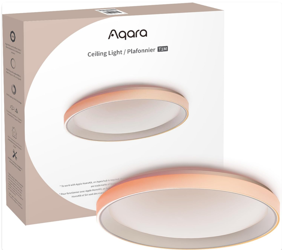
Figure 1.1: Aqara LED Ceiling Light T1M with its packaging.

Key features include a 50,000-hour lifespan, easy installation, and energy efficiency through Zigbee protocol, which also allows it to act as a mesh repeater for a more reliable network. The RGB+IC side light can also function as a status indicator for various smart home events.