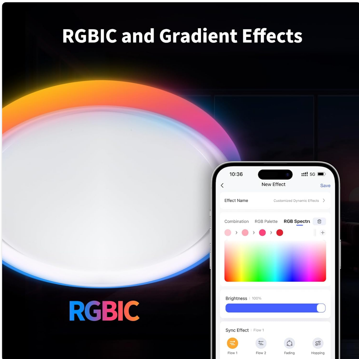
Figure 4.2: Customize RGBIC and gradient effects using the Aqara Home app.

The side light offers 16 million colors and advanced RGB+IC gradient effects, allowing for dynamic and customized ambiance. You can enable/disable the side light, adjust its brightness, and select from various dynamic or static effects within the app. The RGB+IC feature enables vivid color transitions and can also act as a status indicator for events like doorbell rings or security disarming.