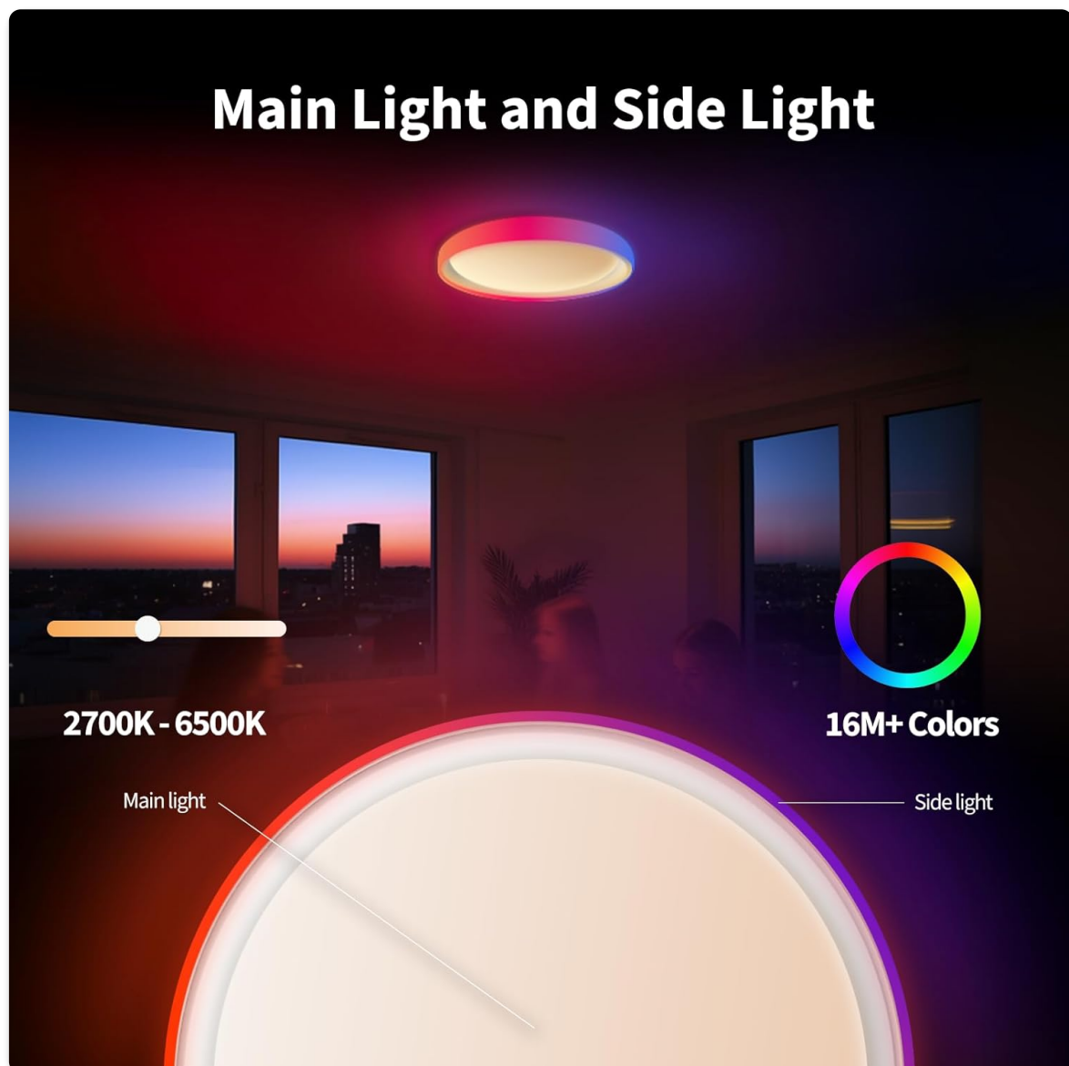
Figure 4.1: Main light (tunable white) and side light (16 million colors) functionality.

The main light provides tunable white illumination from 2700K (warm white) to 6500K (cool white). You can enable/disable the main light and adjust its brightness from 1% to 100% via the app. The Color Rendering Index (CRI) is above 90, ensuring vibrant and true-to-life colors.