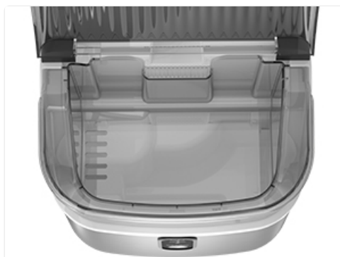
A top-down view illustrating the water tank and its maximum fill line.

Open the lid and fill the water tank with potable water up to the MAX fill line. The water tank capacity is 1.1 liters.