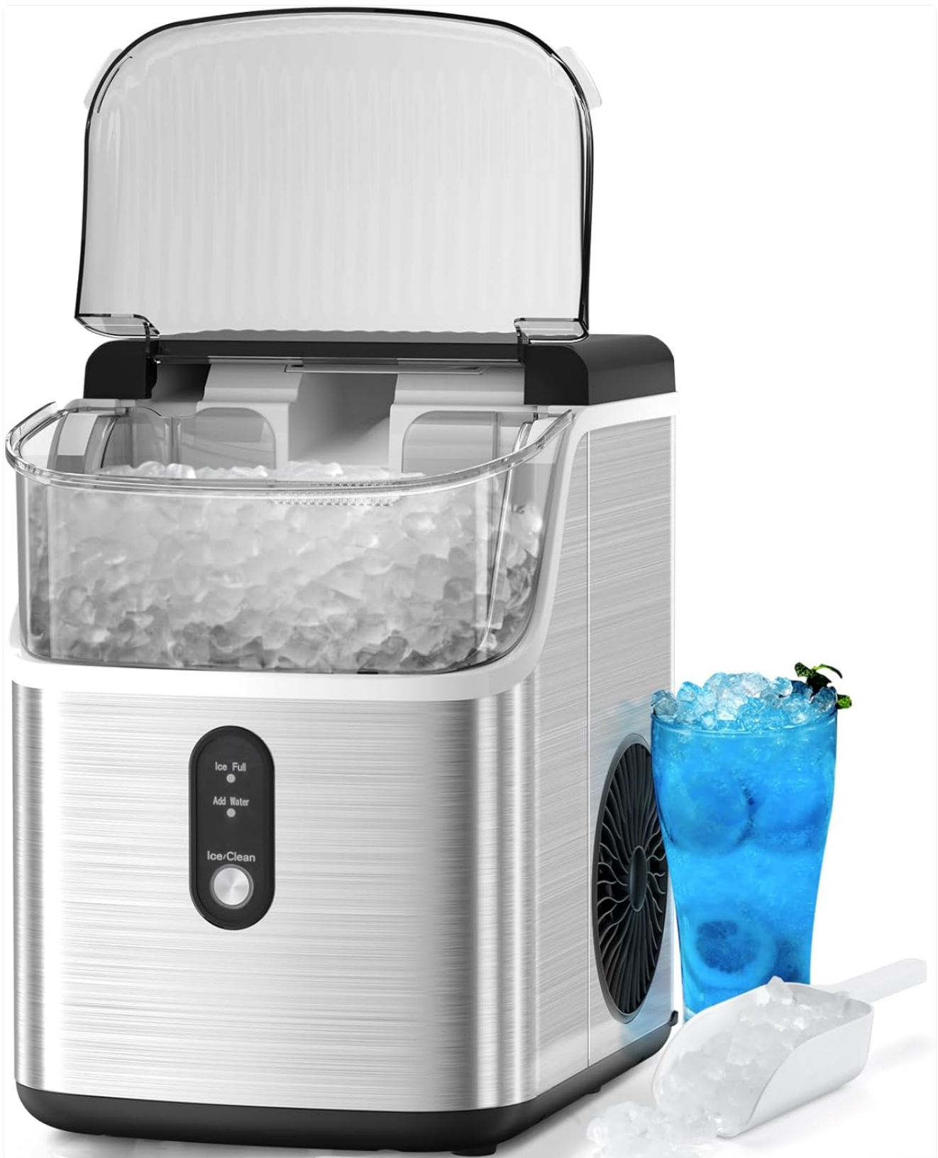
The Antarctic Star Nugget Ice Maker, showcasing its compact design and the type of ice it produces, alongside a refreshing beverage.