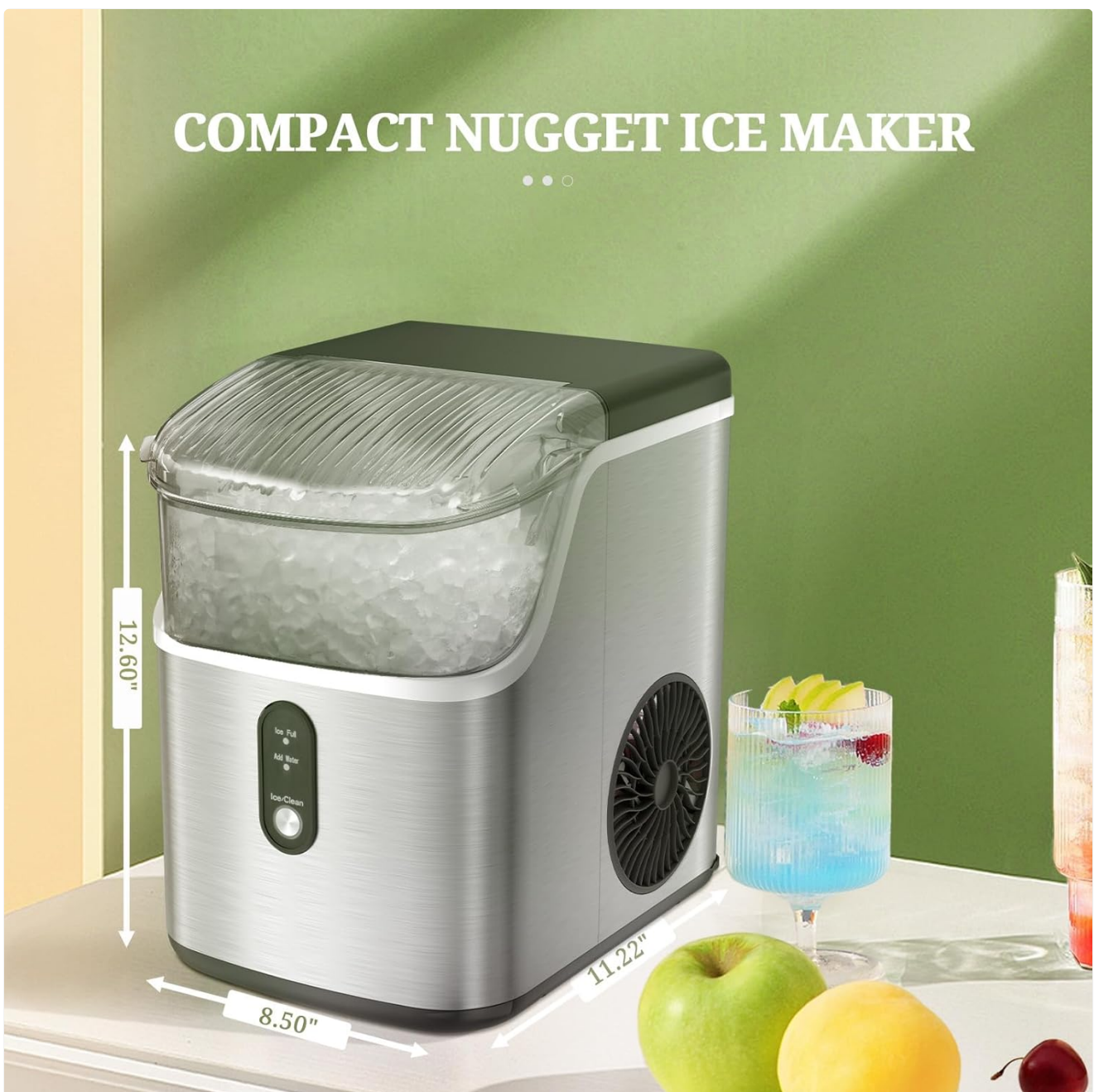
Front view of the ice maker highlighting its compact dimensions: approximately 12.60 inches high, 8.50 inches wide, and 11.22 inches deep.