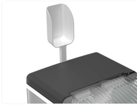
Detail of the convenient ice scoop holder integrated into the ice maker's design.