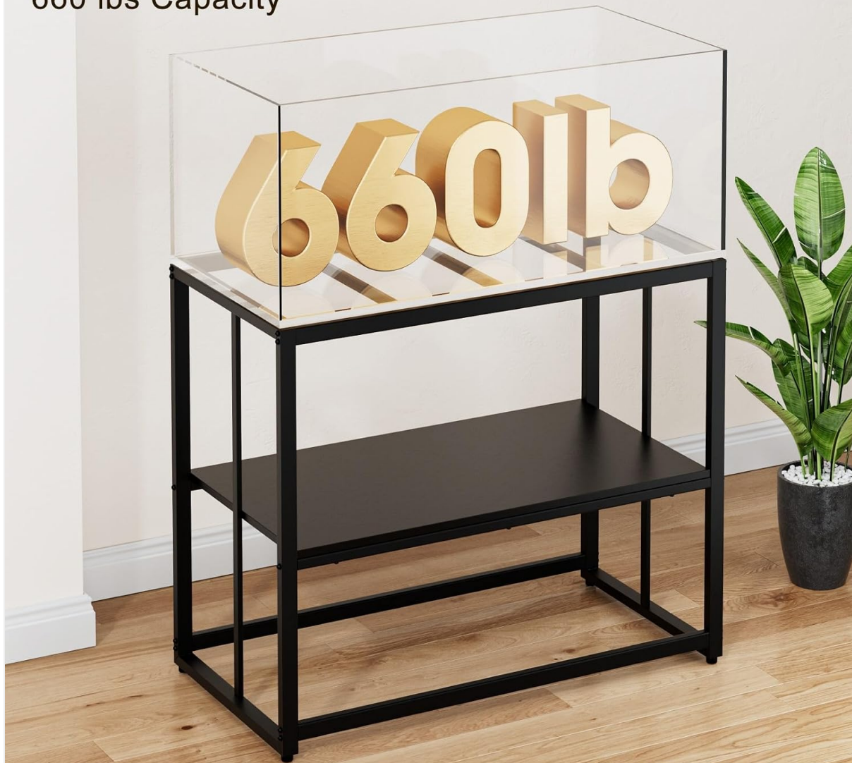
Image: The stand supporting a transparent box filled with weights labeled "660 lbs", visually confirming its robust load capacity.