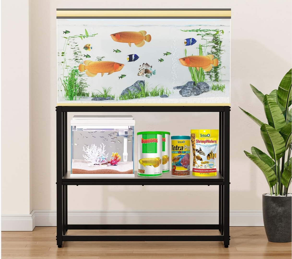
Image: The dual-layer functionality of the stand, showing a main aquarium on the upper tier and a smaller tank with various supplies on the lower shelf, demonstrating versatile use.

Supports multiple tanks or storage – versatile for all your aquarium setups.