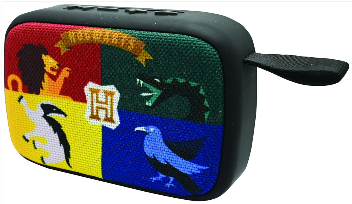
Figure 3: Side View with Carrying Strap

The side view of the speaker highlights its compact size and the durable black carrying strap, designed for portability.