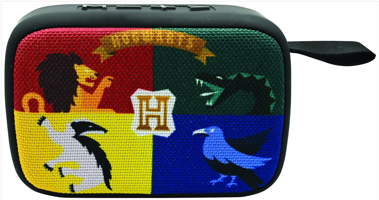
Figure 1: Front View of the Speaker

This image displays the front of the speaker, featuring the colorful crests of the four Hogwarts houses: Gryffindor, Hufflepuff, Ravenclaw, and Slytherin. The speaker has a black silicone casing and a fabric finish on the front.