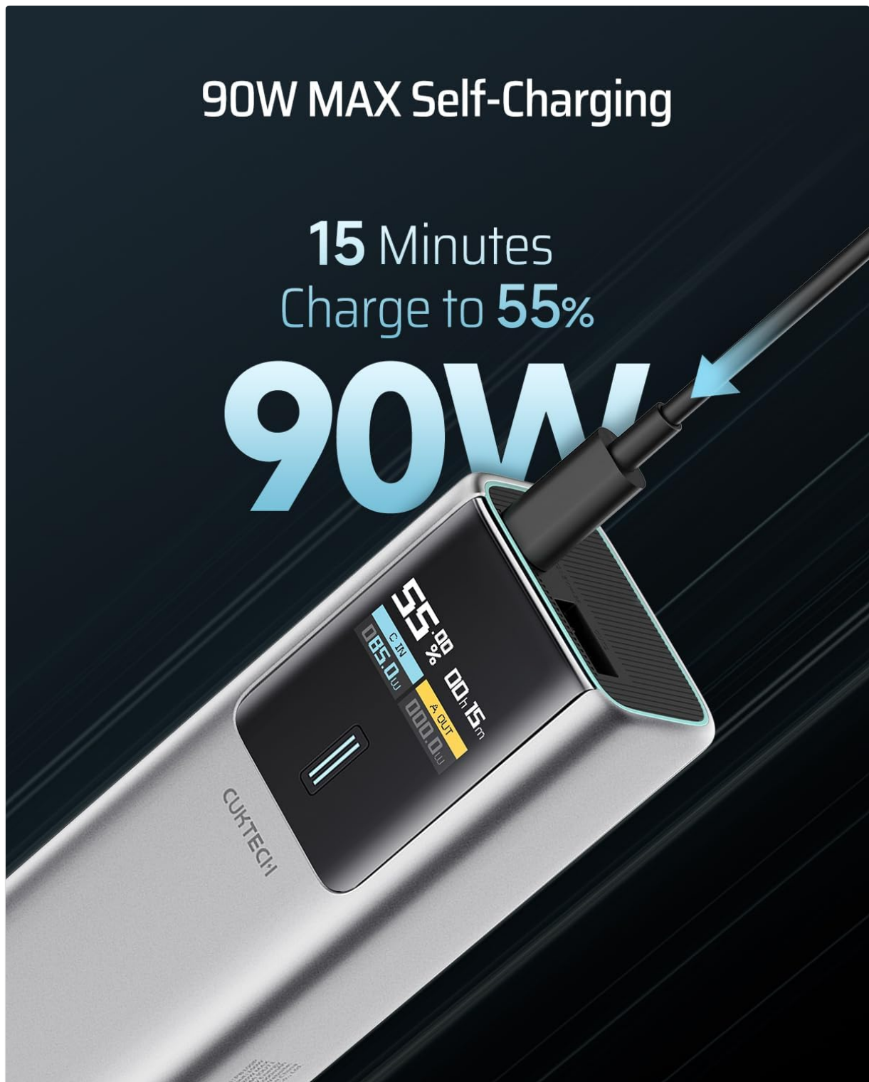
Image: The power bank's smart display indicates 55% charge, highlighting its 90W MAX self-charging capability.