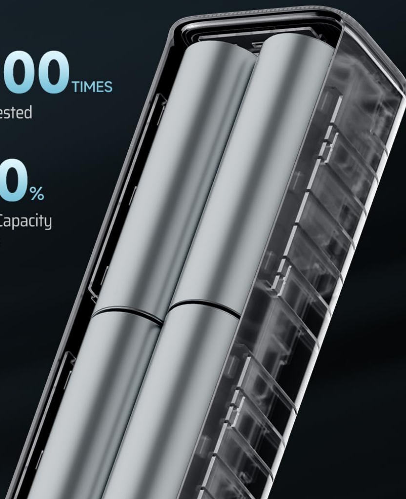
Image: Internal view highlighting the premium automotive-grade power cells designed for extended and long-lasting energy.