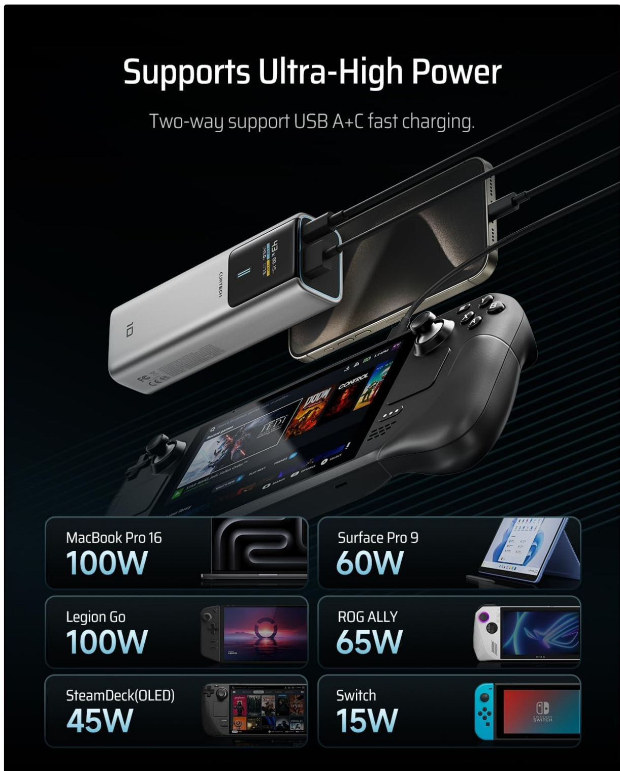
Image: The power bank simultaneously charging a smartphone and a gaming device, demonstrating its multi-device ultra-high power support.