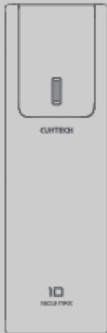
CUKTECH Power Bank P Series 10000mAh 150W User Manual

User manual for the CUKTECH Power Bank P Series 10000mAh 150W, detailing product features, screen introduction, specifications, button functions, warnings, and precautions.