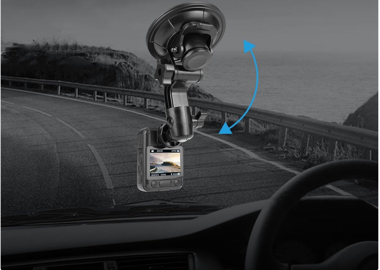
Image: The Retevis RT79 Body Camera mounted on a car dashboard using the suction bracket.

Easy to install bodycam to the vehicle for work use