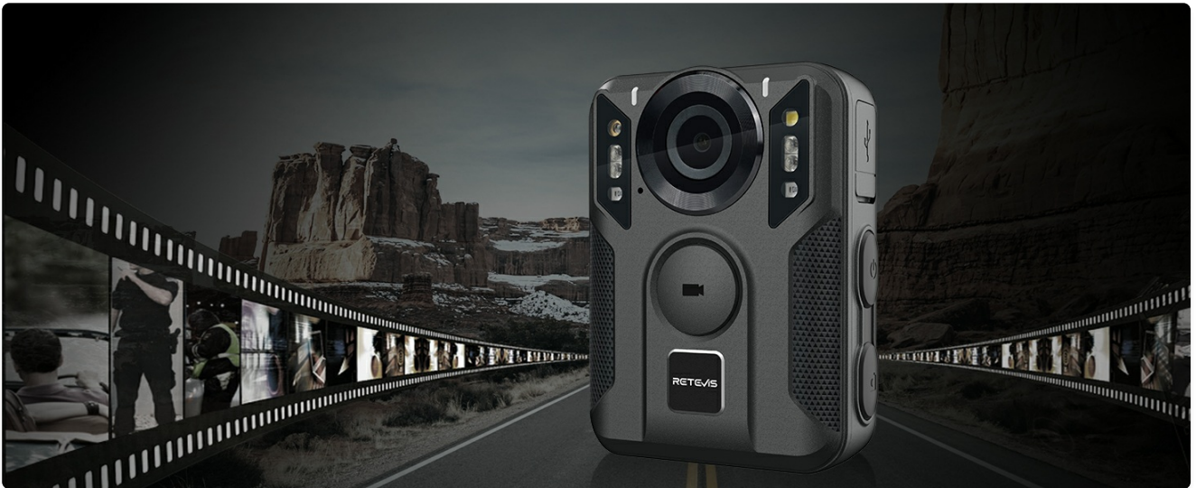
Image: The RT79 Body Camera showing its clear video quality and recording capabilities.