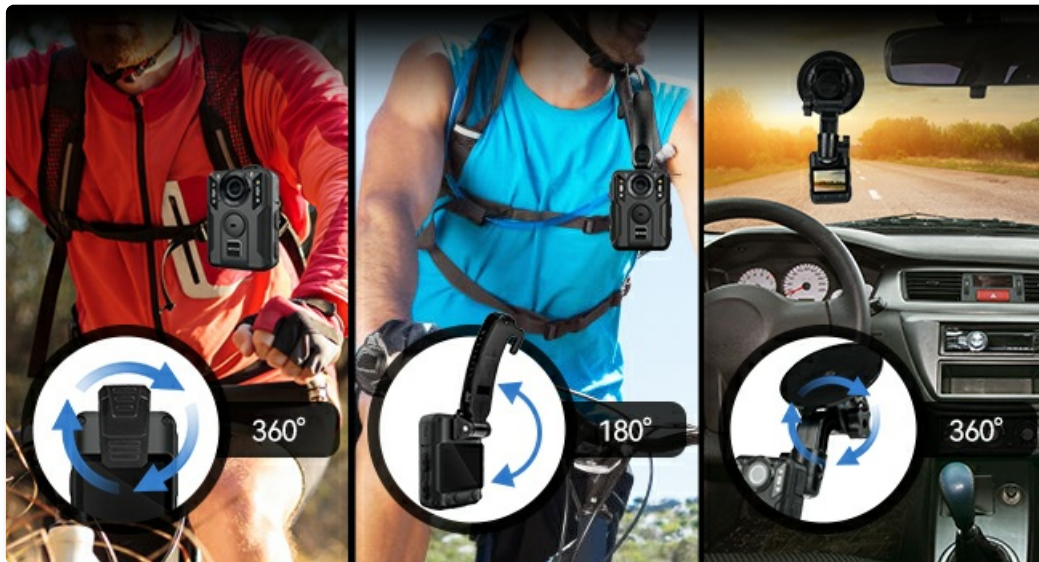
Image: The RT79 Body Camera's robust construction, highlighting its durability.