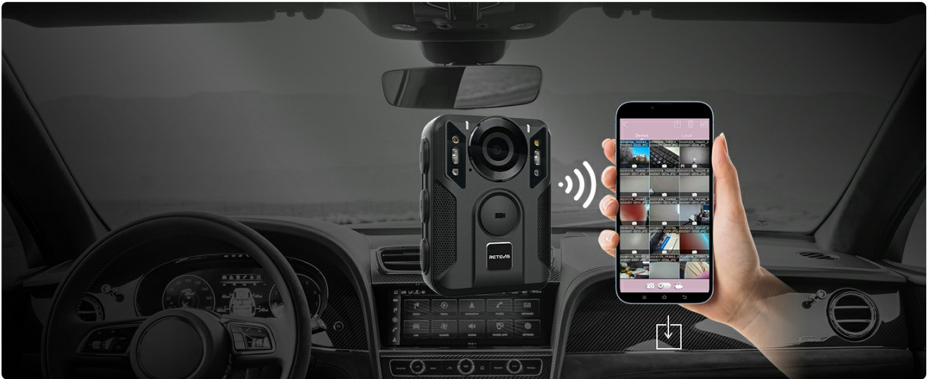
Image: The RT79 Body Camera demonstrating wireless export functionality with a smartphone.

Your browser does not support the video tag.