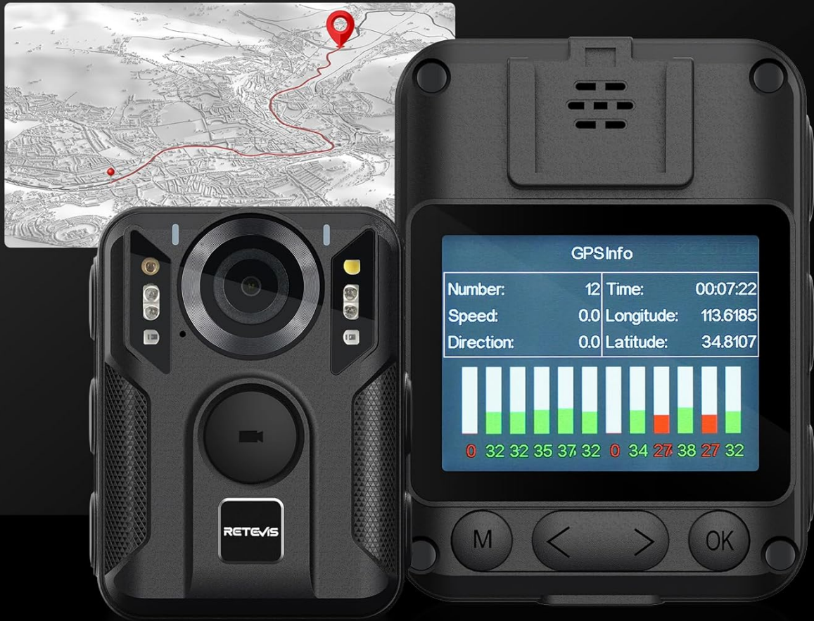
Image: The RT79 Body Camera's screen displaying GPS information and a map for location tracking.

Support locating the position and checking the video track (not included)