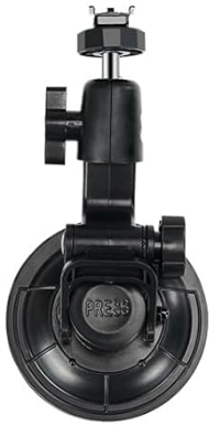
Car suction bracket x1