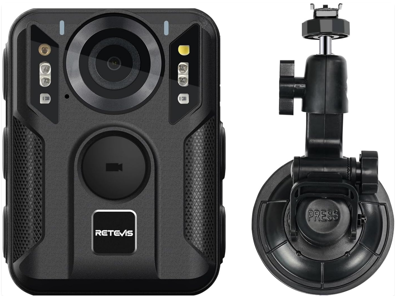
Image: Front view of the Retevis RT79 4K Body Camera alongside its car suction bracket.