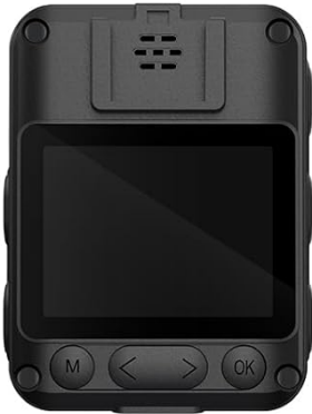
Body worn camera x1