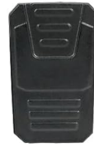
Short clip x1