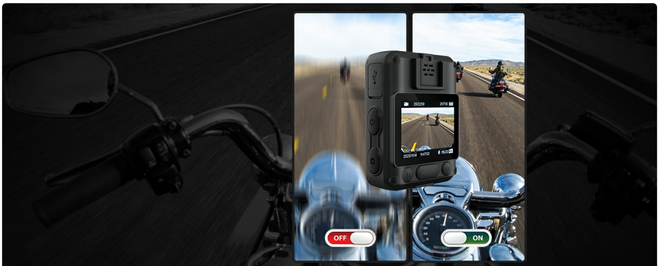
Image: The RT79 Body Camera illustrating its anti-shake capability during motion recording.

Image: A visual comparison demonstrating the effectiveness of the automatic night vision feature.