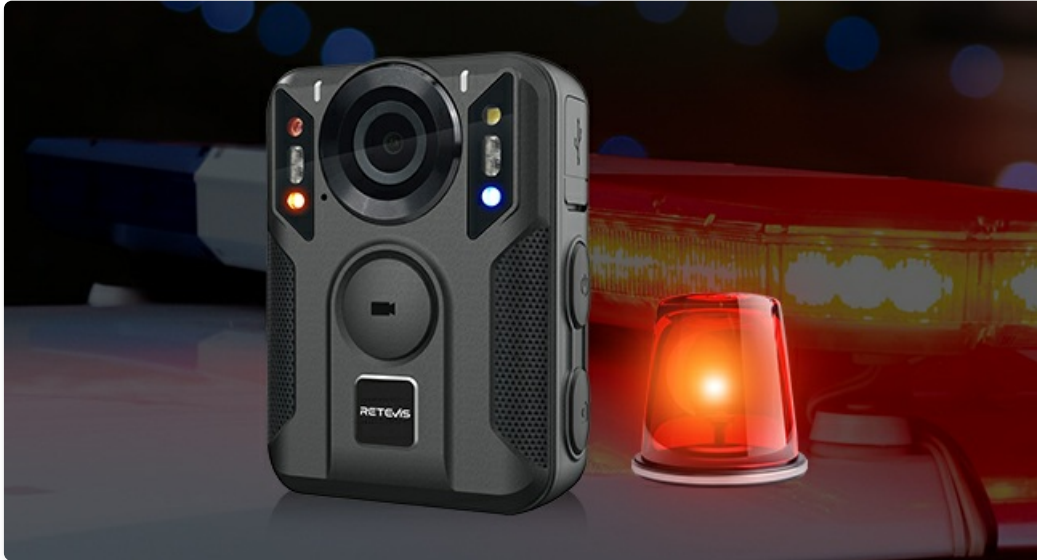
Image: Close-up of the Retevis RT79 Body Camera highlighting the Type-C charging port and battery capacity.

Your browser does not support the video tag.