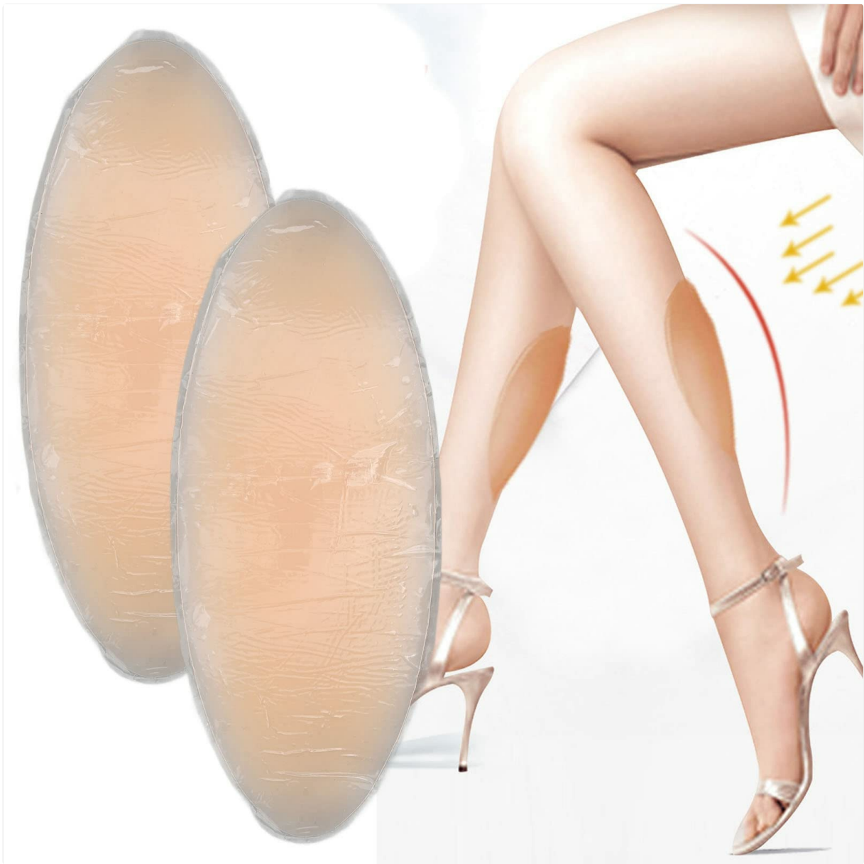
Image: The NSXAYIWE Silicone Calf Pads shown in use on a leg and as individual pads.