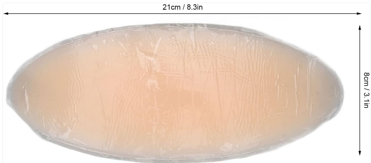
Image: A single silicone calf pad with its approximate dimensions labeled.