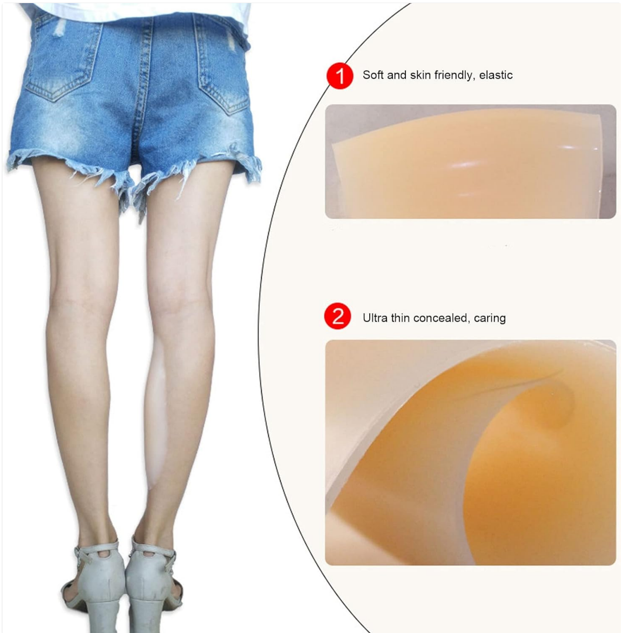
Image: A close-up view highlighting the soft, skin-friendly, and elastic texture of the silicone material.