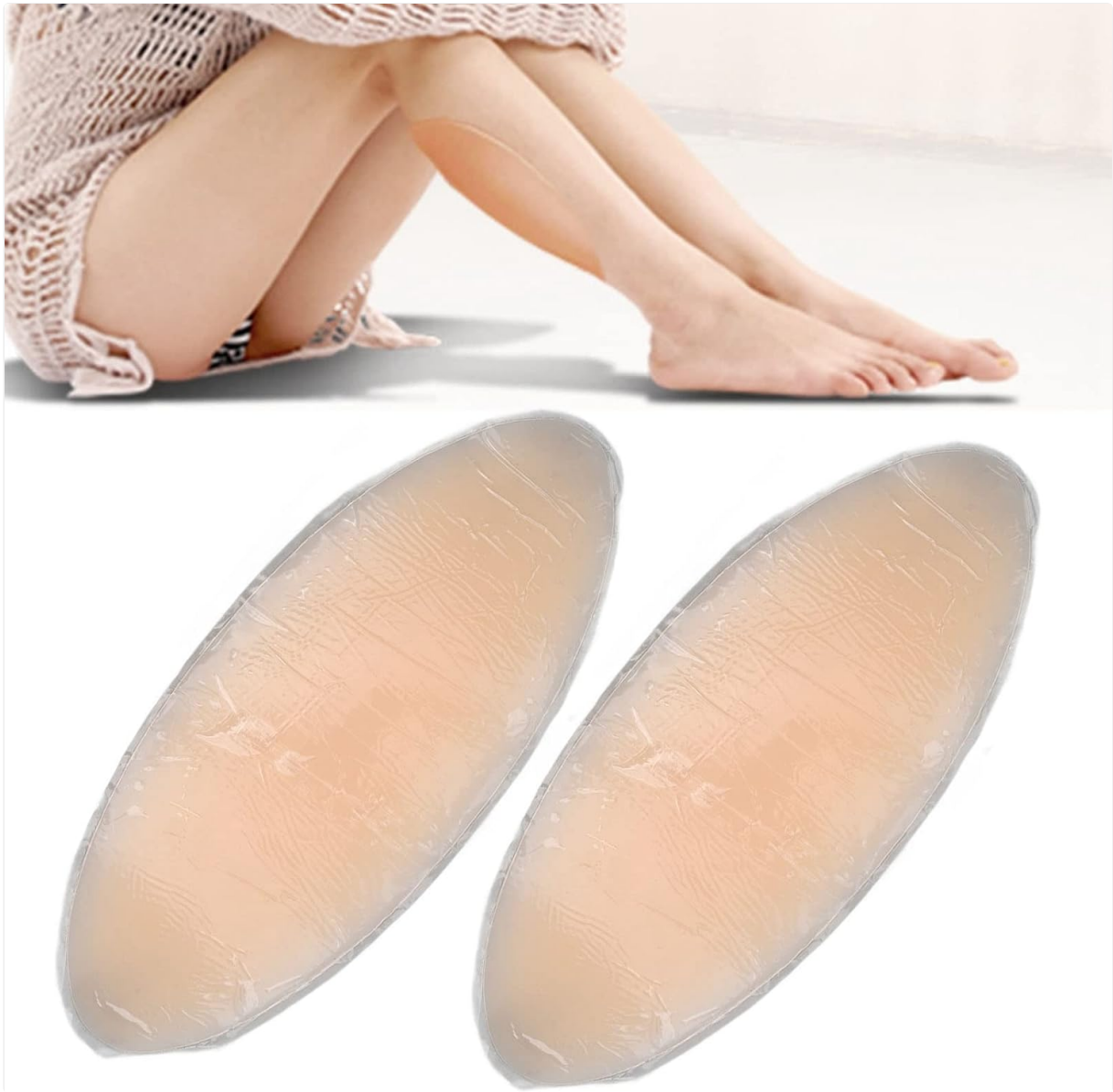
Image: A silicone calf pad discreetly placed on the inner calf of a leg.