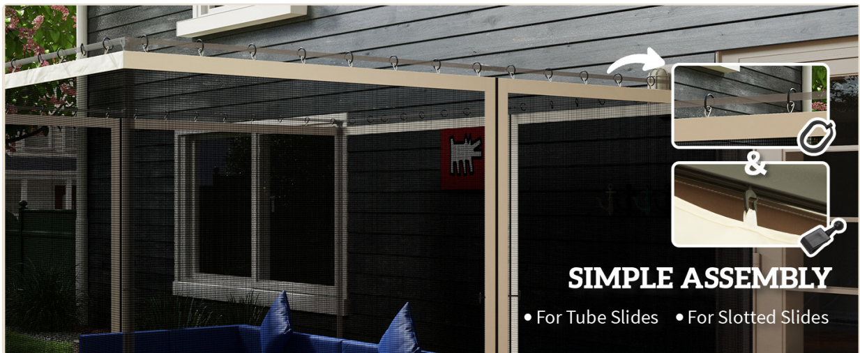
Image: An illustration demonstrating the two types of attachment methods: open C-rings for tube slides and plastic chute hooks for slotted slides.