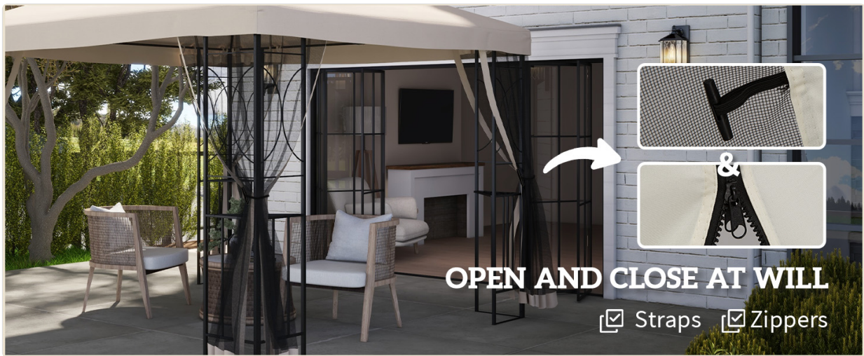
Image: An illustration showing how the netting panels can be opened and closed using zippers and secured with straps.