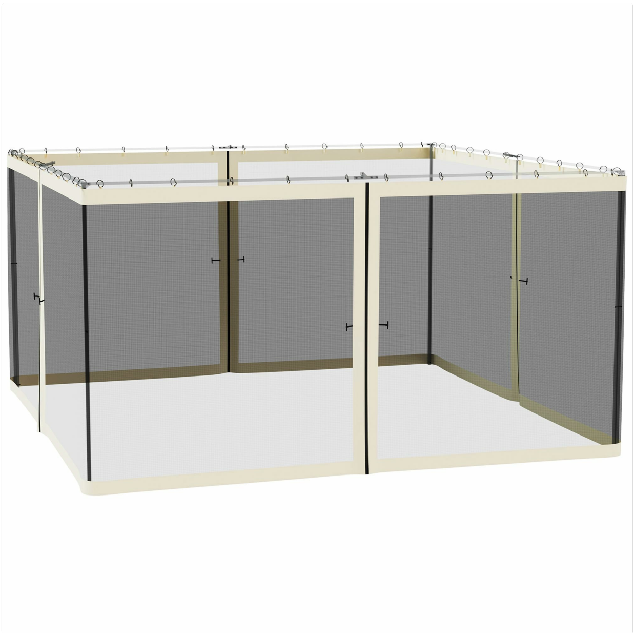
Image: An Outsunny 13' x 13' gazebo with the cream white mosquito netting fully installed, providing an enclosed outdoor living space.