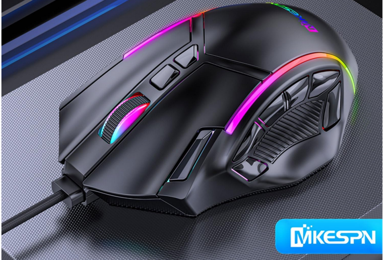
Image: The MKESPN X15 Gaming Mouse, highlighting its 12-key macro programming, RGB backlight, and 12800 DPI capabilities.

--- 12 Key Game Macro Programming RGB Backlight | 12800dpi