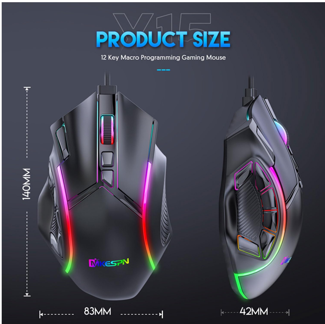
Image: The MKESPN X15 Gaming Mouse with its dimensions labeled: 140mm length, 83mm width, and 42mm height.