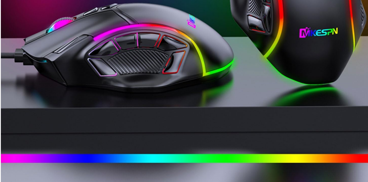
Image: Two MKESPN X15 Gaming Mice displaying vibrant RGB backlighting, illustrating the 13 available lighting effects.

Equipped with 13 kinds of RGB cool lighting effects of about 16.8 million colors, Between the illuminating of light and shadow, the trend becomes extraordinary