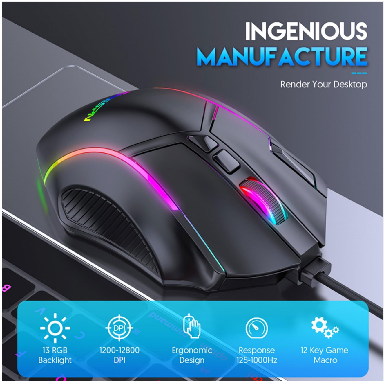
Image: The MKESPN X15 Gaming Mouse, illustrating its 1200-12800 DPI range, ergonomic design, and 12-key macro capability.

The MKESPN X15 mouse features 6 adjustable DPI levels, allowing you to switch sensitivity on the fly, up to a maximum of 12800 DPI. Use the dedicated DPI+ and DPI- buttons located on the top of the mouse to cycle through the sensitivity settings.