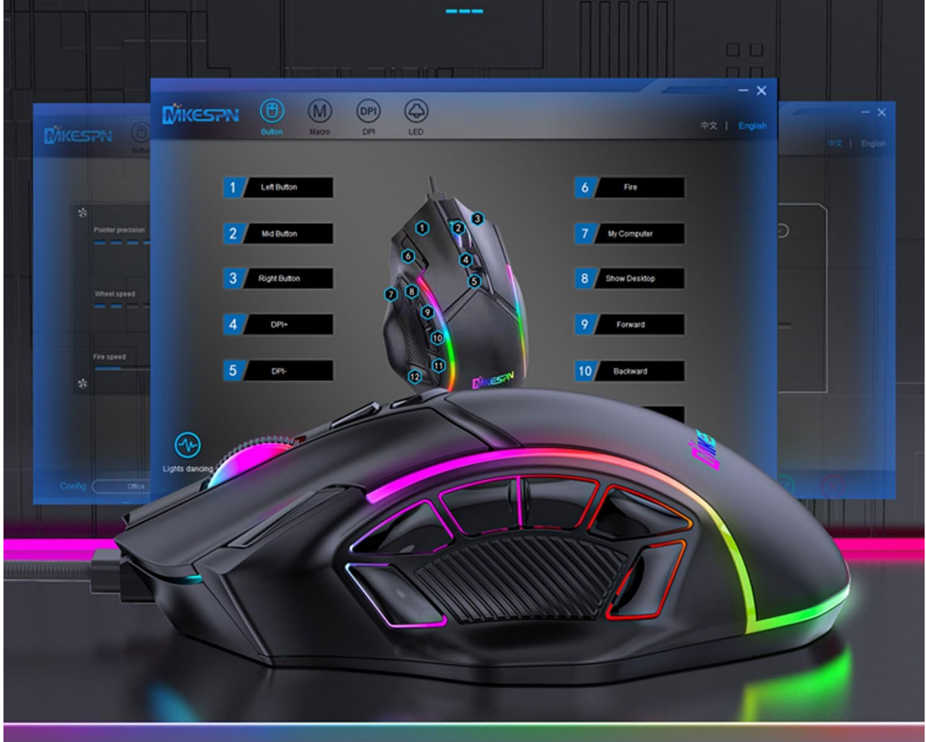
Image: A visual representation of the MKESPN X15 Gaming Mouse's software interface, demonstrating how to program its 12 keys for various functions like Left Button, Mid Button, Right Button, DPI+, DPI-, Fire, My Computer, Show Desktop, Forward, Backward, Mute, and One-click Internet.

Multiple macro programming keys, individual setting functions according to personal habits. lighting the report rate and adjusting the DPI value at your will.