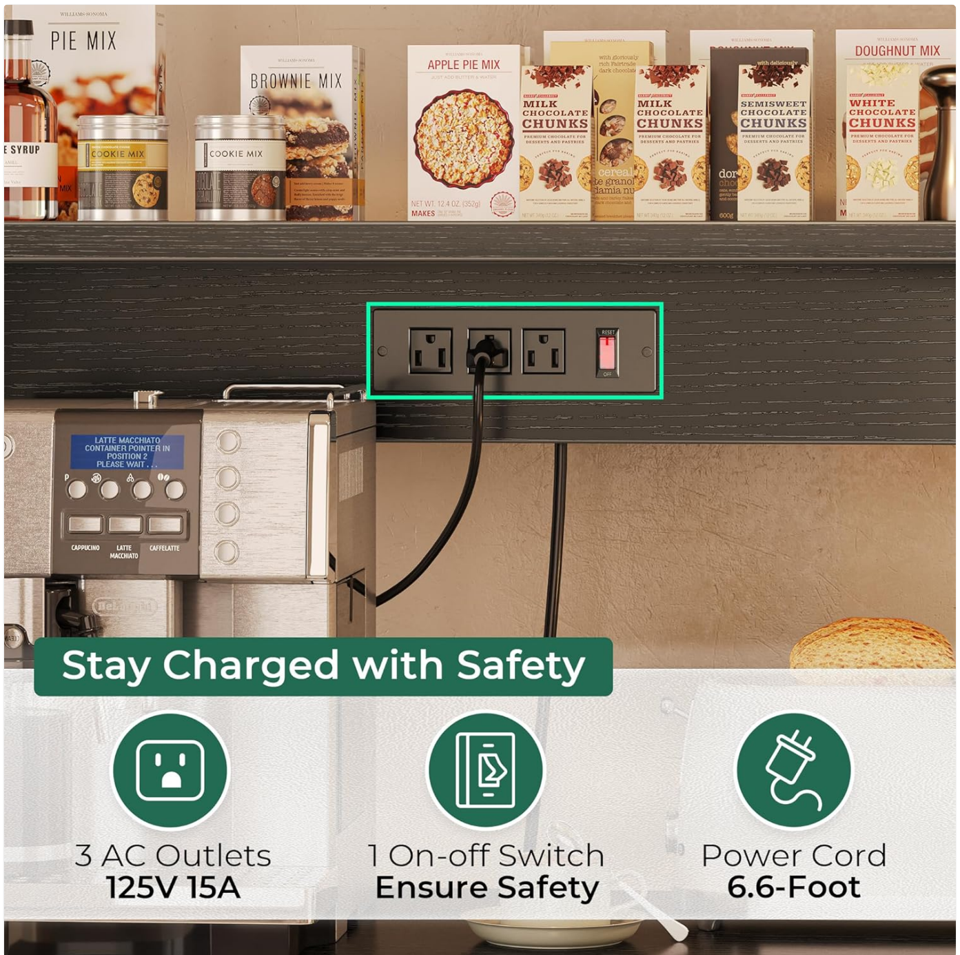
Figure 4: Detail of the 3 AC outlets and on-off switch for safe power management.