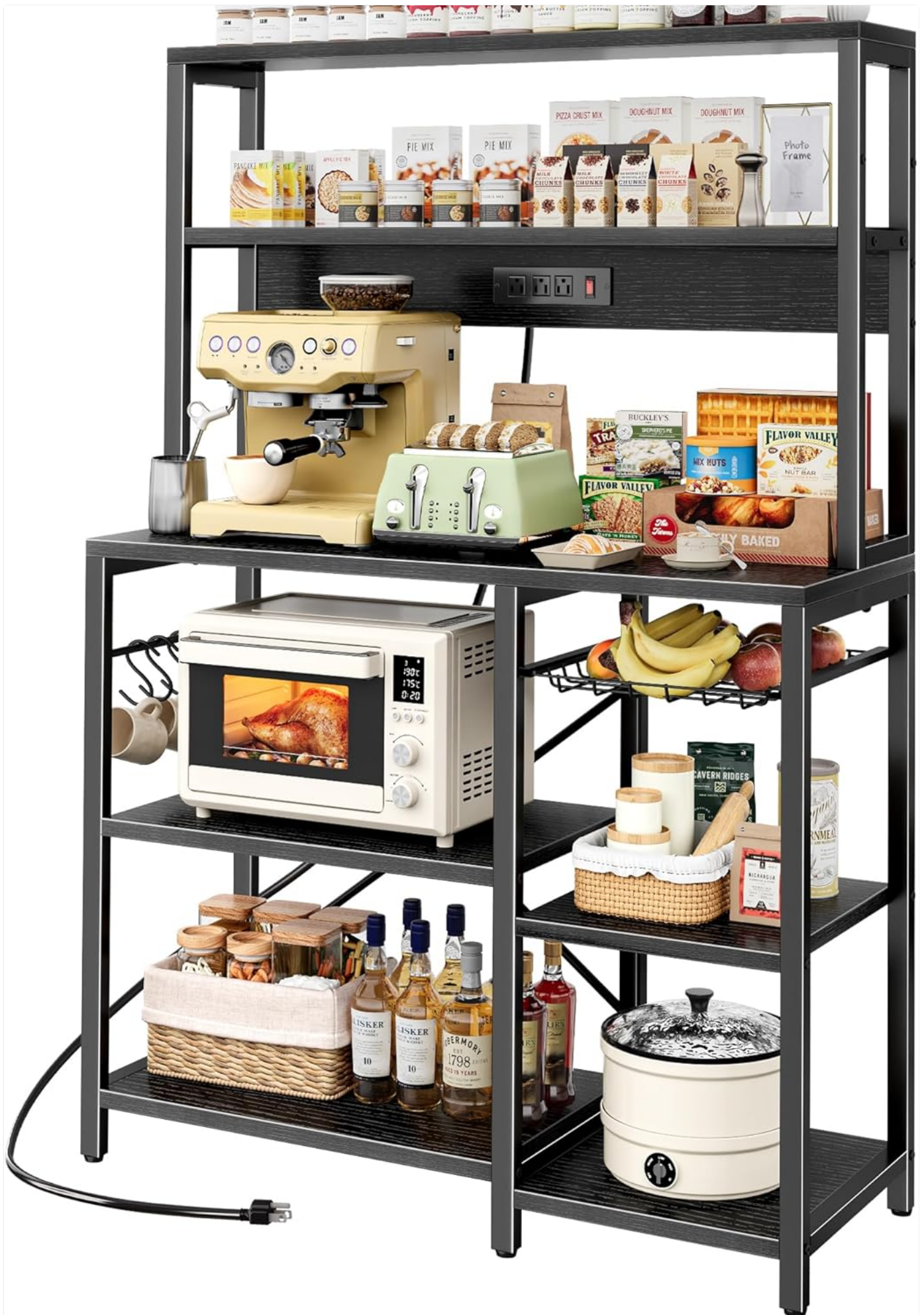
Figure 1: Fully assembled SUPERJARE Bakers Rack, showcasing its storage capabilities and integrated power outlet.