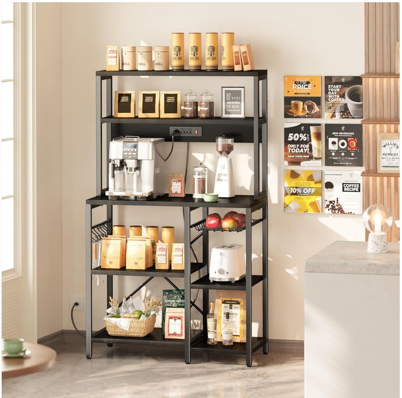
Figure 5: Safety features of the integrated power strip.