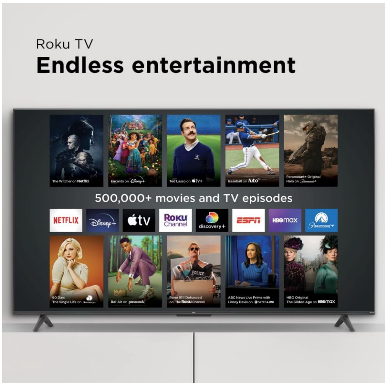
Image: The Roku TV home screen showing icons for popular streaming services like Netflix, Disney+, Apple TV, Roku Channel, Discovery+, ESPN, HBO Max, and Paramount+.

The Roku TV home screen provides easy access to all your entertainment. Your favorite broadcast TV, streaming channels, gaming console, and other devices are displayed on a simple, customizable home screen. Use the remote control to navigate between inputs and streaming apps.