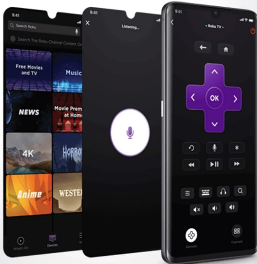
Image: Screenshots of the Roku mobile app interface on a smartphone, showing search, content browsing, and remote control functions.