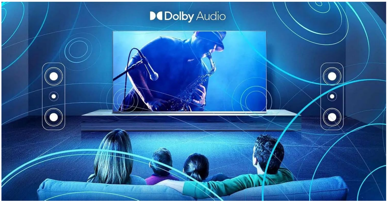
Image: The Dolby Audio logo positioned above a graphic depicting sound waves emanating from a TV screen, illustrating the immersive audio experience.