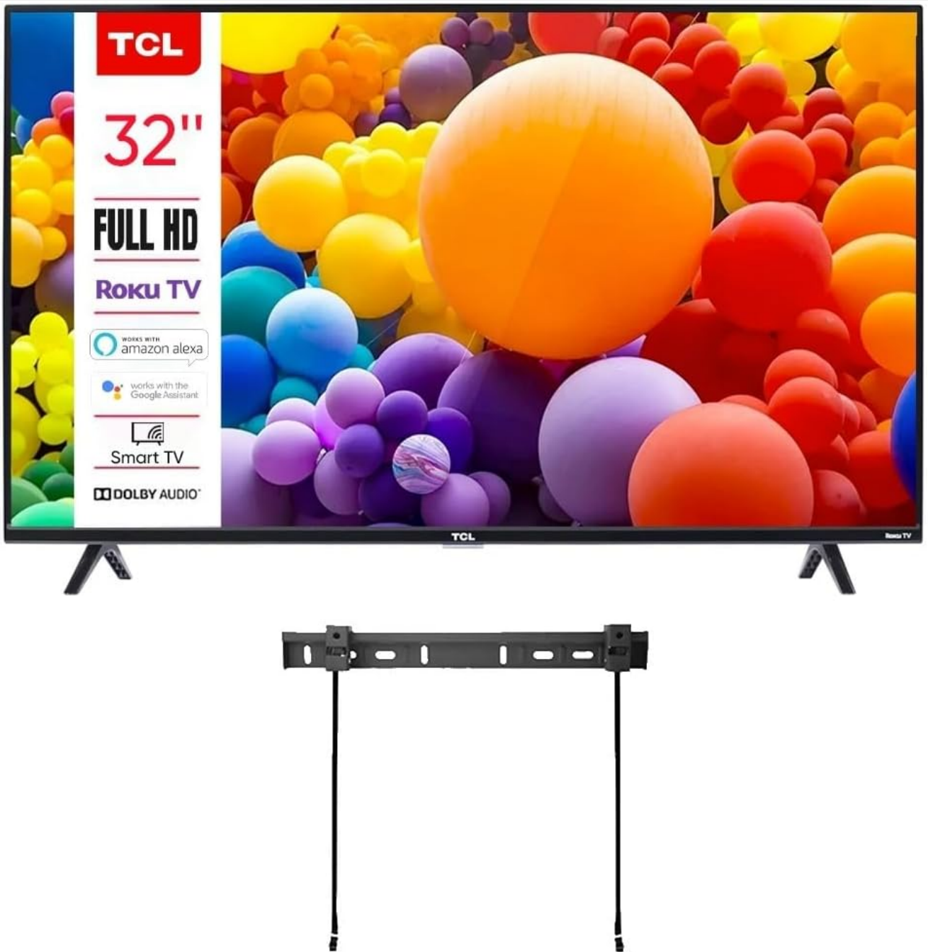
Image: The TCL 32-Inch Roku TV displayed with its included wall mount bracket below it.