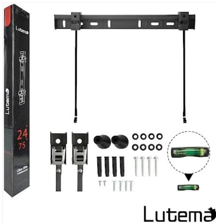
Image: Various components of the wall mount kit, including the main bracket, mounting hardware, and a small level.