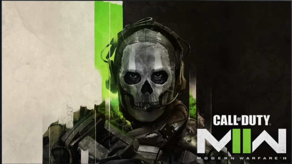
Image: The TCL TV screen displaying a video game, indicating its suitability for gaming.