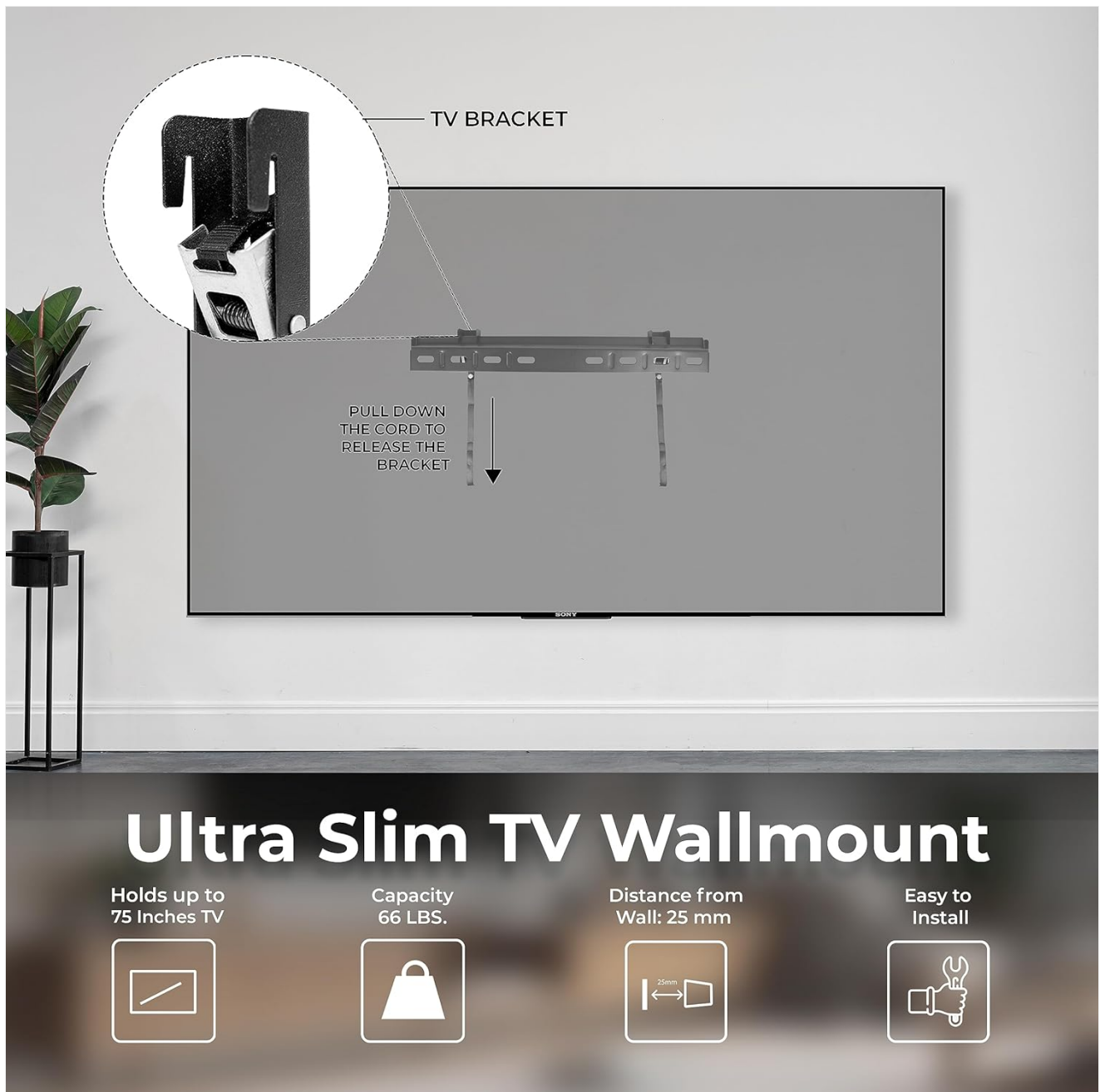
Image: A diagram illustrating the installation of an ultra-slim TV wall mount, showing how the TV bracket attaches to the TV and then hooks onto the wall plate. It also highlights the pull-down cord for releasing the bracket.