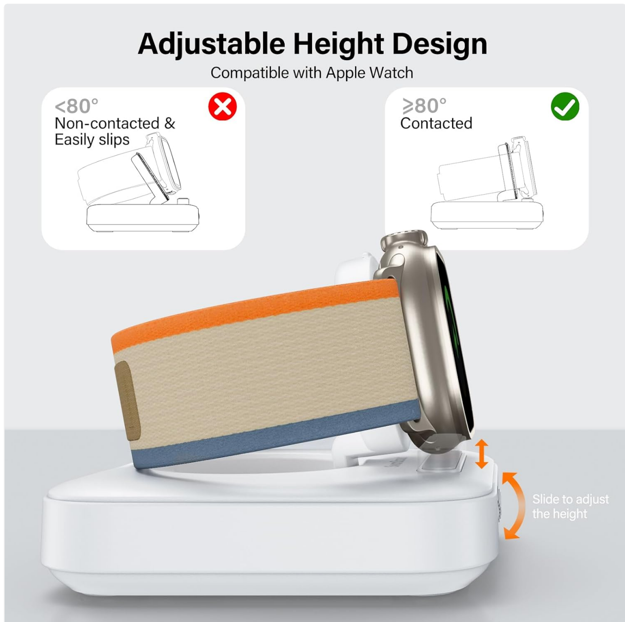
Image: An image illustrating the adjustable height feature of the charging pad, demonstrating how to slide the silicon pad to ensure optimal contact with the Apple Watch for efficient charging.

The charging pad features an adjustable height mechanism. Slide the silicon pad to raise or lower the charging surface. This ensures optimal contact for various Apple Watch models and prevents the watch from slipping.