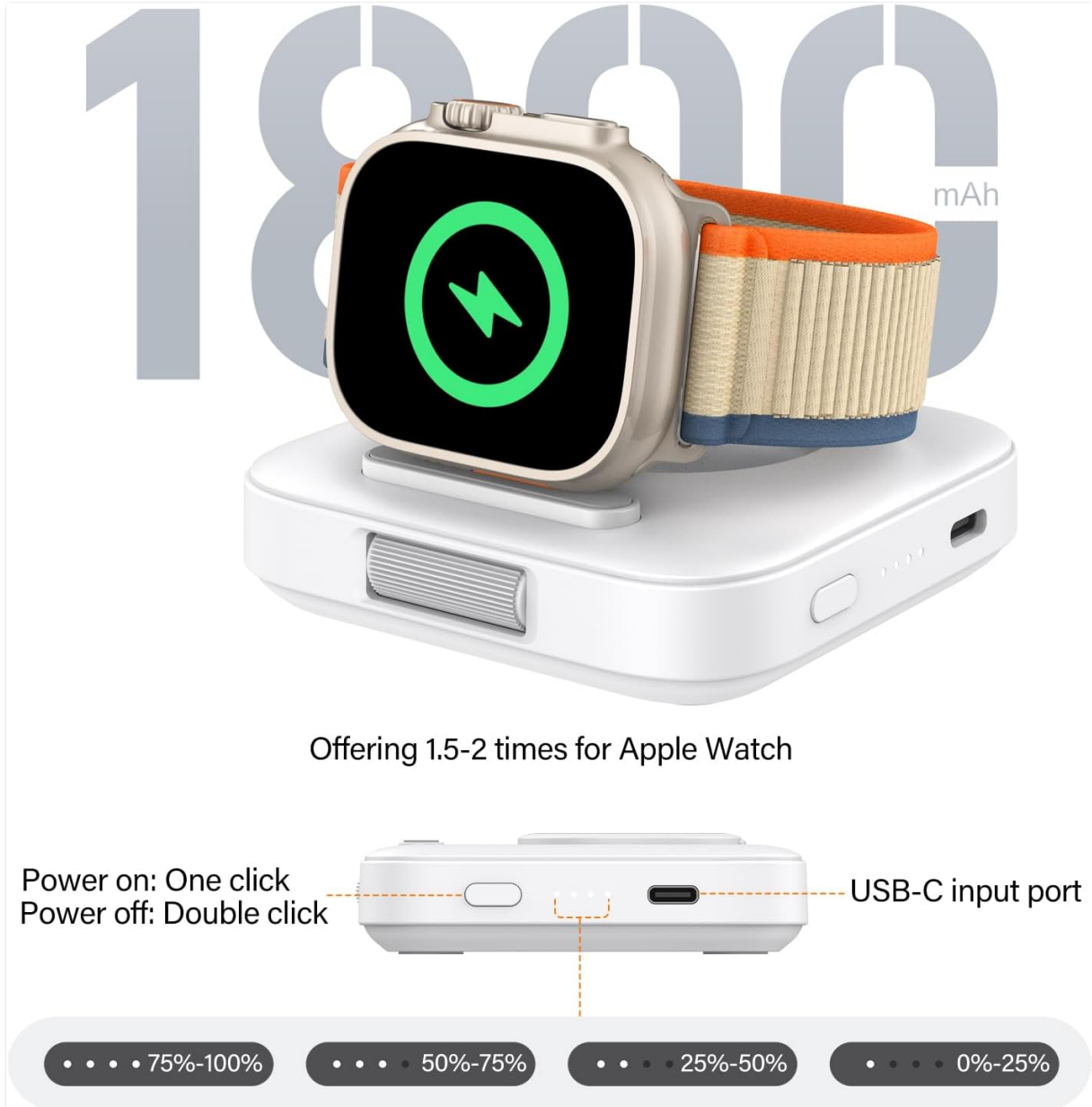
Image: A close-up view of the portable charger highlighting its 1800mAh battery capacity and the LED indicators that display the remaining power level and charging status. The USB-C input port is also visible.