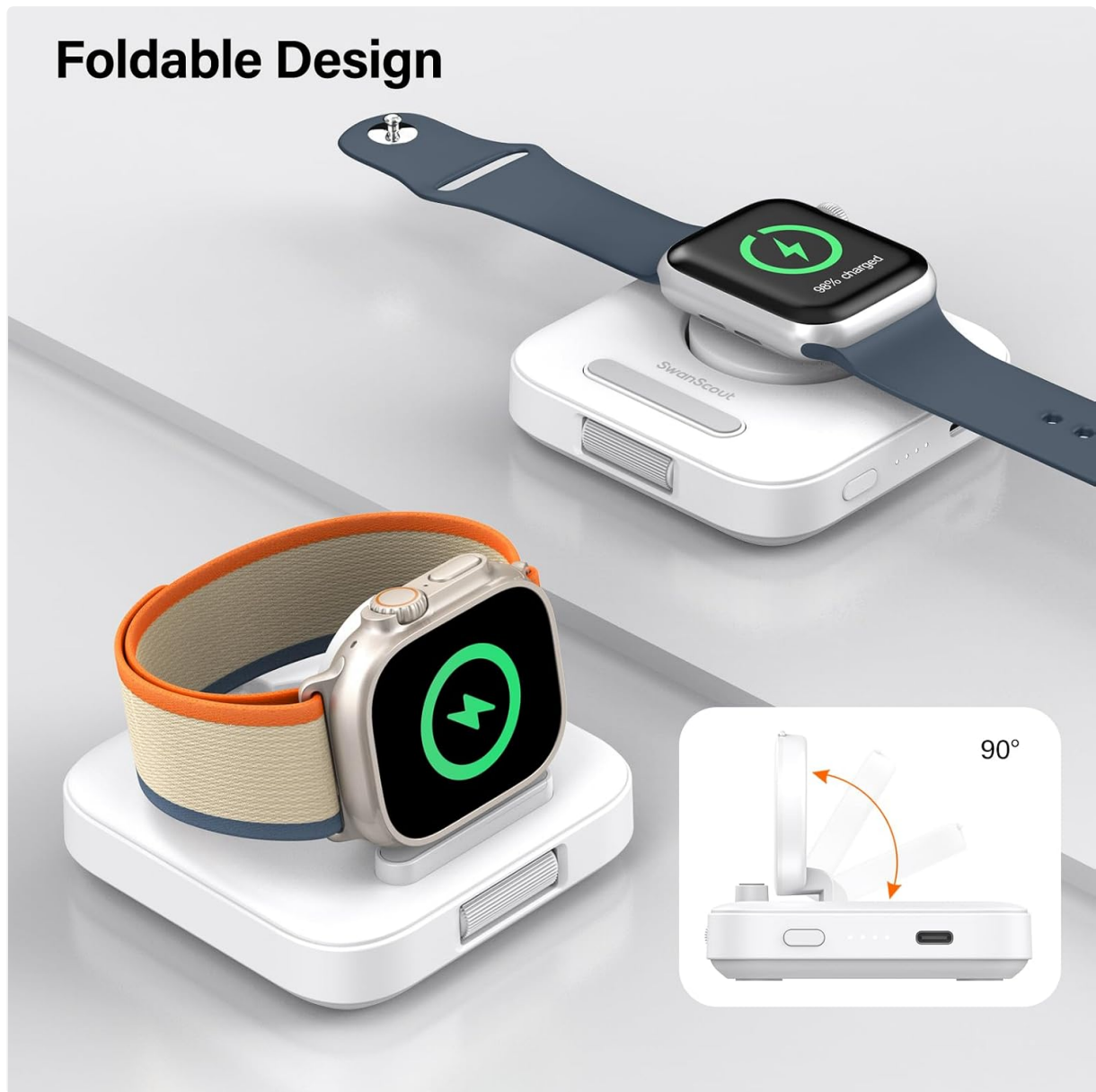
Image: An image showing the charger in both its upright charging position and its folded, compact state, emphasizing its portability and space-saving design.