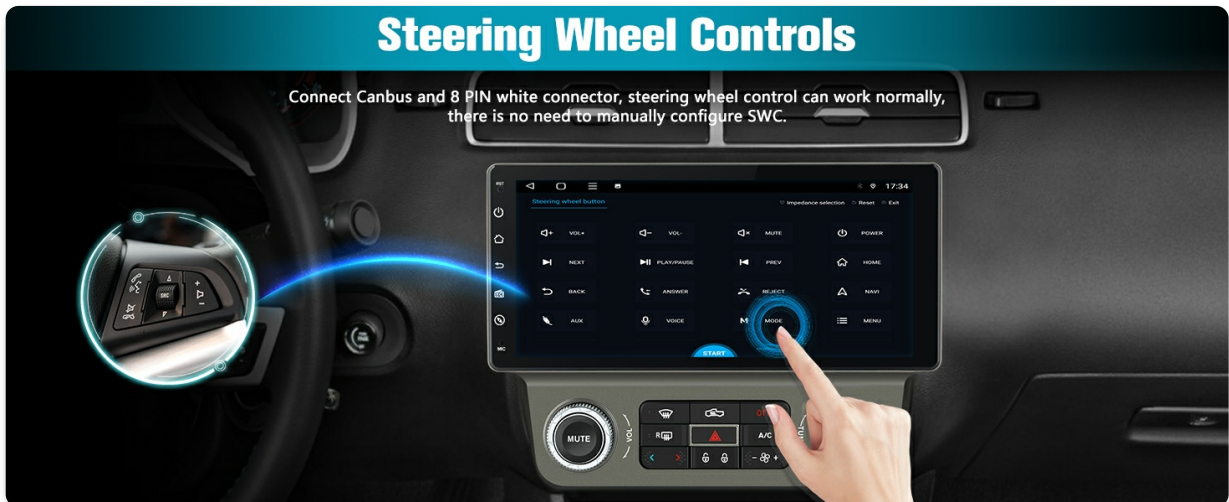
Connect Canbus and 8 PIN white connector, steering wheel control can work normally, there is no need to manually configure SWC.

After connecting the Canbus and 8-pin white connector, your vehicle's original steering wheel controls will function with the new stereo. Manual configuration of Steering Wheel Controls (SWC) is typically not required.