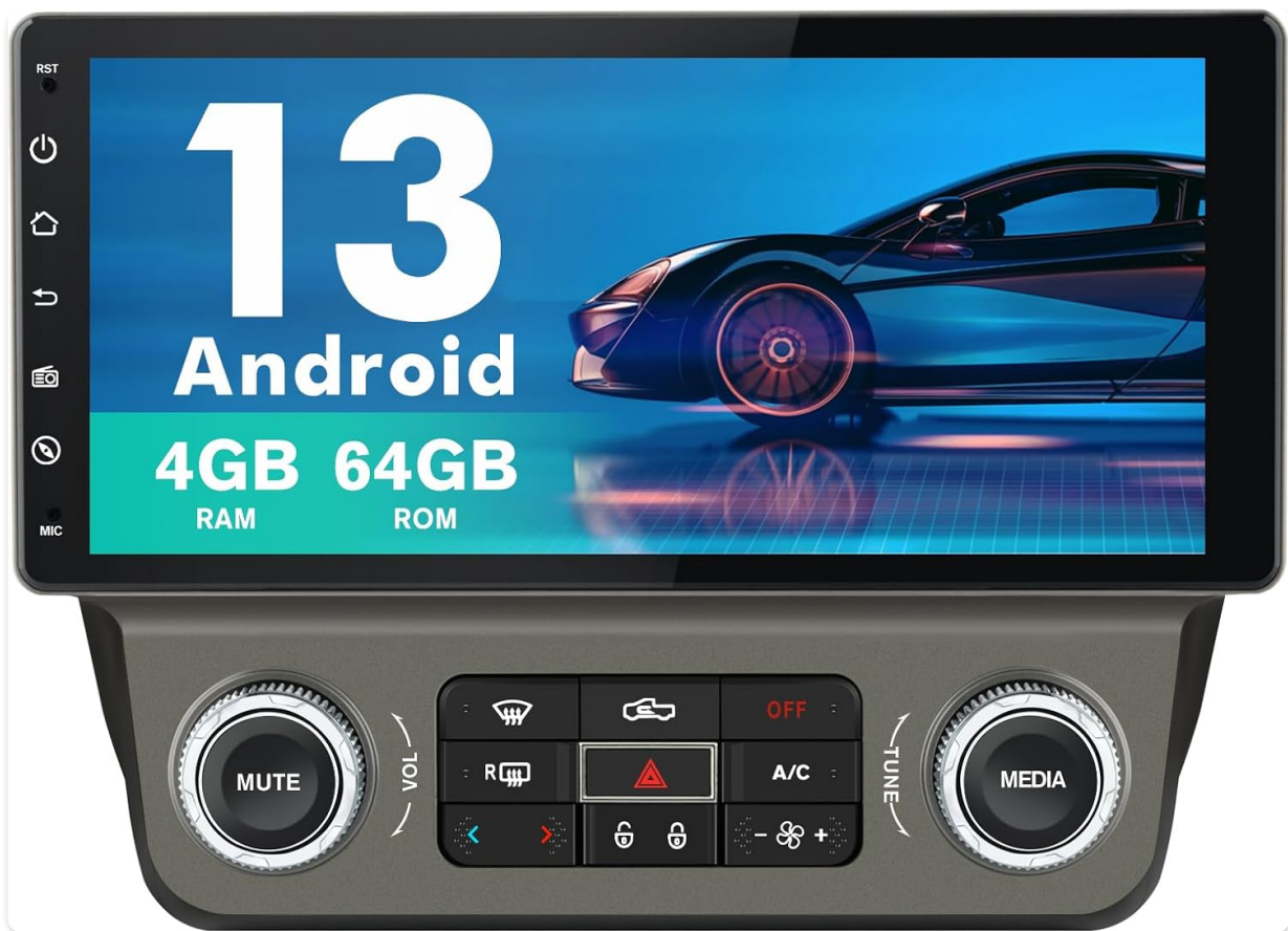
The AWESAFE 10-inch Android Car Stereo featuring the Android 13 operating system.