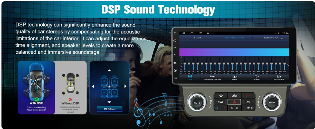
Graphic illustrating DSP sound technology with equalization and soundstage adjustments.

The integrated DSP technology enhances audio quality by compensating for the acoustic properties of your car's interior. Adjust equalization, time alignment, and speaker levels to create a balanced and immersive soundstage.