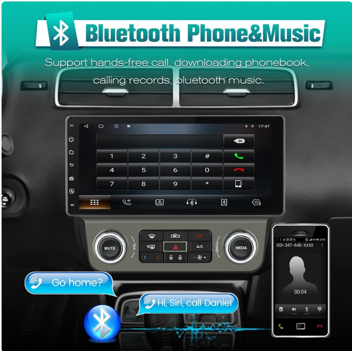
Screen displaying a phone dialer interface and Bluetooth call functionality.

Pair your smartphone via Bluetooth for hands-free calling and audio streaming. The built-in microphone ensures clear communication during calls.