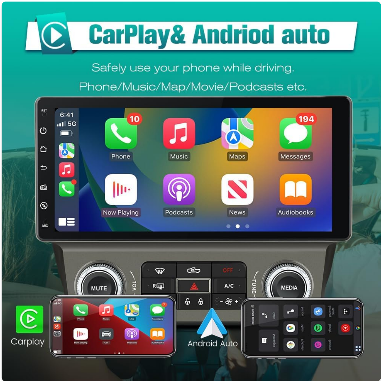
Screen showing both Apple CarPlay and Android Auto interfaces, highlighting smartphone integration.