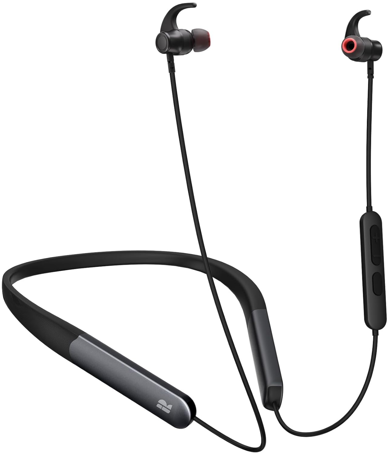
Image: Rythflo WH03 Bluetooth Headphones. This image displays the overall design of the headphones, including the flexible neckband, the in-ear earbuds with red accents and earhooks, and the inline control module on the right side.