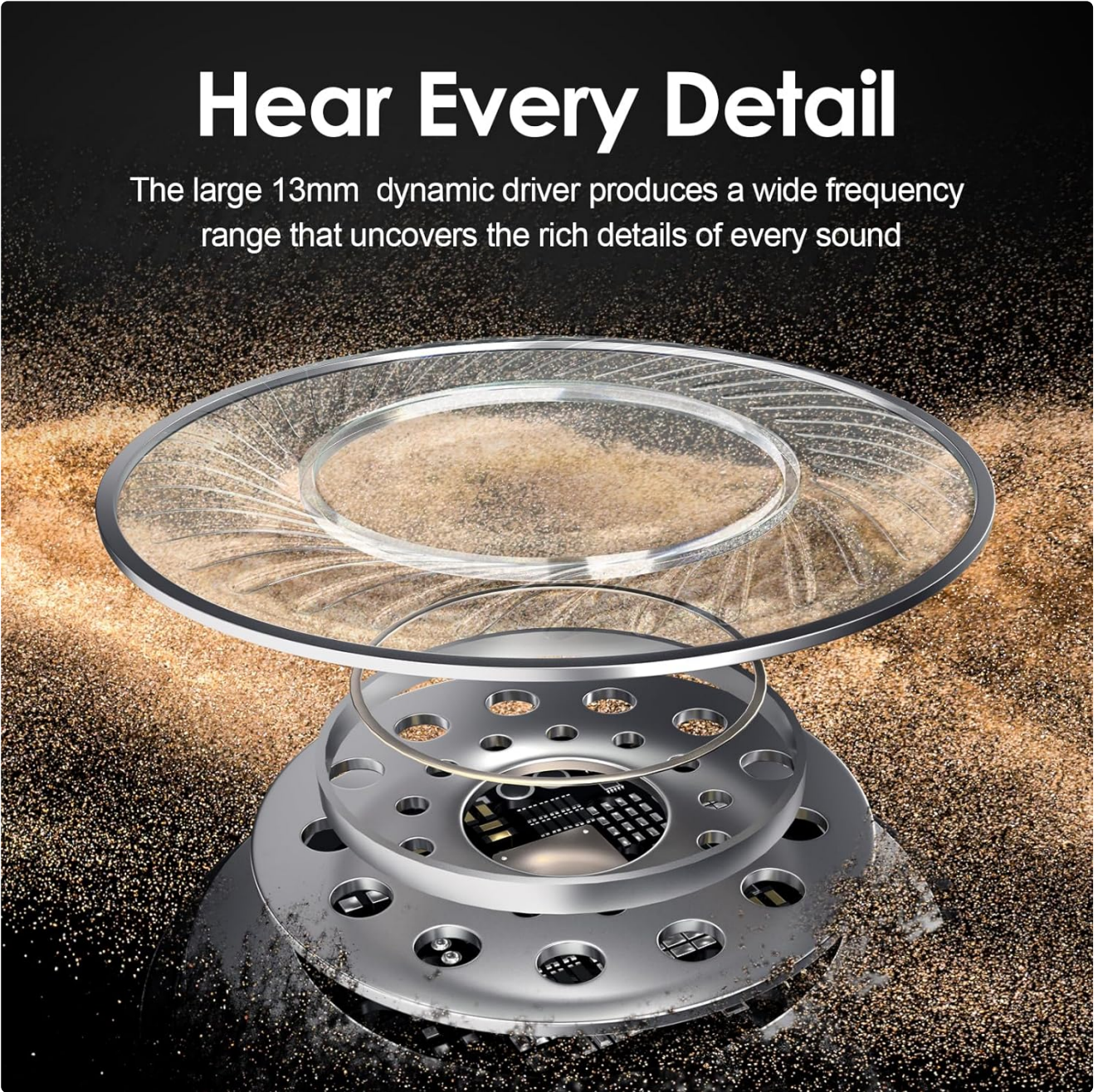
Image: An exploded view diagram of a 13mm dynamic audio driver, illustrating its internal components. This driver is responsible for delivering rich bass and clear audio in the Rythflo WH03 headphones.

The large 13mm dynamic driver produces a wide frequency range that uncovers the rich details of every sound