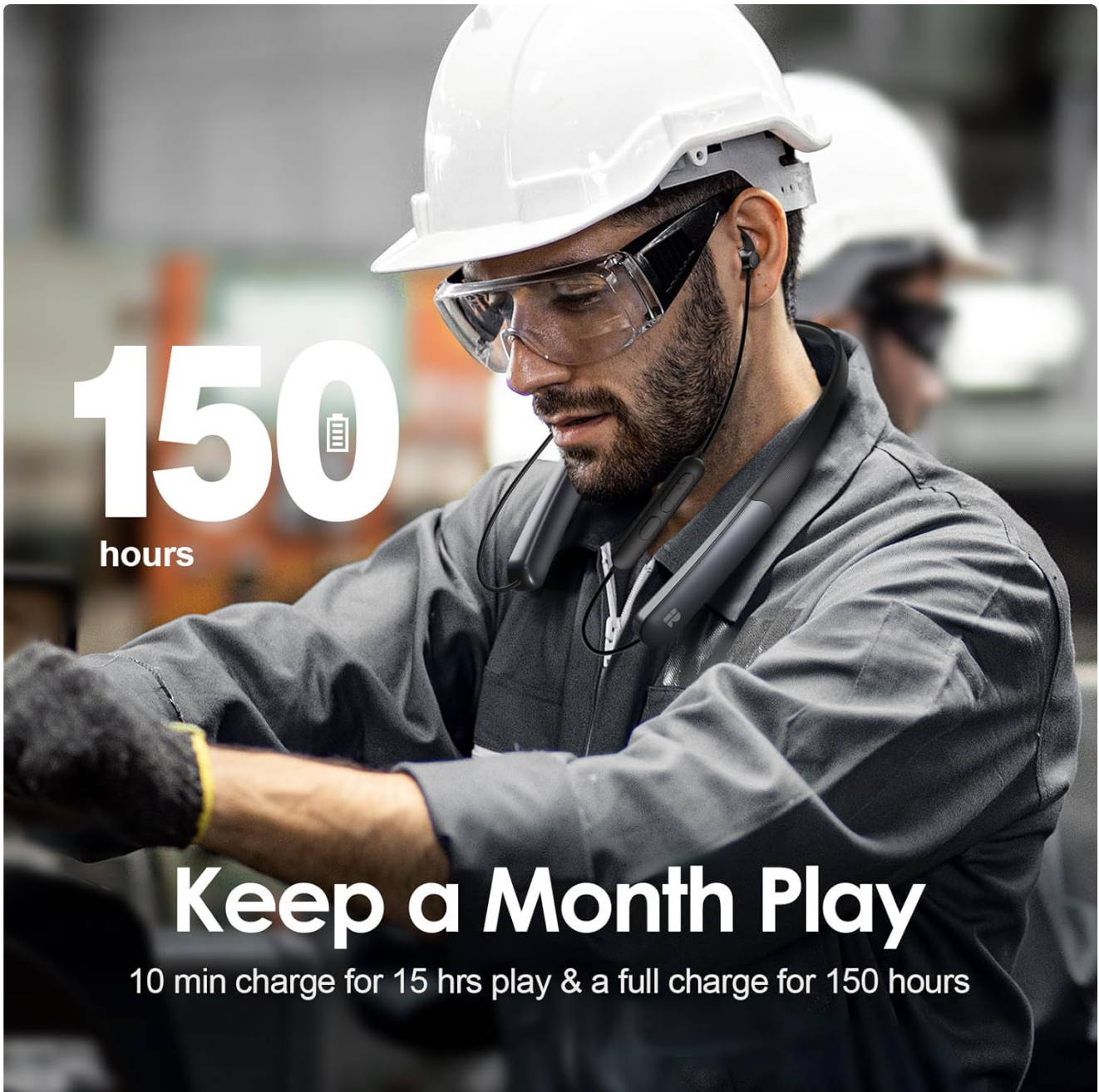
Image: A person wearing the Rythflo WH03 headphones in an industrial setting, highlighting the impressive 150-hour battery life and the convenience of a month's playtime on a single charge.