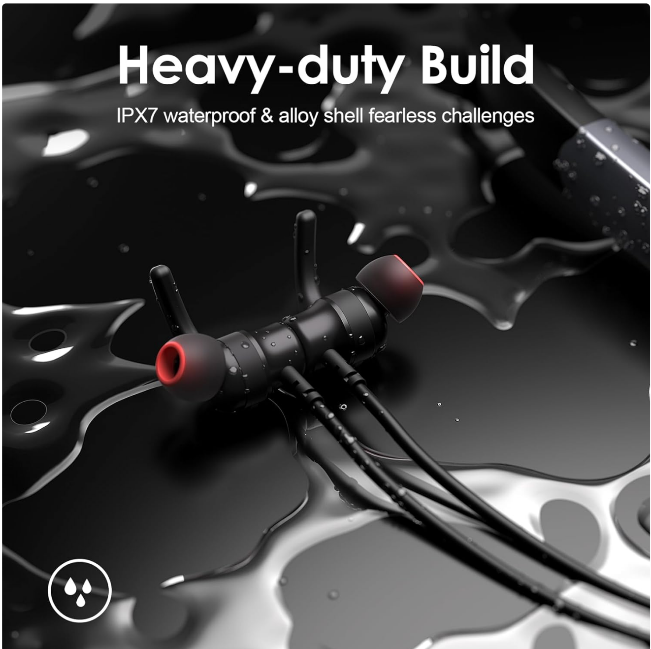
Image: Rythflo WH03 earbuds partially submerged in water, demonstrating their IPX7 water resistance and heavy-duty build, suitable for challenging environments.

IPX7 waterproof & alloy shell fearless challenges