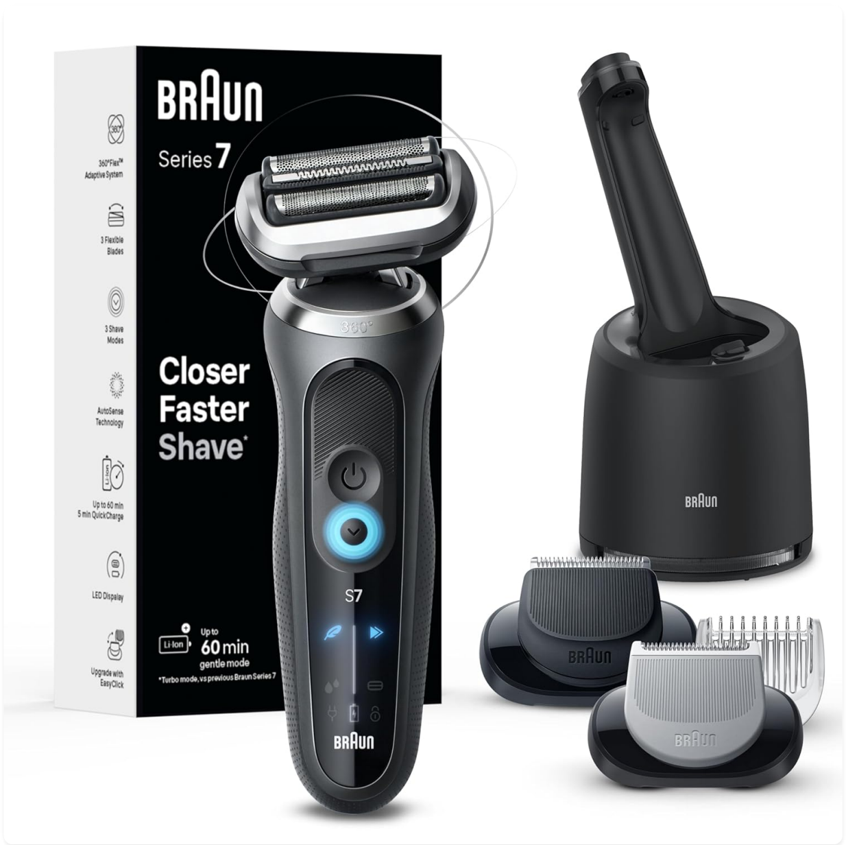
This image displays the complete Braun Series 7 7177cc electric shaver set, including the shaver unit, SmartCare Center, travel pouch, body groomer, and beard trimmer with various combs.