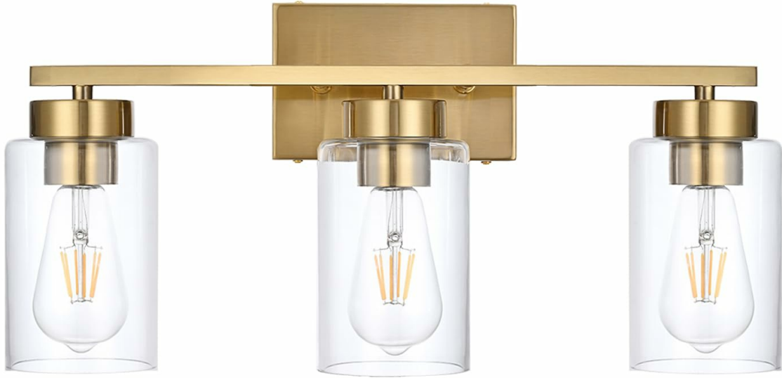
A1A9 3-Light Bathroom Vanity Light in Brushed Gold with Clear Glass Shades.