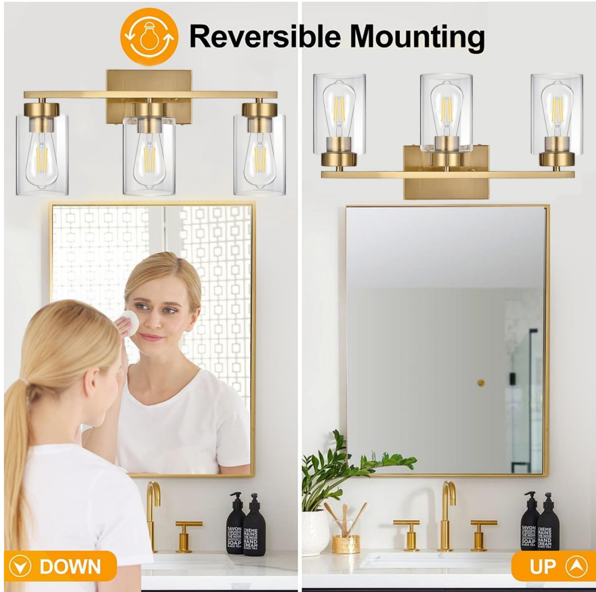
Illustration demonstrating the reversible mounting options (upwards or downwards) for the vanity light.

You can choose to install the light fixture with the glass shades facing up or down. Facing up casts more ambient light, while facing down provides more direct illumination, ideal for tasks over a vanity.