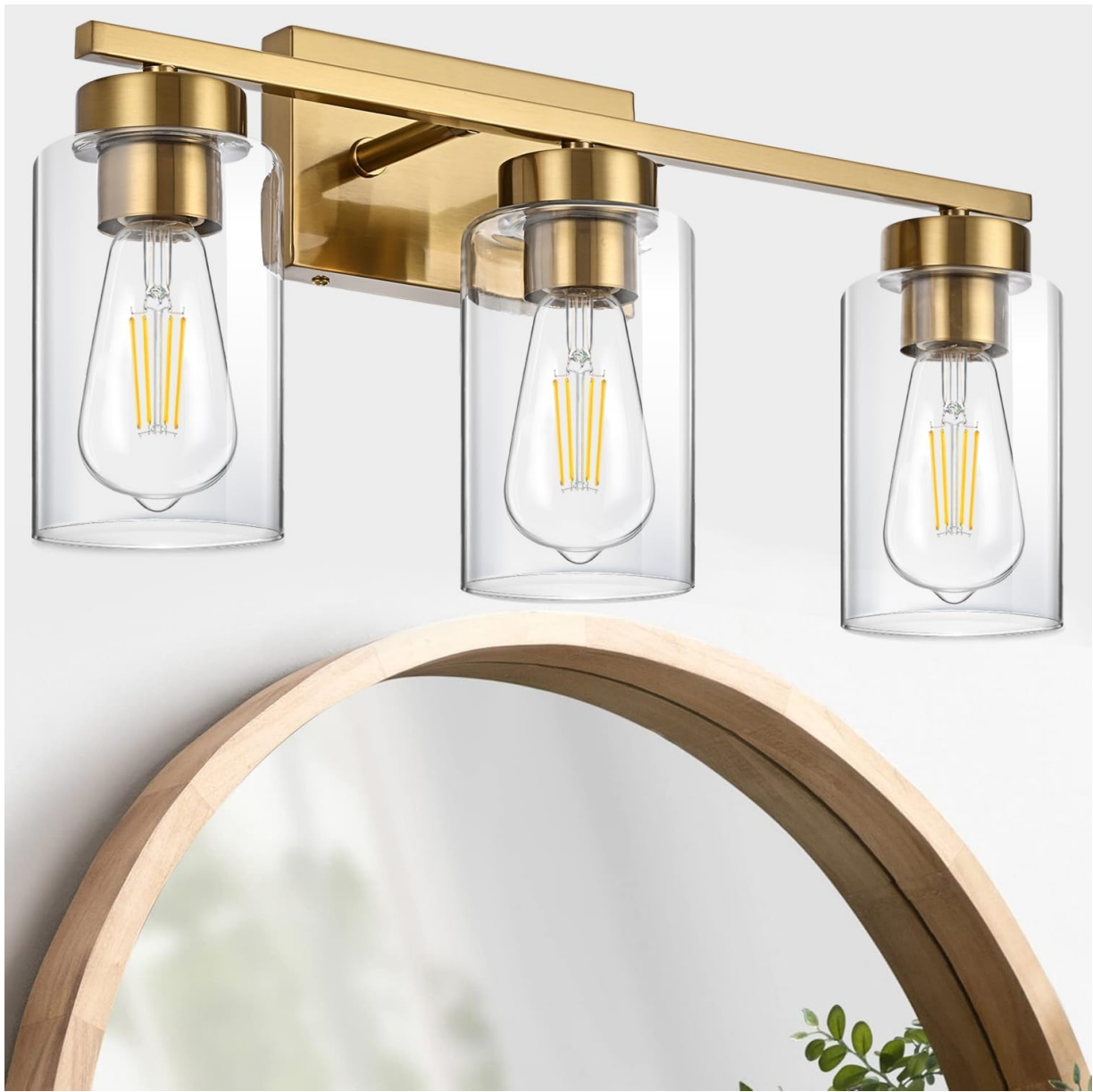
A1A9 3-Light Vanity Light installed above a round mirror in a bathroom.