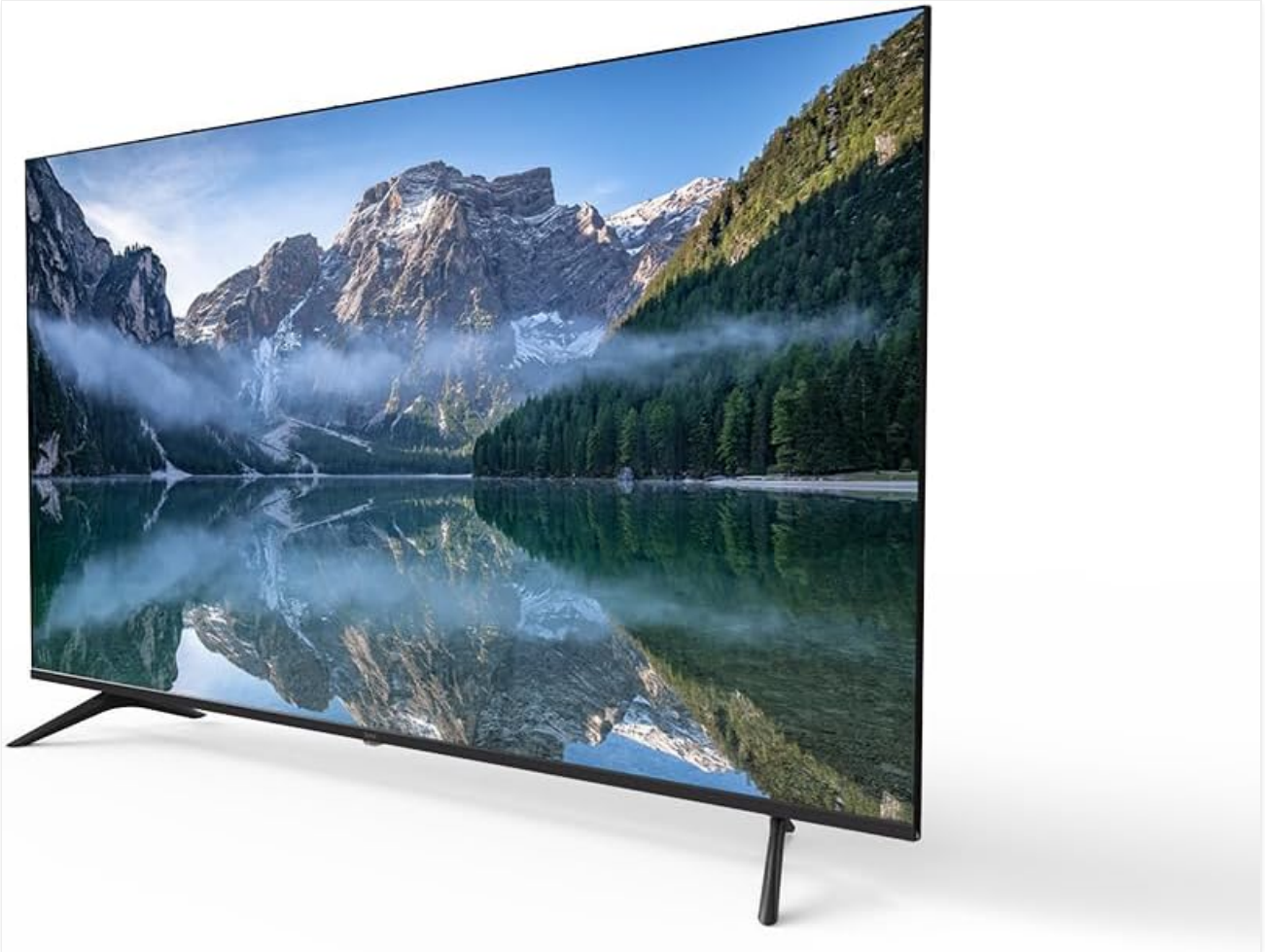
Image 3.1: Side view of the Synix 55 Inch FHD Smart LED TV, highlighting its slim profile and stand design.