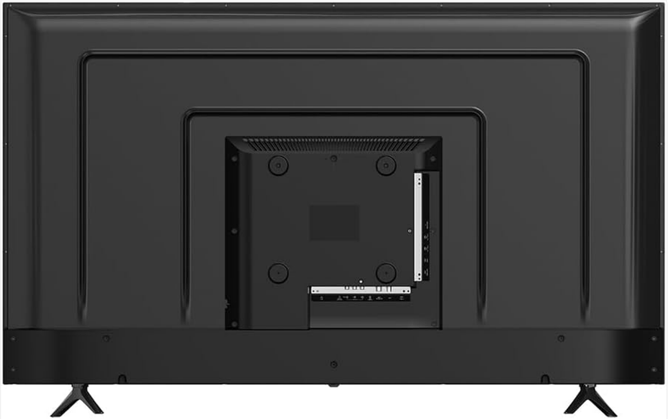
Image 4.1: Rear view of the Syinix 55 Inch FHD Smart LED TV, illustrating the arrangement of connectivity ports including HDMI, USB, and antenna input.