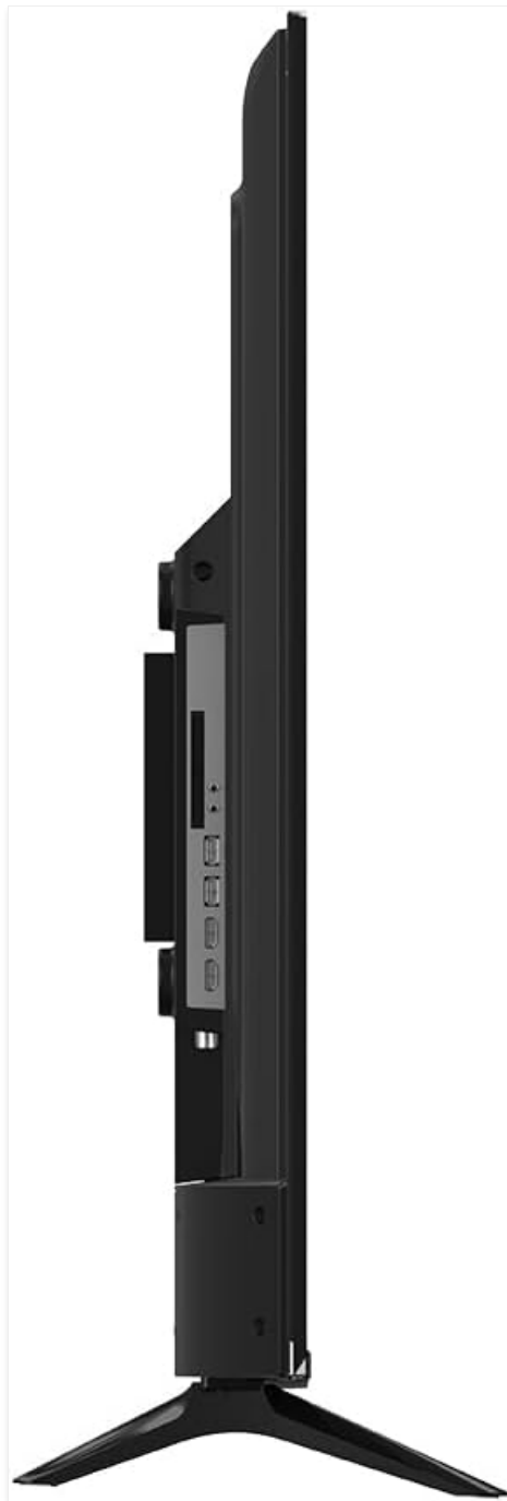
Image 4.2: Side profile of the Syinix 55 Inch FHD Smart LED TV, showing accessible side-mounted ports for convenience.