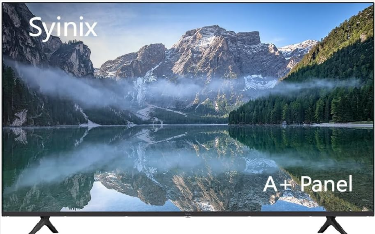
Image 1.1: Front view of the Synix 55 Inch FHD Smart LED TV displaying a vibrant landscape. The TV features a slim bezel and two

Thank you for choosing the Synix 55 Inch FHD Smart LED TV, Model 55U51. This manual provides essential information for the safe and efficient use of your new television. Please read it thoroughly before operating the device and retain it for future reference. This television combines a Full High Definition (FHD) display with smart functionalities and a built-in receiver, offering a complete entertainment solution.