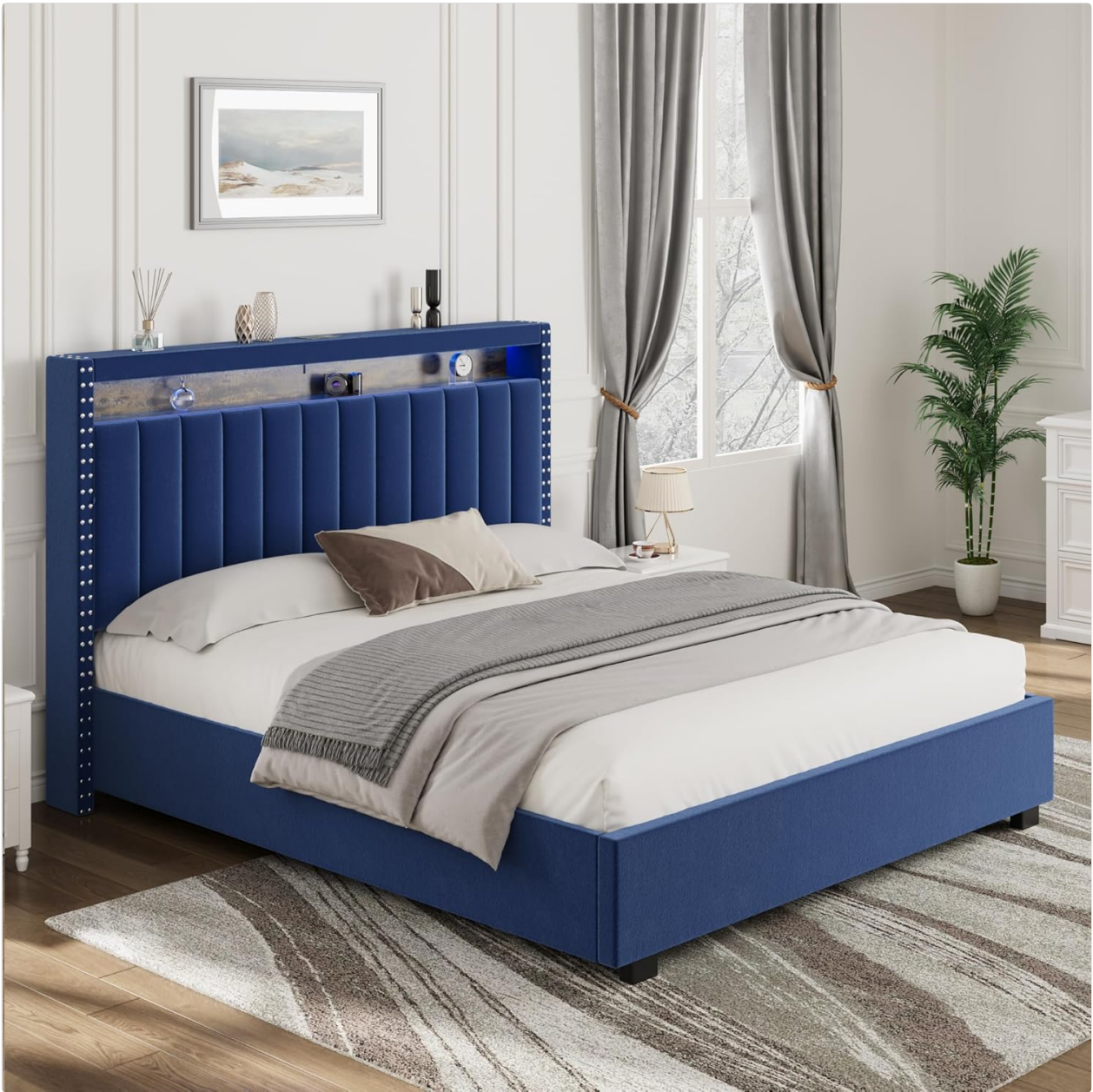
Figure 5.1: Headboard with LED lights illuminated, showcasing the ambient lighting feature.