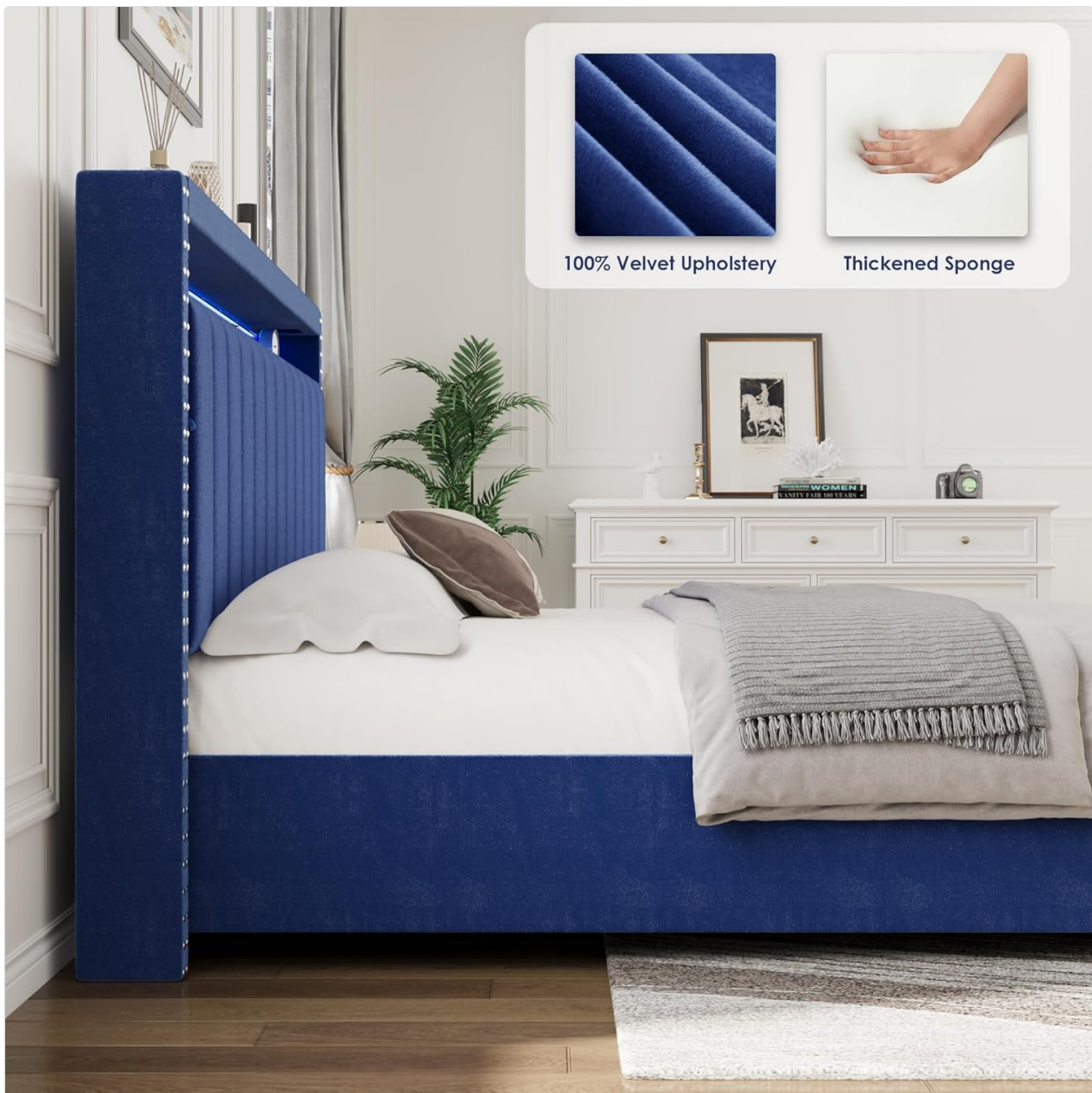
Figure 6.1: Side view of the bed, showcasing the velvet upholstery.