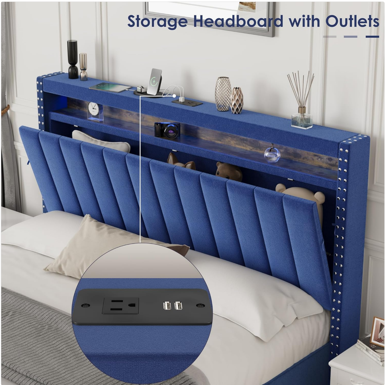
Figure 5.4: Headboard with integrated shelf and power outlets.