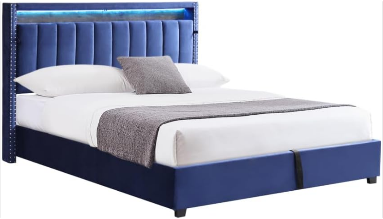
Figure 4.2: Bed frame without mattress, illustrating the slat system and headboard with integrated shelf.