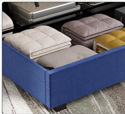
Large Storage Space