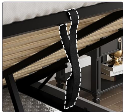
Hydraulic Lift Mechanism