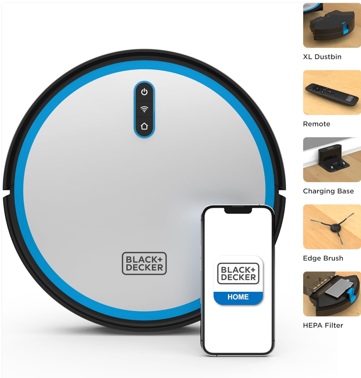
Image: The BLACK+DECKER Roboseries Robot Vacuum shown with its charging base, remote control, dustbin, edge brush, and HEPA filter, illustrating the complete package contents.