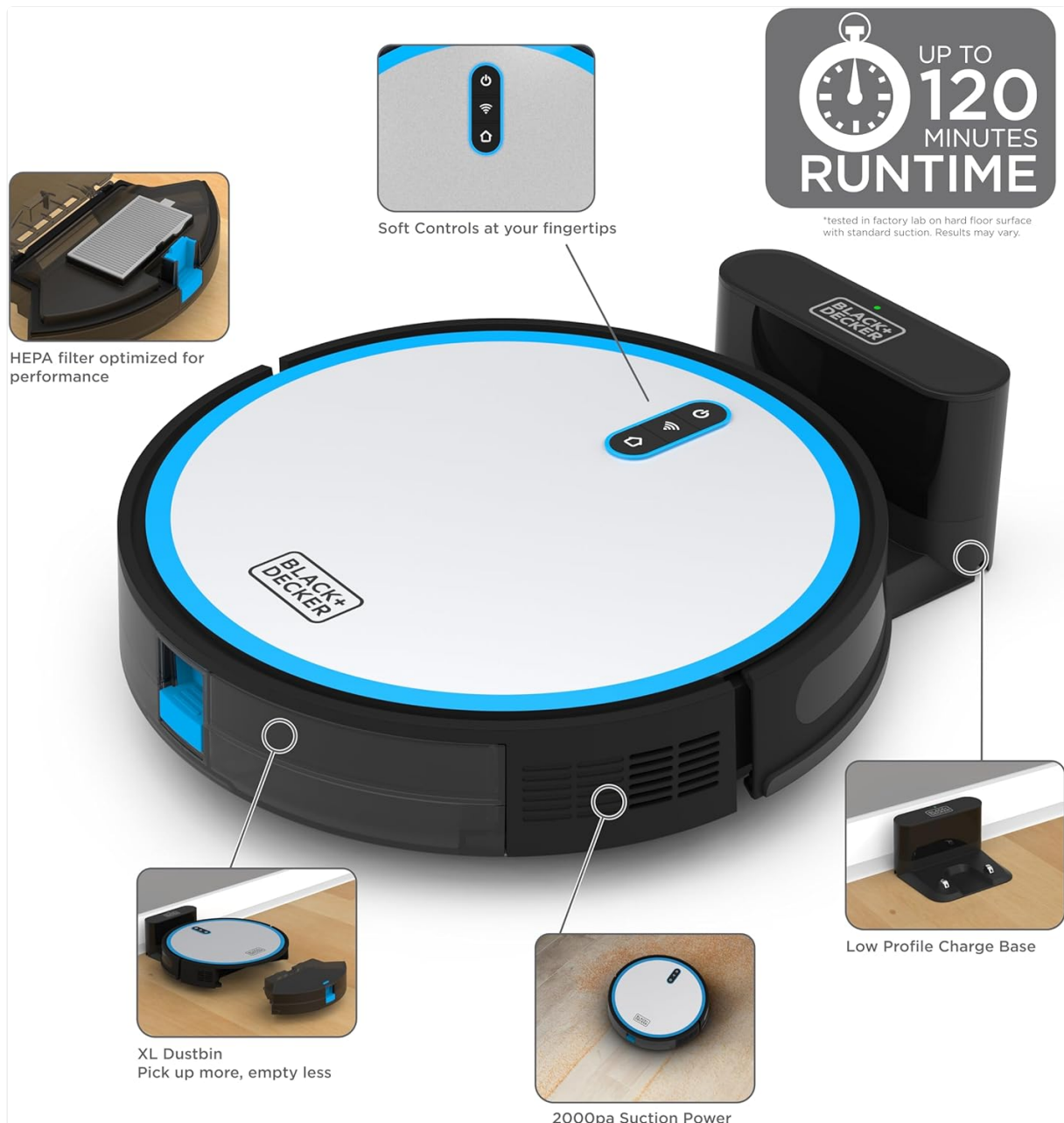
Image: A detailed diagram highlighting key features of the robot vacuum, including soft controls, HEPA filter, XL dustbin, 2000Pa suction power, and the low-profile charge base.