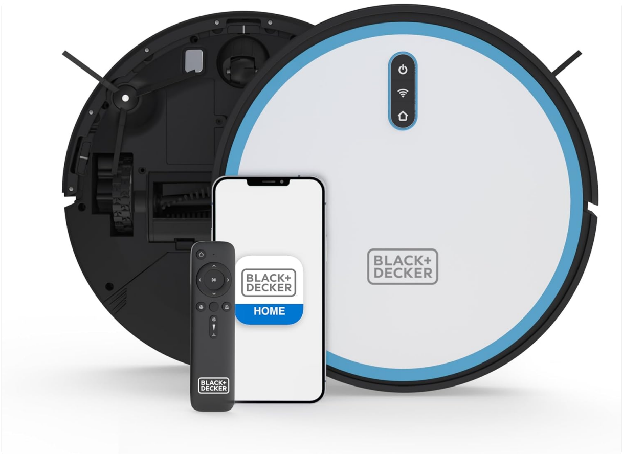
Image: The BLACK+DECKER Roboseries Robot Vacuum, its remote control, and a smartphone displaying the BLACK+DECKER HOME app interface.