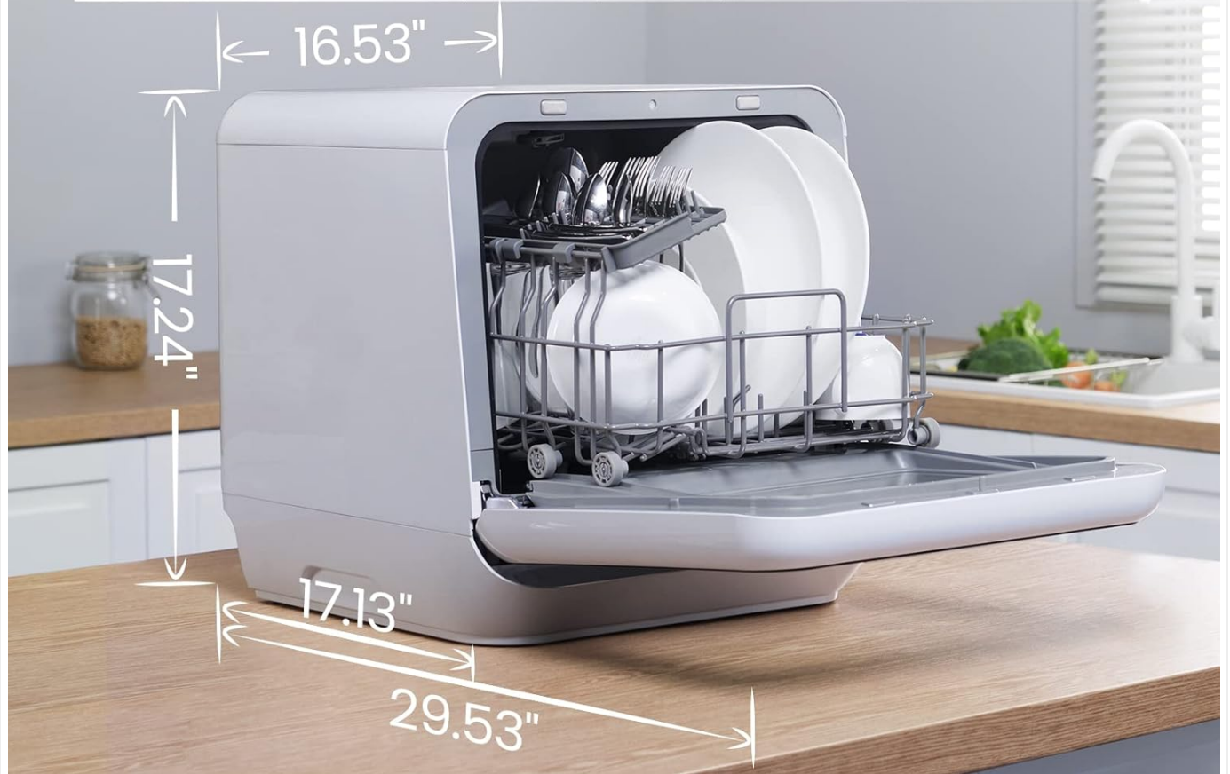
Image 1.3: Dimensions and internal capacity of the COMFEE' Portable Dishwasher.

*Please make sure the distance between your countertop and wall cupboard is more than 19.7"