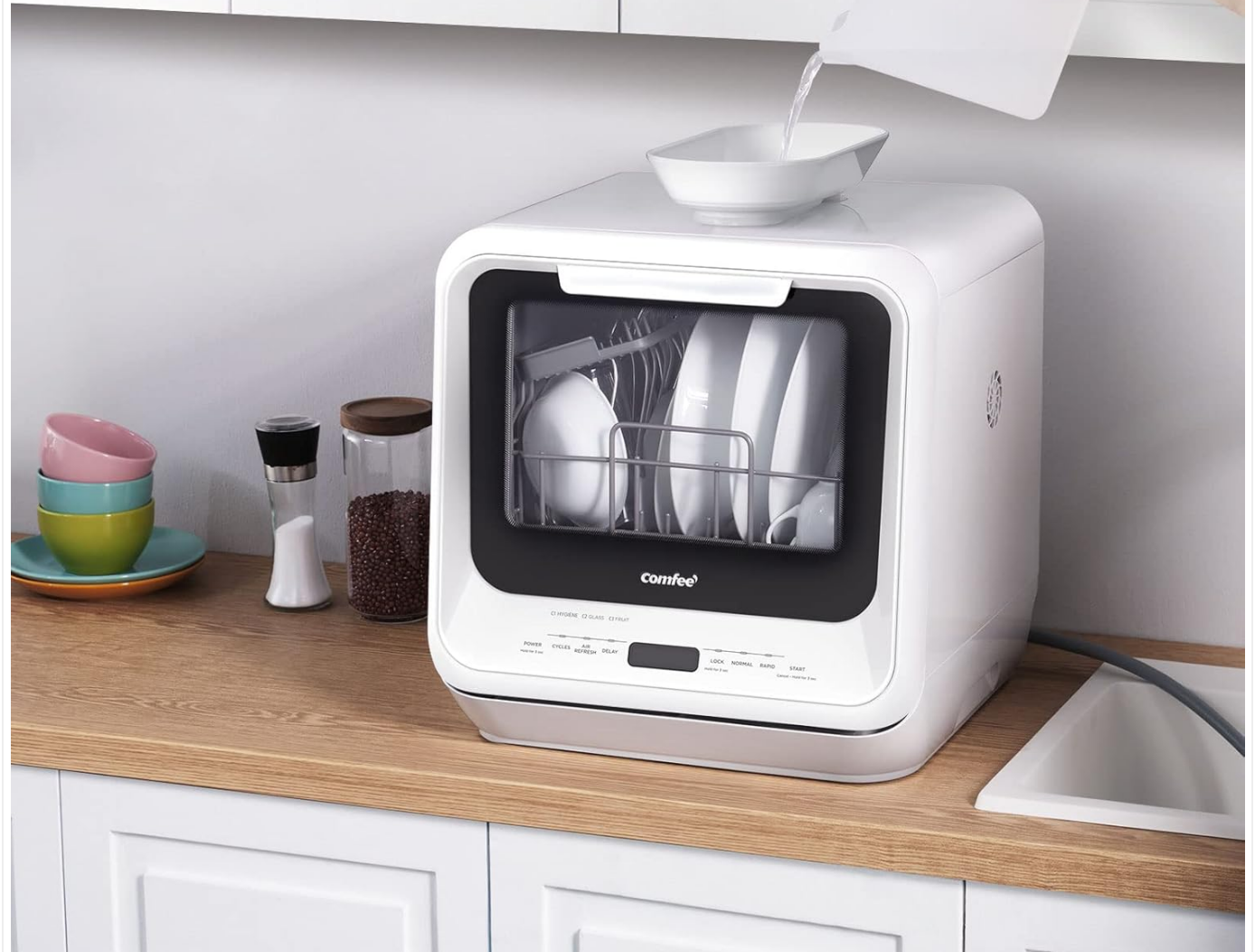
Image 2.1: Manually filling the COMFEE' Portable Dishwasher's built-in water tank.

With 5L Built-in Water Tank, You will Never Need a Water Hookup.