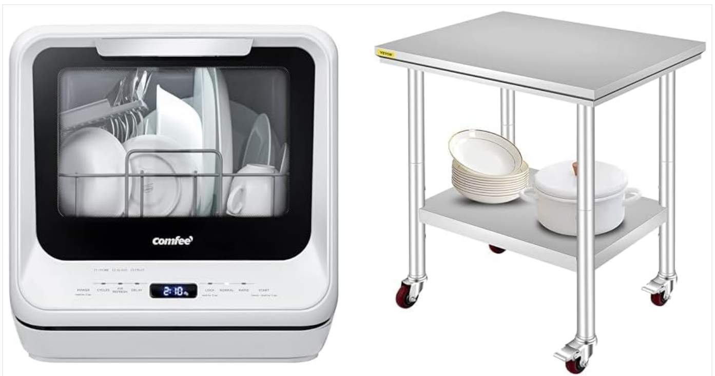
Image 1.1: COMFEE' Portable Dishwasher and Mophorn Stainless Steel Work Table Bundle.

This manual provides detailed instructions for the COMFEE' Portable Countertop Dishwasher and the Mophorn Stainless Steel Work Table, which are bundled together to offer a complete solution for compact dishwashing and versatile kitchen workspace. Please read this manual thoroughly before using the products to ensure proper operation and maintenance.