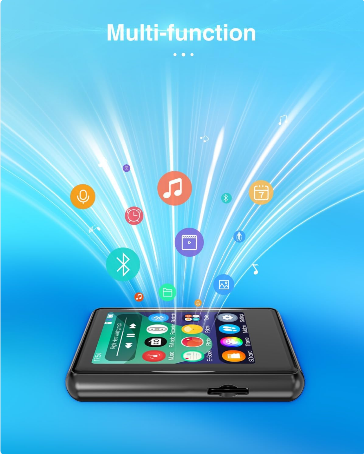
Figure 9: Multi-functional Capabilities

The device includes additional tools such as a calendar, alarm clock, and stopwatch. Access these by tapping the 'Tools' icon.