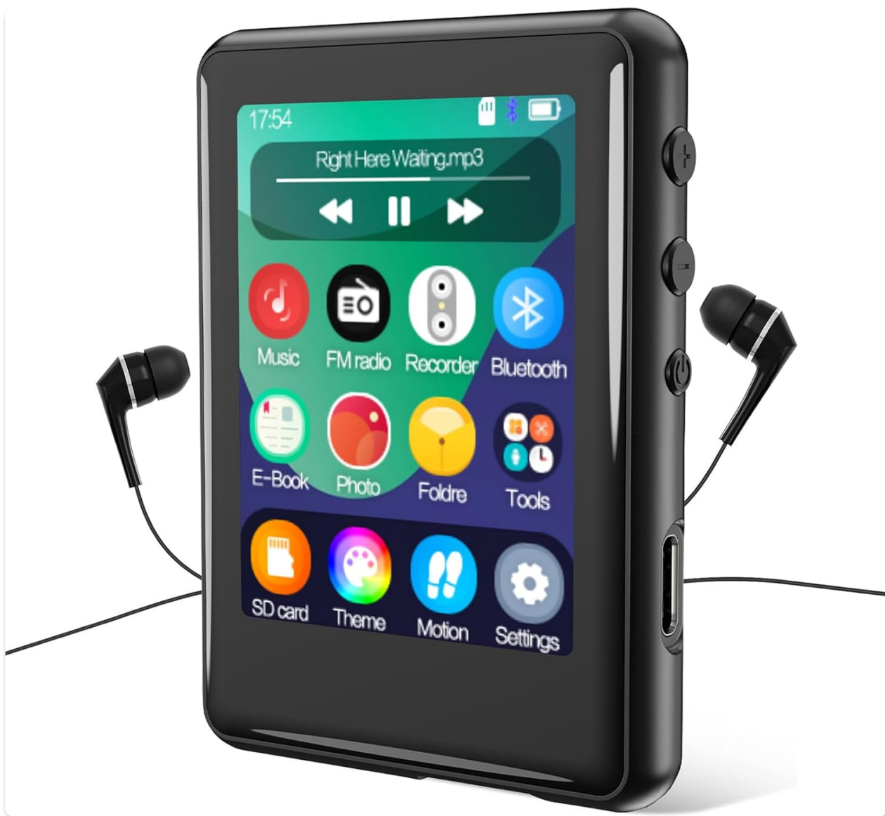
Figure 1: Tokemisc MP3 Player with Bluetooth 5.3