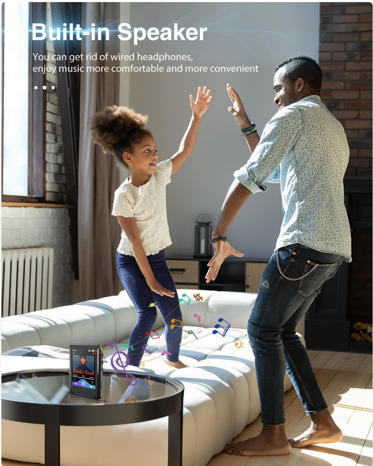
Figure 6: Built-in Speaker Functionality