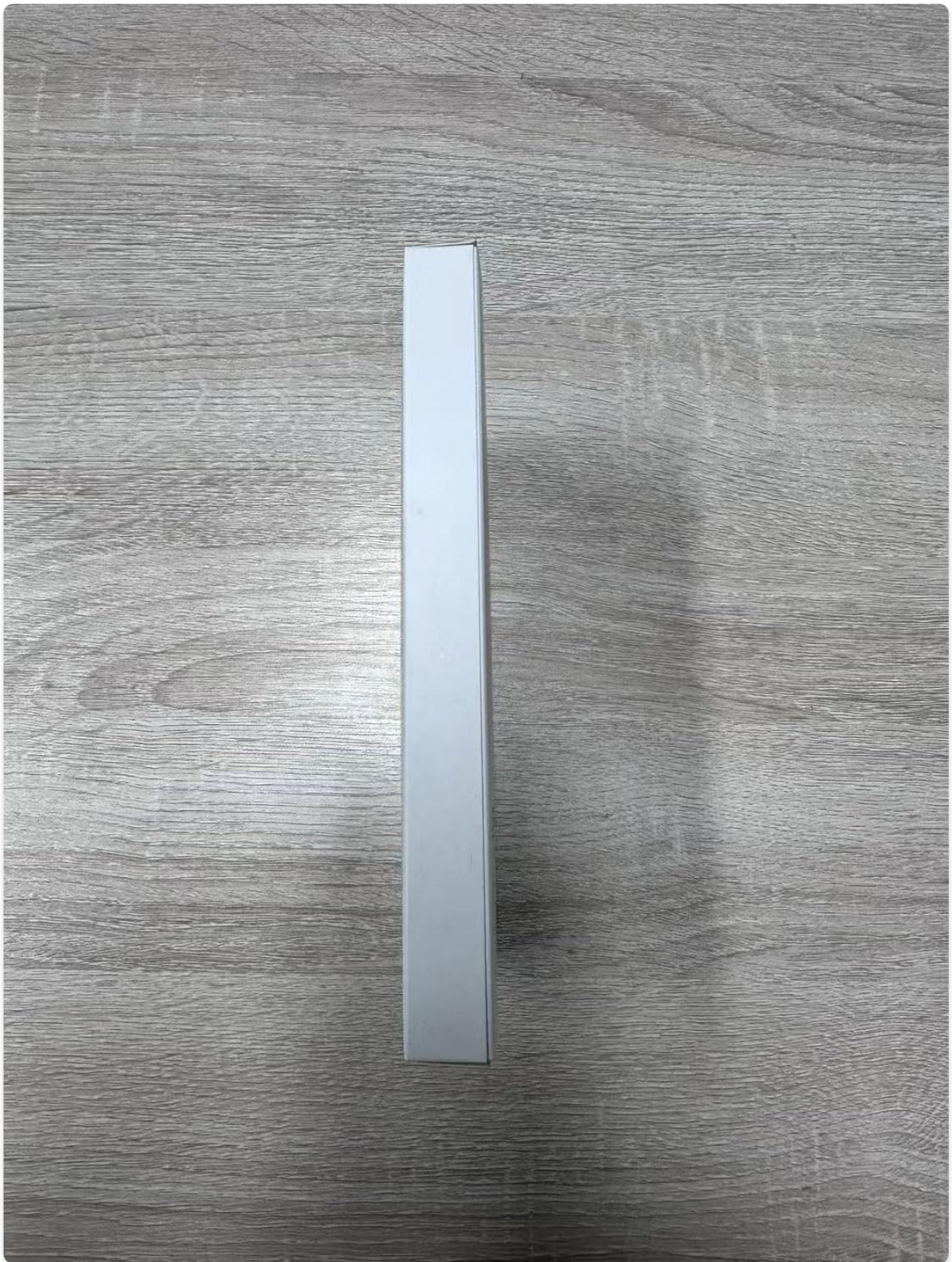
Figure 3: Side View of Packaging

Your browser does not support the video tag.