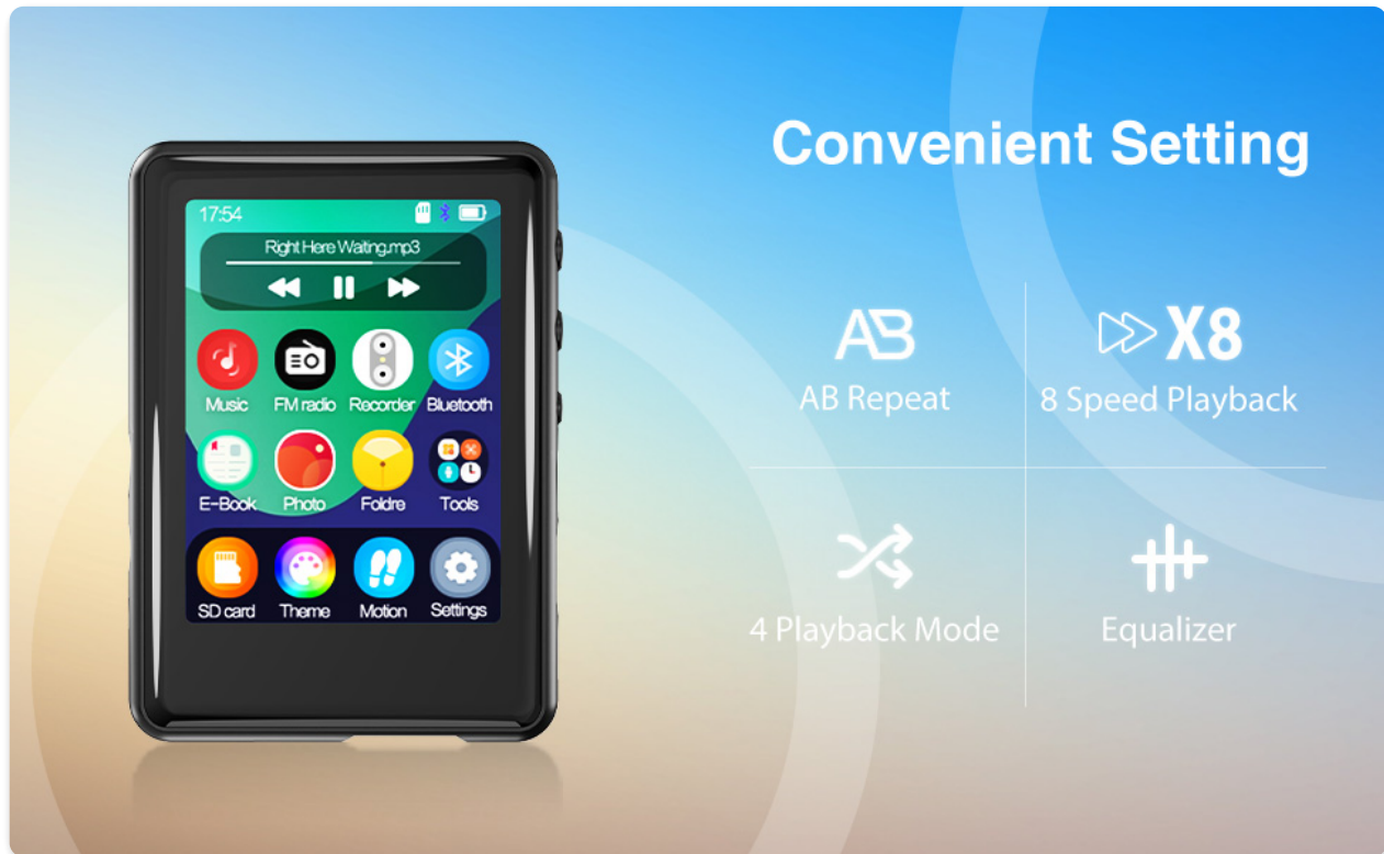
Figure 5: Touchscreen Gesture Controls

The MP3 player features a full-touch screen with upgraded gesture operation. Navigate through menus and options by tapping and swiping. Swipe from left to right on the left side of the screen to return to the previous screen. Swipe from bottom to top on the bottom of the screen to exit to the main screen.