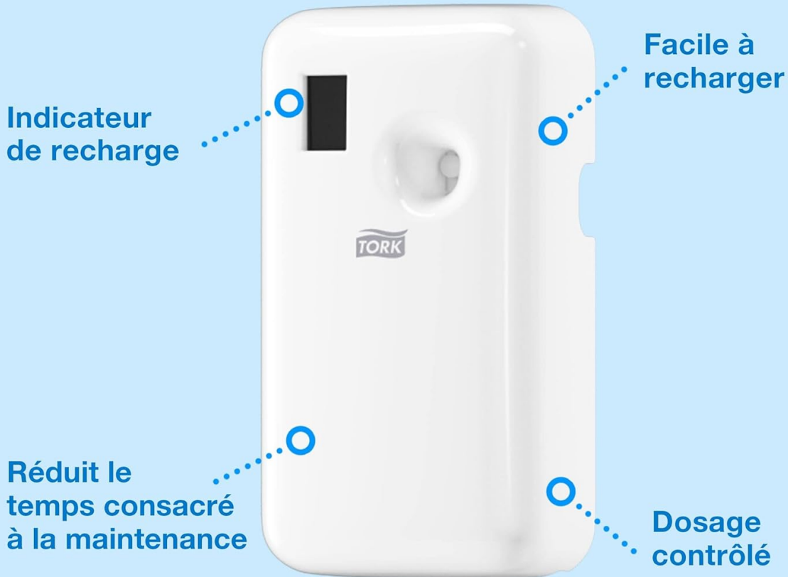
Figure 4: Key features of the Tork A1 dispenser, including the refill indicator and controlled dosage mechanism.

Crée une sensation de fraîcheur et de propreté