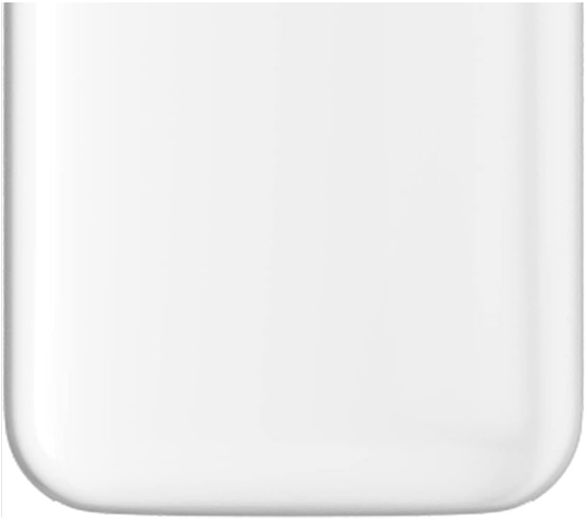
Figure 1: Tork 562000 A1 Air Freshener Dispenser (white model).