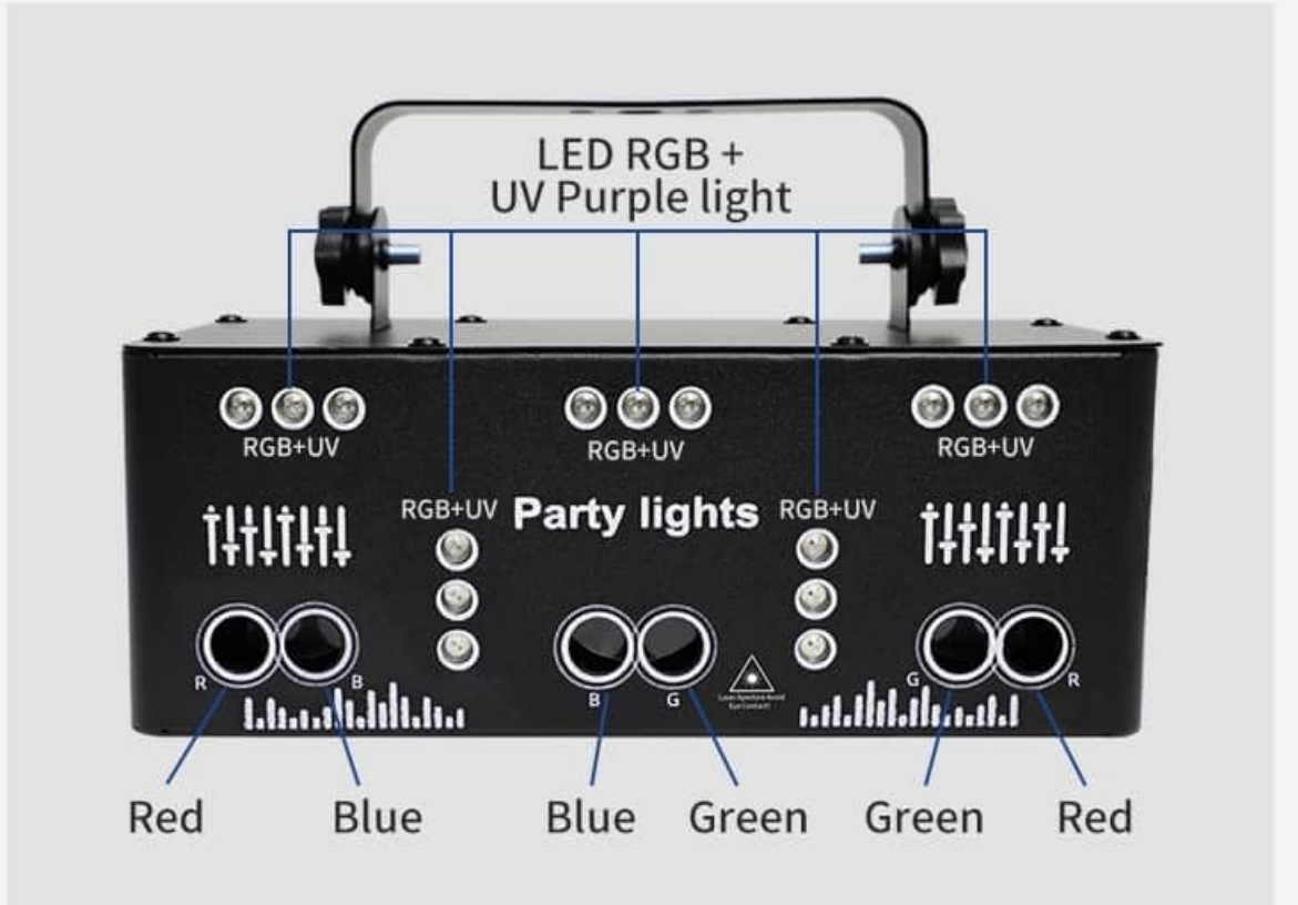
Image: Breakdown of the light's components, showing the arrangement of Red, Blue, Green, and UV LEDs and lasers.