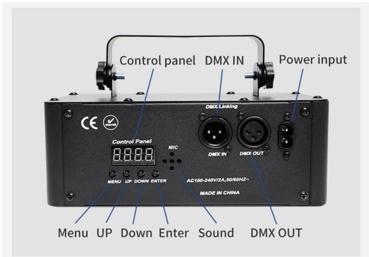
Image: Rear panel of the light, highlighting the power input and control buttons.