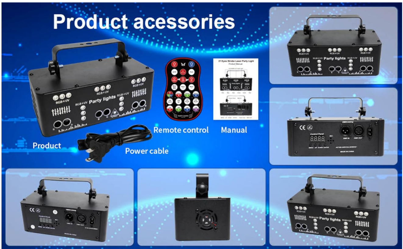
Image: Contents of the product package, showing the main light unit, remote control, power cable, and user manual.