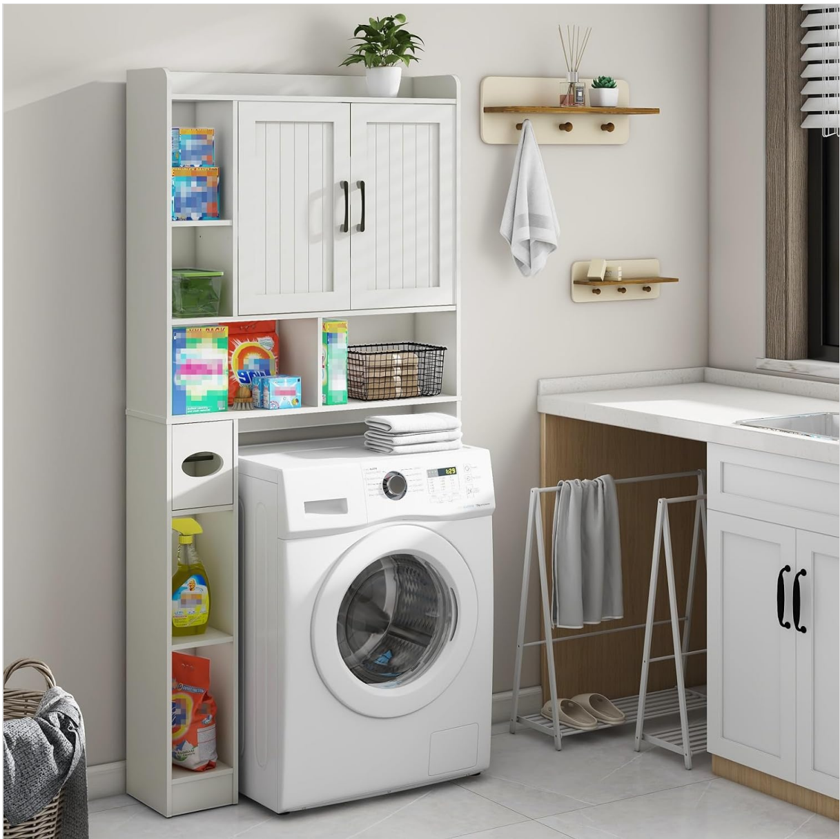
Image: The Vabches storage cabinet positioned over a washing machine in a laundry room, demonstrating its versatility beyond just toilet placement.