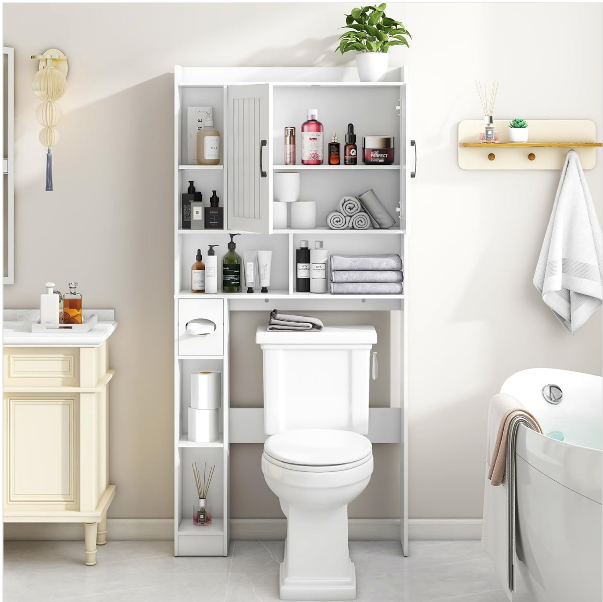
Image: The Vabches Over the Toilet Storage Cabinet with its barn doors open, revealing the interior storage compartments and adjustable shelves filled with various bathroom items.