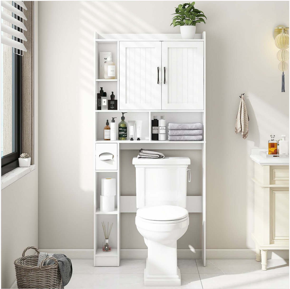
Image: The Vabches Over The Toilet Storage Cabinet, white with barn doors, positioned over a toilet in a modern bathroom, showcasing its design and functionality.