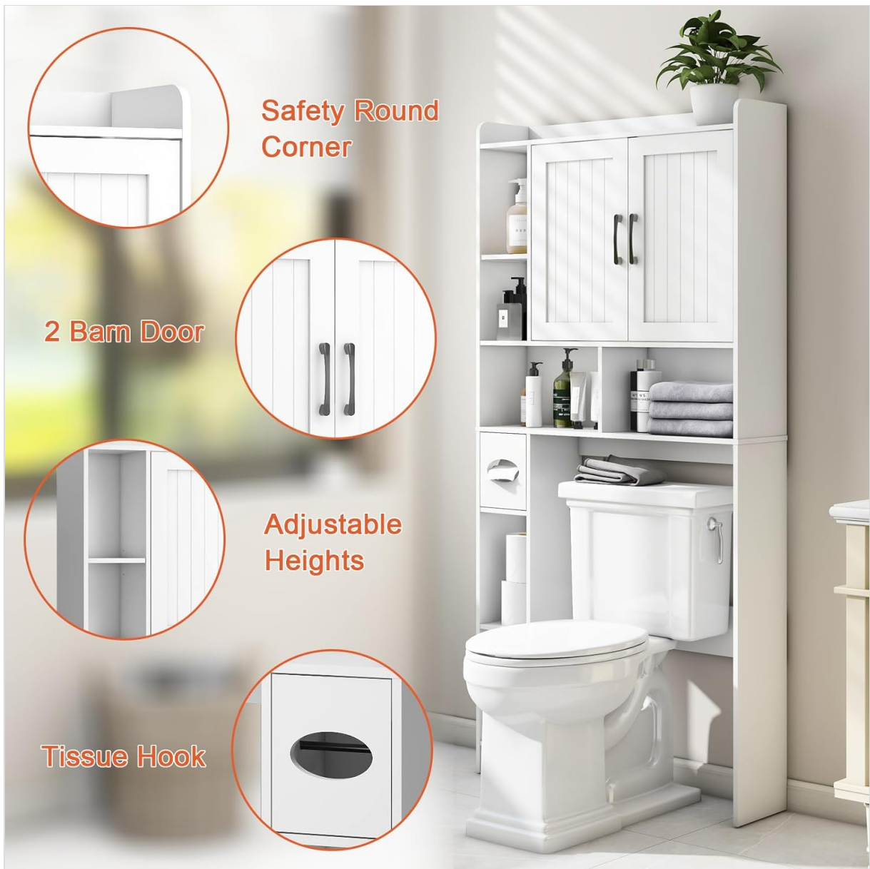
Image: A detailed view highlighting the safety round corners, the design of the barn doors, the adjustable height feature of the shelves, and the integrated tissue hook.