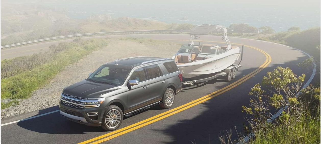
Image: Excellence and Performance features of the nerf bars.