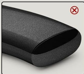
Textured Black Powder Coating