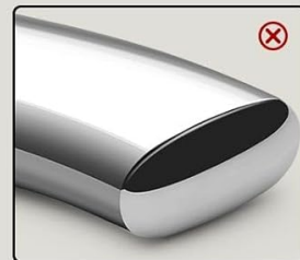
S/S 304 Polished Coating

Image: Triple Surface Process for enhanced durability and finish.