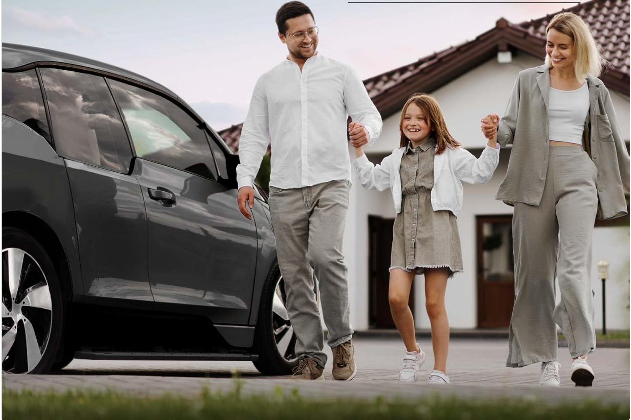
Image: Premium Product Metrics for YHTAUTO Nerf Bars.