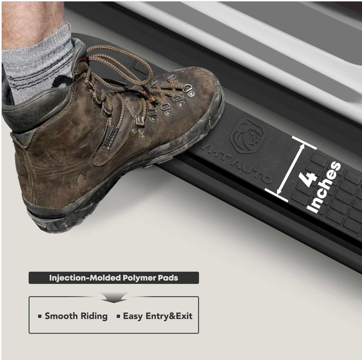
Image: Detail of the 4-inch wide injection-molded polymer step pad.

Image: Demonstrating the use of the nerf bar and its weight capacity.