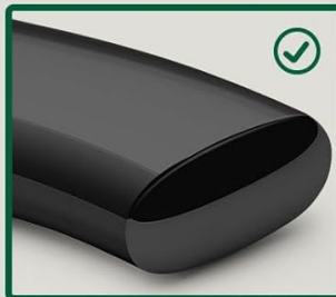
Semi-Gloss Black Power Coating