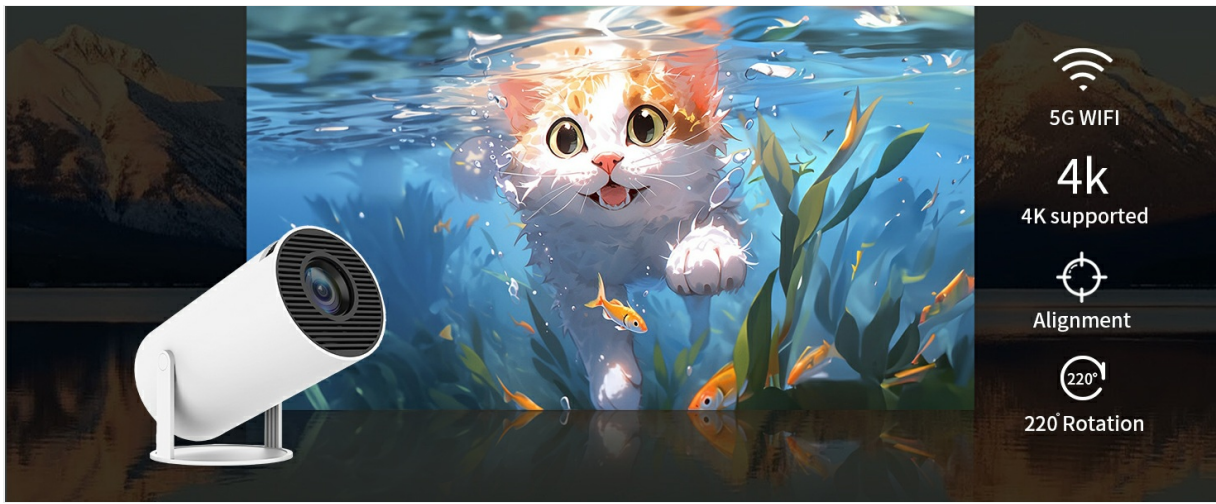
Image Description: A split image showing the LQWELL HY300 Mini Projector projecting a clear image at night, emphasizing its 5G WiFi capabilities for fast and lag-free screen synchronization compared to other projectors.