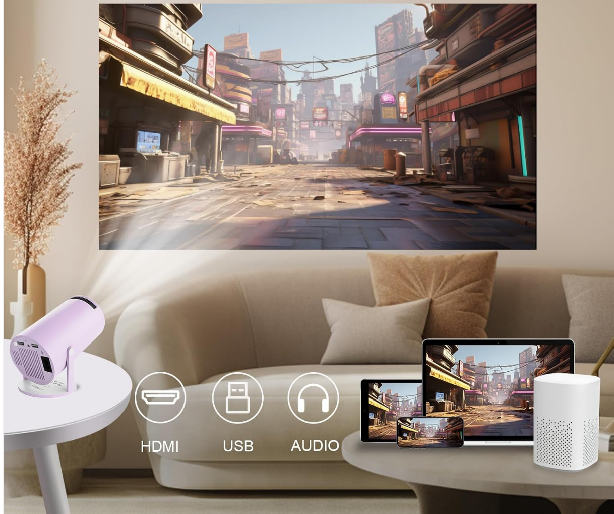
Image Description: The LQWELL HY300 Mini Projector shown connected to a smartphone, PC, laptop, and Bluetooth speaker, illustrating its multi-device compatibility via HDMI, USB, and Audio ports.

Smartphone/PC/Laptop/Tablet/Bluetooth Speaker/Headphone