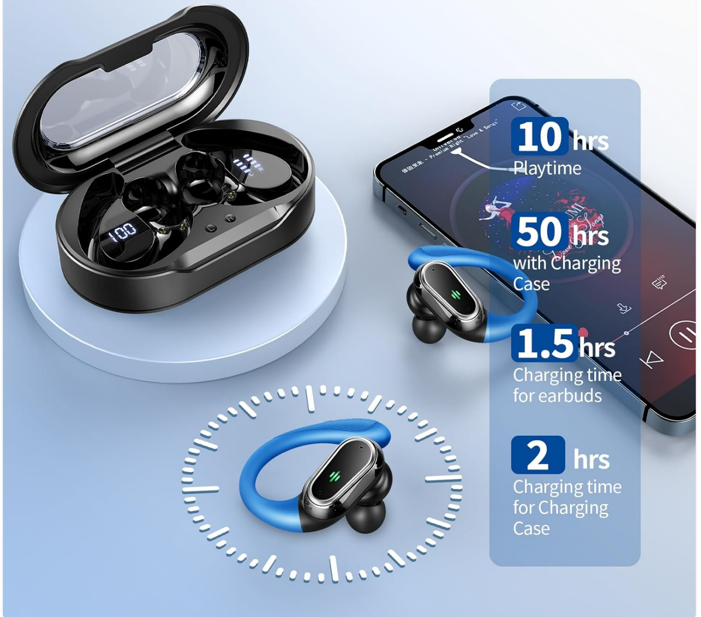
Figure 3.1: Battery Life and Charging Information.