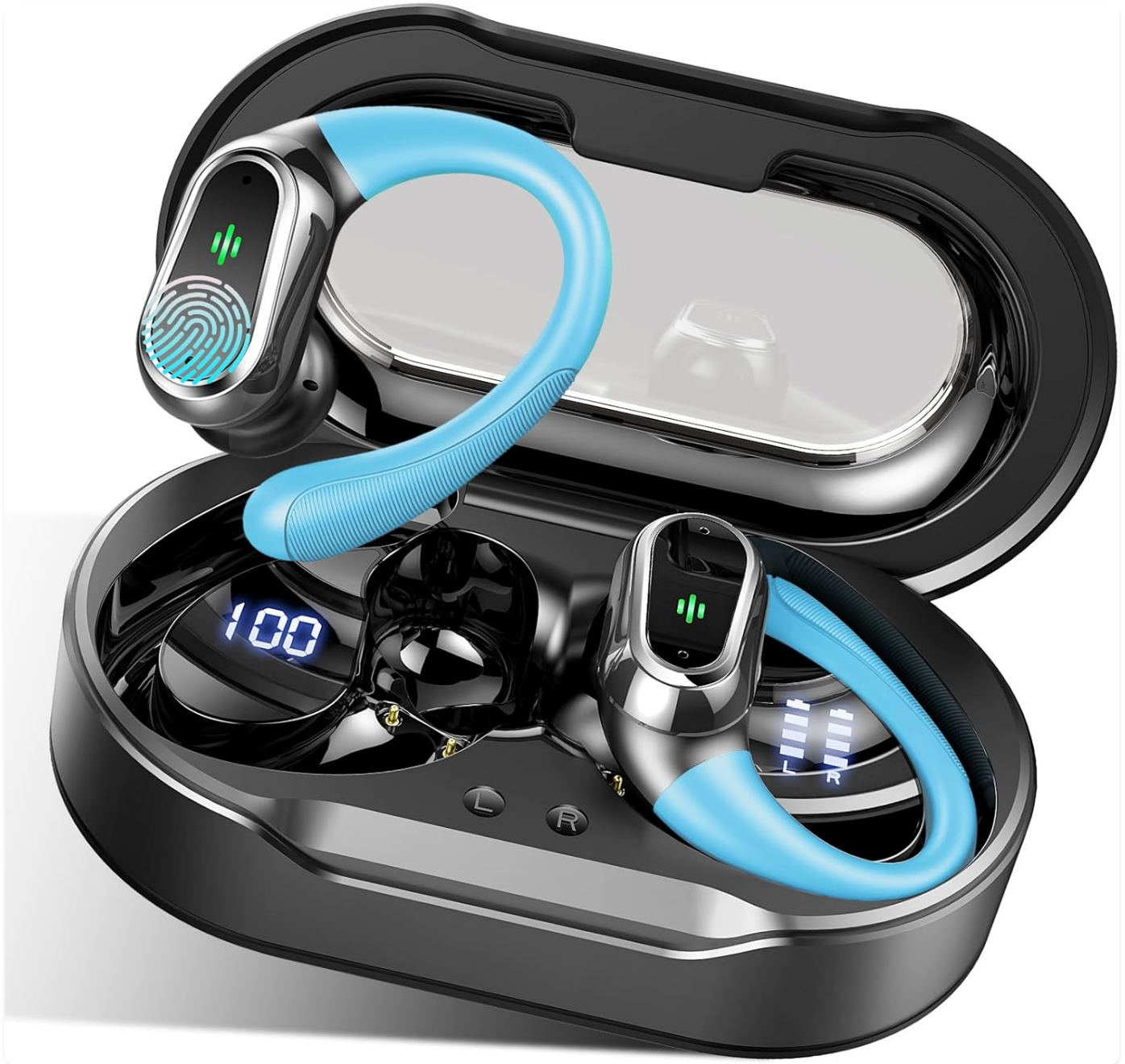
Figure 1.1: Rolosar Q76 Wireless Earbuds and Charging Case.