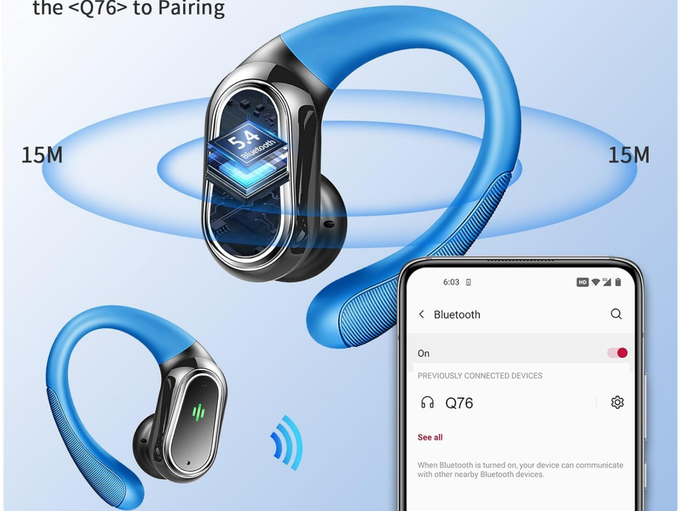
Figure 3.2: Bluetooth Pairing Steps.

Step2: After open the Phone Bluetooth, Click the <Q76> to Pairing