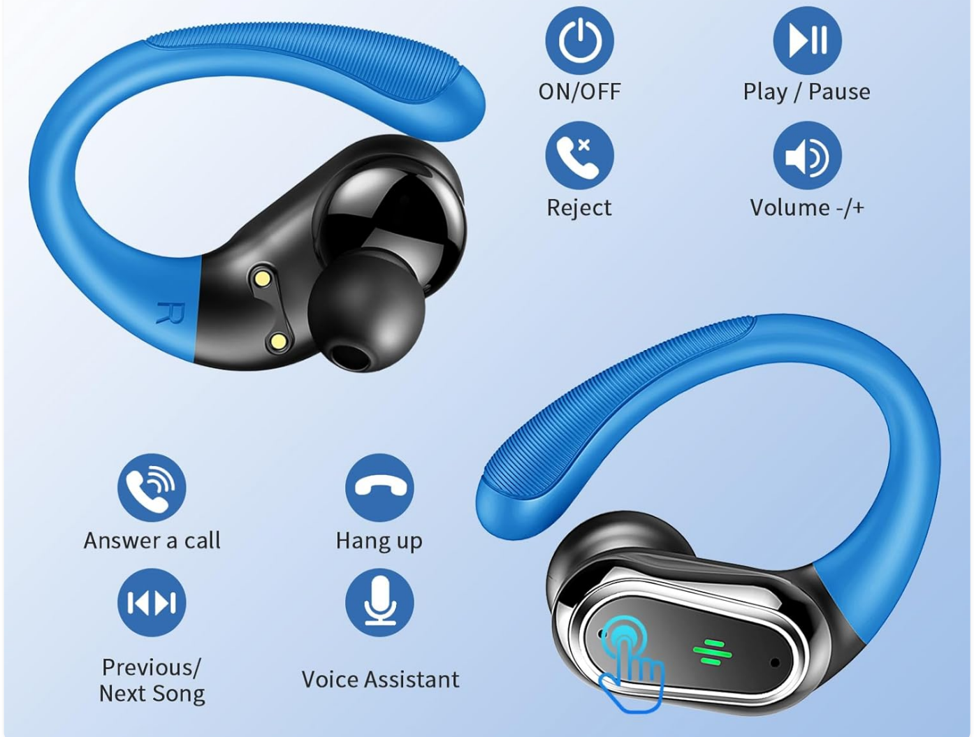
Figure 4.1: Smart Touch Control Functions.

High-sensitivity smart touch brings easy operation