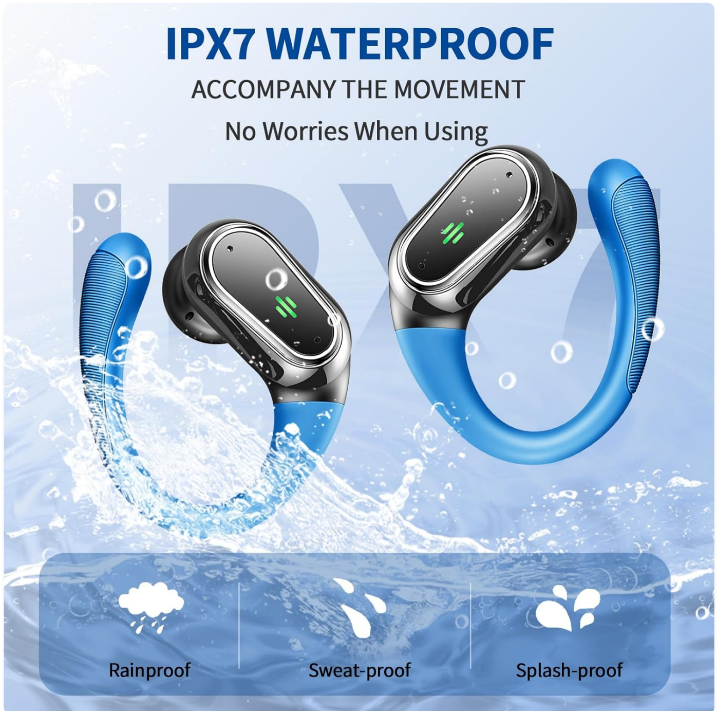
Figure 5.1: IPX7 Waterproof Feature.

The Rolosar Q76 earbuds are rated IP7 waterproof, meaning they can resist sweat, rain, and minor water splashes. They are suitable for workouts and outdoor activities.