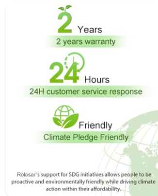
Figure 8.1: Warranty and Customer Service Commitment.

Your Rolosar Q76 Wireless Earbuds come with a 2-year warranty from the date of purchase, covering manufacturing defects. Please retain your proof of purchase for warranty claims.