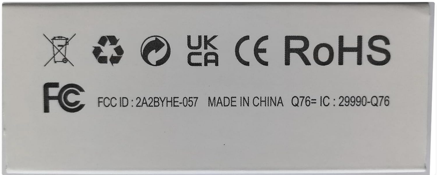
Figure 8.3: Regulatory Compliance Markings.

This device complies with relevant regulatory standards.