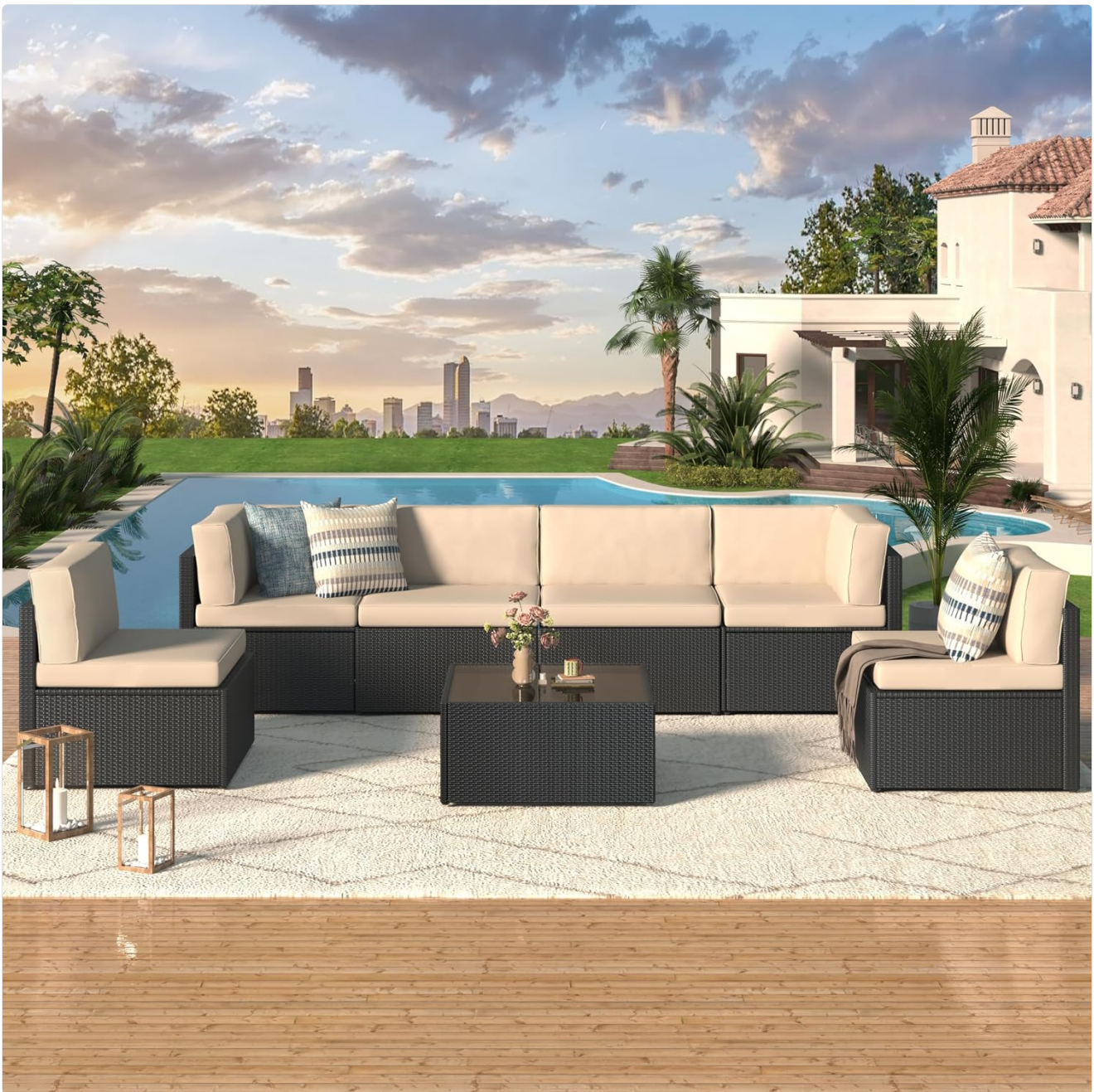
Figure 3: The U-MAX 7-piece patio set in a typical L-shaped configuration, demonstrating its aesthetic appeal in an outdoor setting.