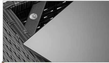
Durable Tempered Glass