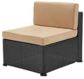
Armless Sofa X 4