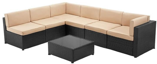
Figure 2: Examples of multiple free combinations possible with the modular design, illustrating how armless sofas, corner sofas, and the coffee table can be arranged.