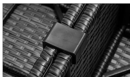
Sofa Fastener Clips Preventing Moving