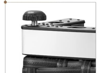
Adjustable Rubber Feet