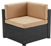
Corner Sofa X 2