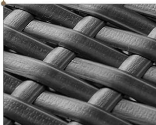
High Quality Hand-Woven PE Wicker